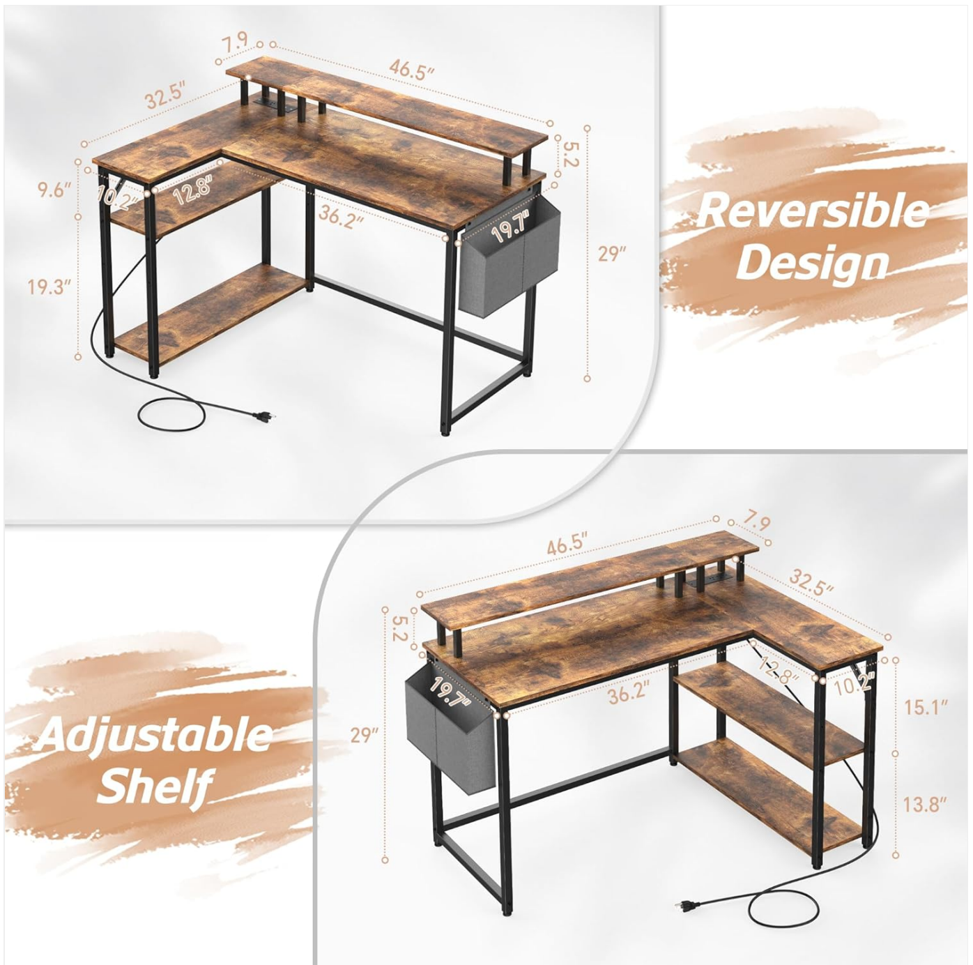
Image: The L-shaped desk with its reversible design, allowing the shelving unit to be placed on either the left or right side.