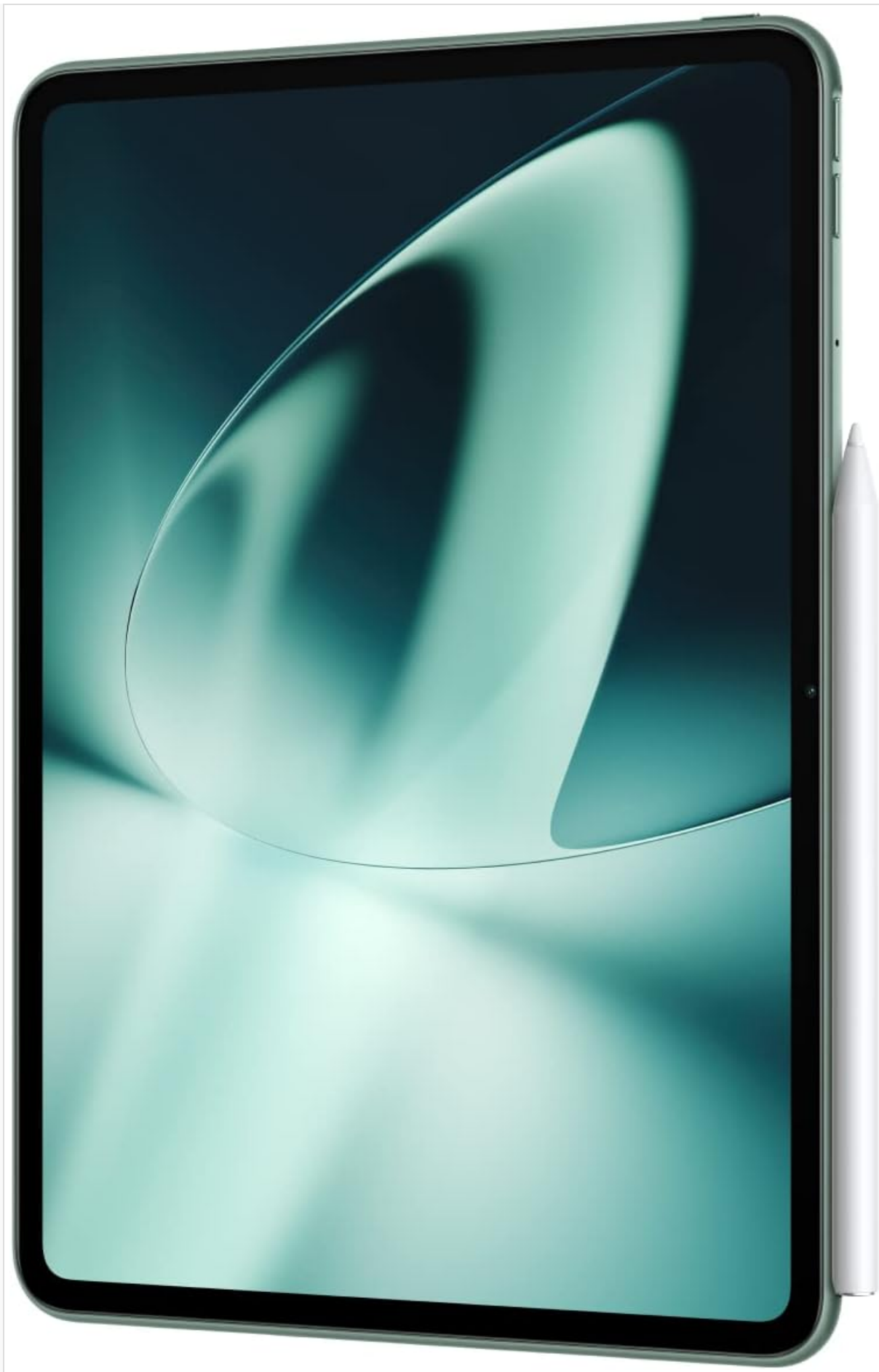
Image: The OnePlus Stylo magnetically attached to the side edge of a compatible tablet.