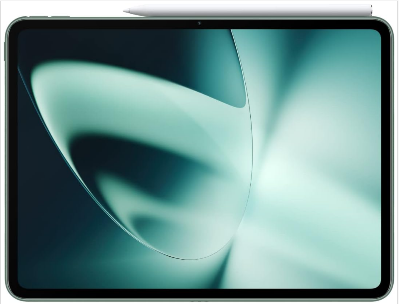
Image: The OnePlus Stylo magnetically attached to the top edge of a compatible tablet.