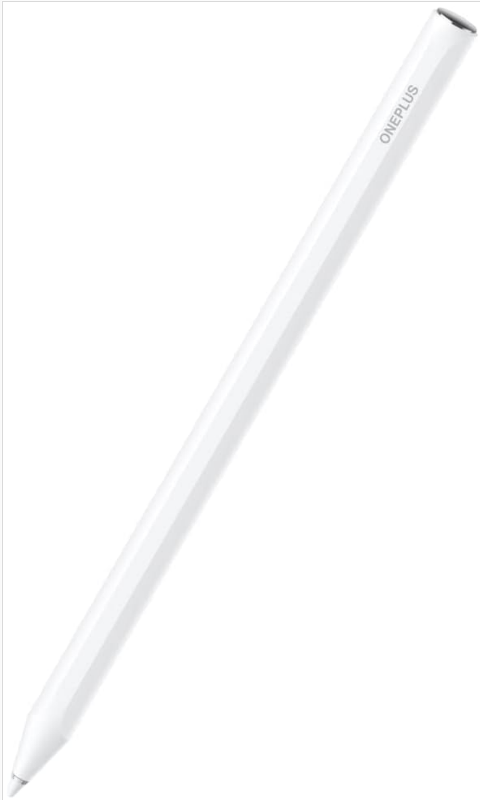
Image: The OnePlus Stylo OPN2202, a white digital pen with the "ONEPLUS" logo visible on its side.

The OnePlus Stylo is a sleek and ergonomic input pen designed for seamless interaction with compatible tablets. It features a durable aluminum body and a precise tip for accurate input.