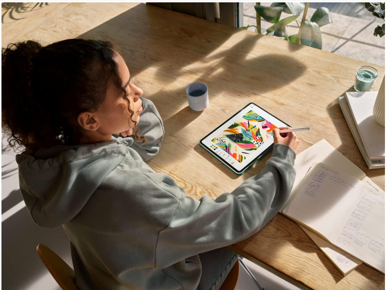
Image: A person using the OnePlus Stylo to draw on a tablet, demonstrating its use for creative tasks.