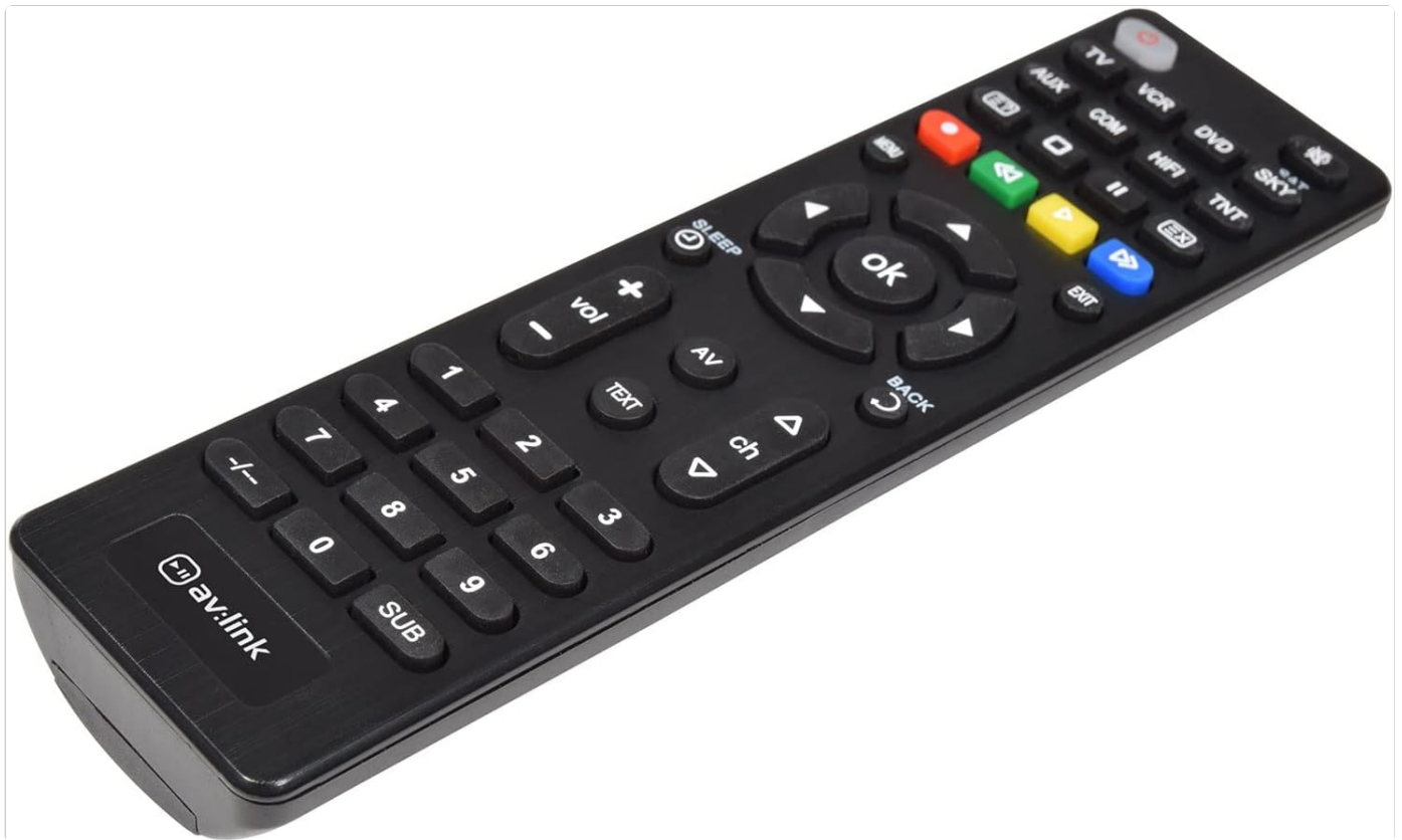
Image 1: Front view of the AV:Link 8-in-1 Universal Remote Control, showing all buttons and their labels. This image illustrates the general layout and design of the remote.

The remote features dedicated buttons for various functions and device types. Key sections include: