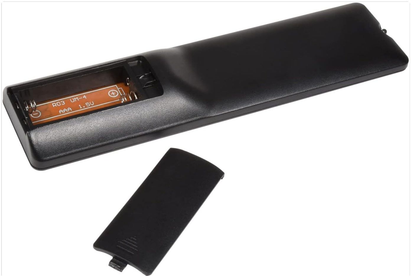
Image 2: Rear view of the remote control with the battery compartment open, showing where to insert two AAA batteries. This image helps users correctly install batteries.

Note: Always use new batteries and dispose of old batteries responsibly. If the remote is not used for an extended period, remove the batteries to prevent leakage.