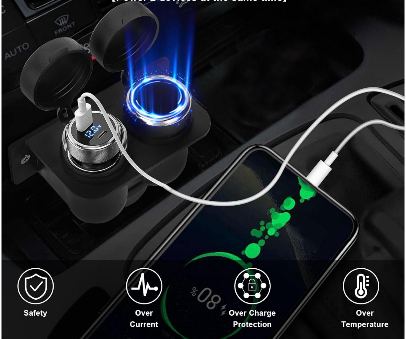
Figure 5: Charging a smartphone using the dual socket.

【Output Power: 120W】 【Voltage: DC 12/24V】 【Total Output: 3.1A】 【Power 2 devices at the same time】