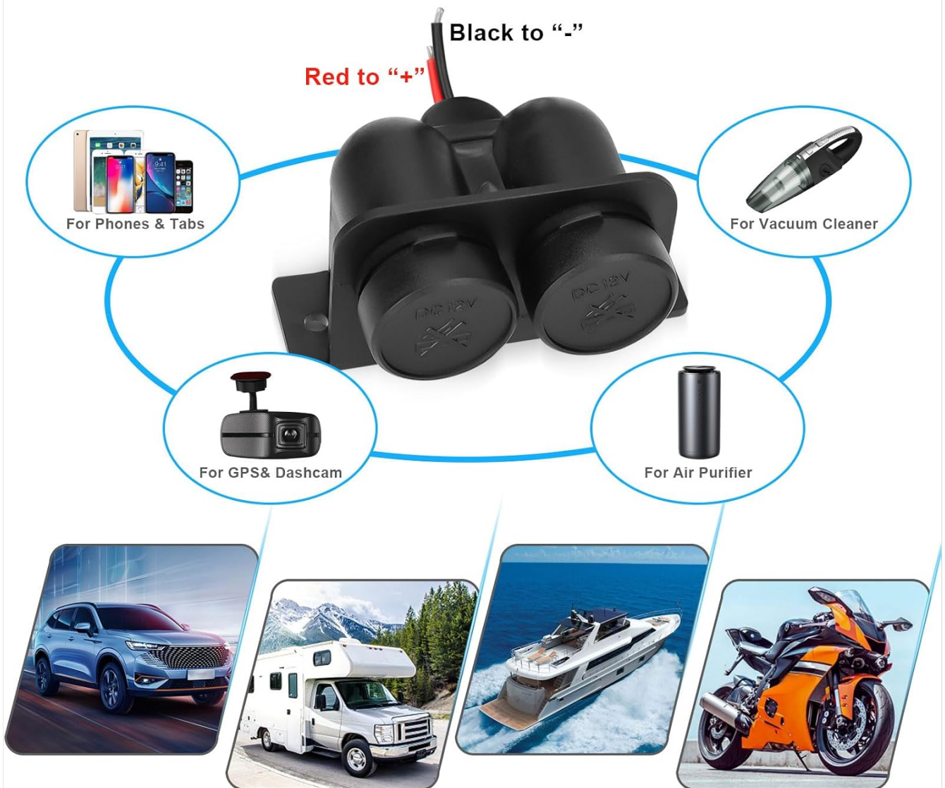
Figure 6: Wide range of applications for the Vadaxx Dual Cigarette Lighter Socket.

-Suitable for most 12/24V automobiles, RVs, boats, ATVs, golf cart, UTV, Van etc-