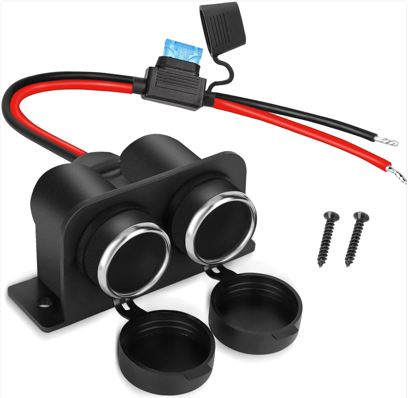
Figure 3: Vadaxx Dual Cigarette Lighter Socket components for installation.