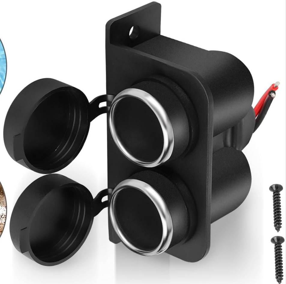
Figure 4: Safety features and protective design of the socket.