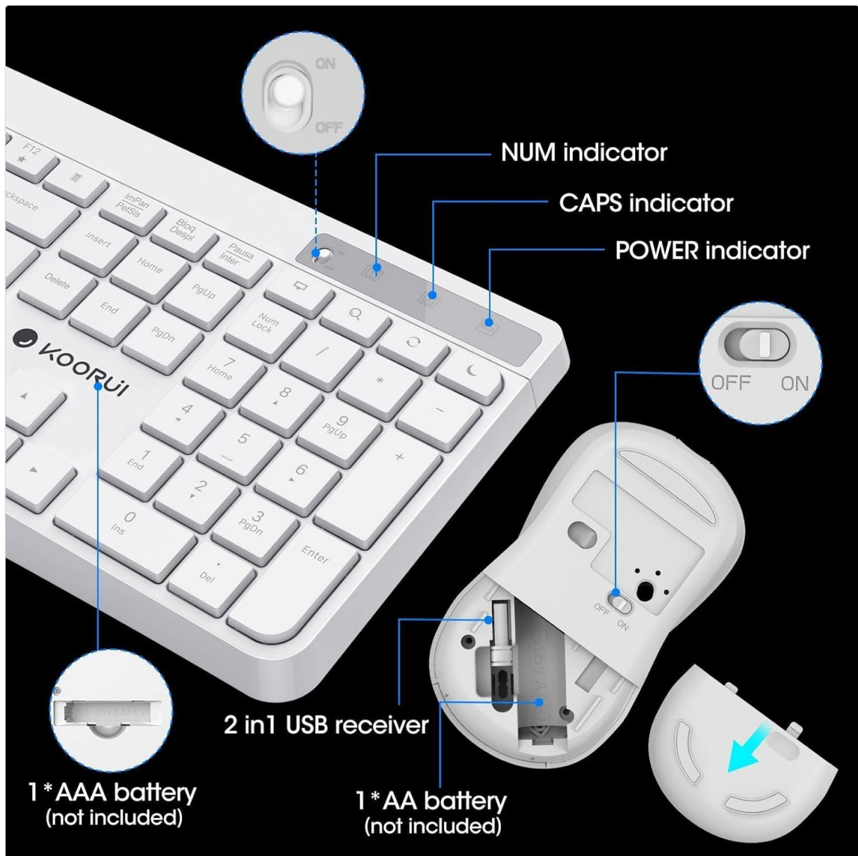
Image 3.1: Illustration showing the location of the USB receiver inside the mouse and the battery compartments for both the keyboard (1x AAA) and mouse (1x AA).