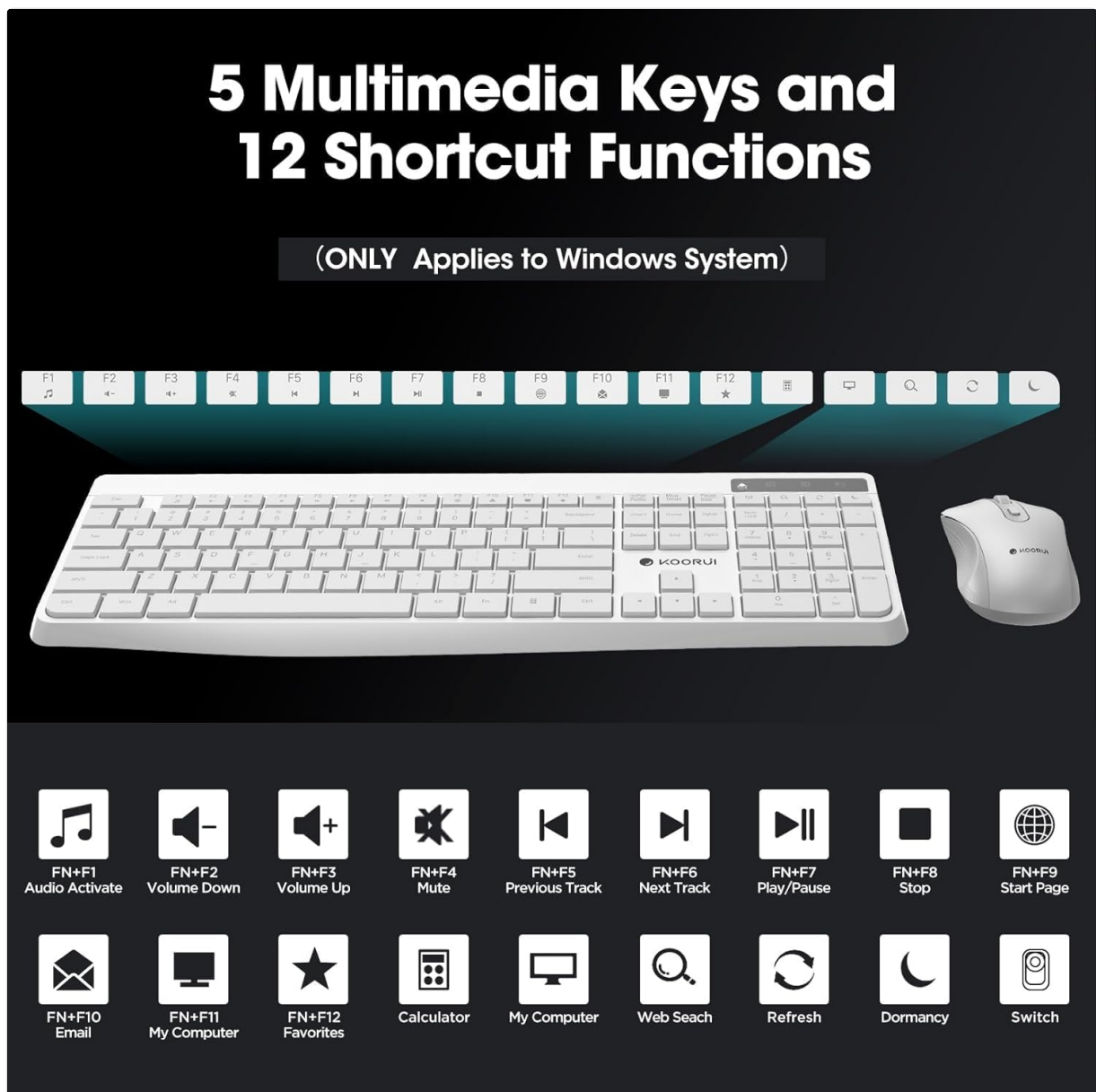
Image 4.2: Diagram illustrating the layout of the 5 multimedia keys and 12 shortcut functions on the keyboard, including functions like volume control, media playback, and quick access to applications.

The keyboard features 5 dedicated multimedia keys and 12 shortcut functions for enhanced productivity. These functions are primarily designed for Windows operating systems.