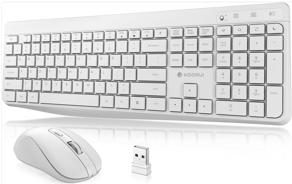
Image 1.1: The KOORUI Wireless Keyboard and Mouse Combo, featuring a full-size keyboard, an ergonomic mouse, and a USB receiver.

Thank you for choosing the KOORUI 2.4G Silent Full Size Ergonomic Wireless Keyboard and Mouse Combo. This product is designed to provide a comfortable and efficient computing experience with its quiet operation, ergonomic design, and reliable wireless connectivity. This manual provides essential information for setting up, operating, maintaining, and troubleshooting your new device.