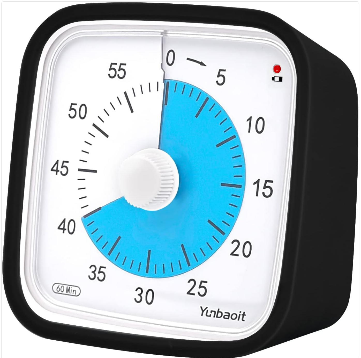
Figure 1.1: Yunbaoit Upgraded Visual Timer (Black Blue)

This image shows the front view of the Yunbaoit visual timer in black with a blue colored disk indicating remaining time. The timer features a white central knob for setting time and clear numerical markings from 0 to 60 minutes.