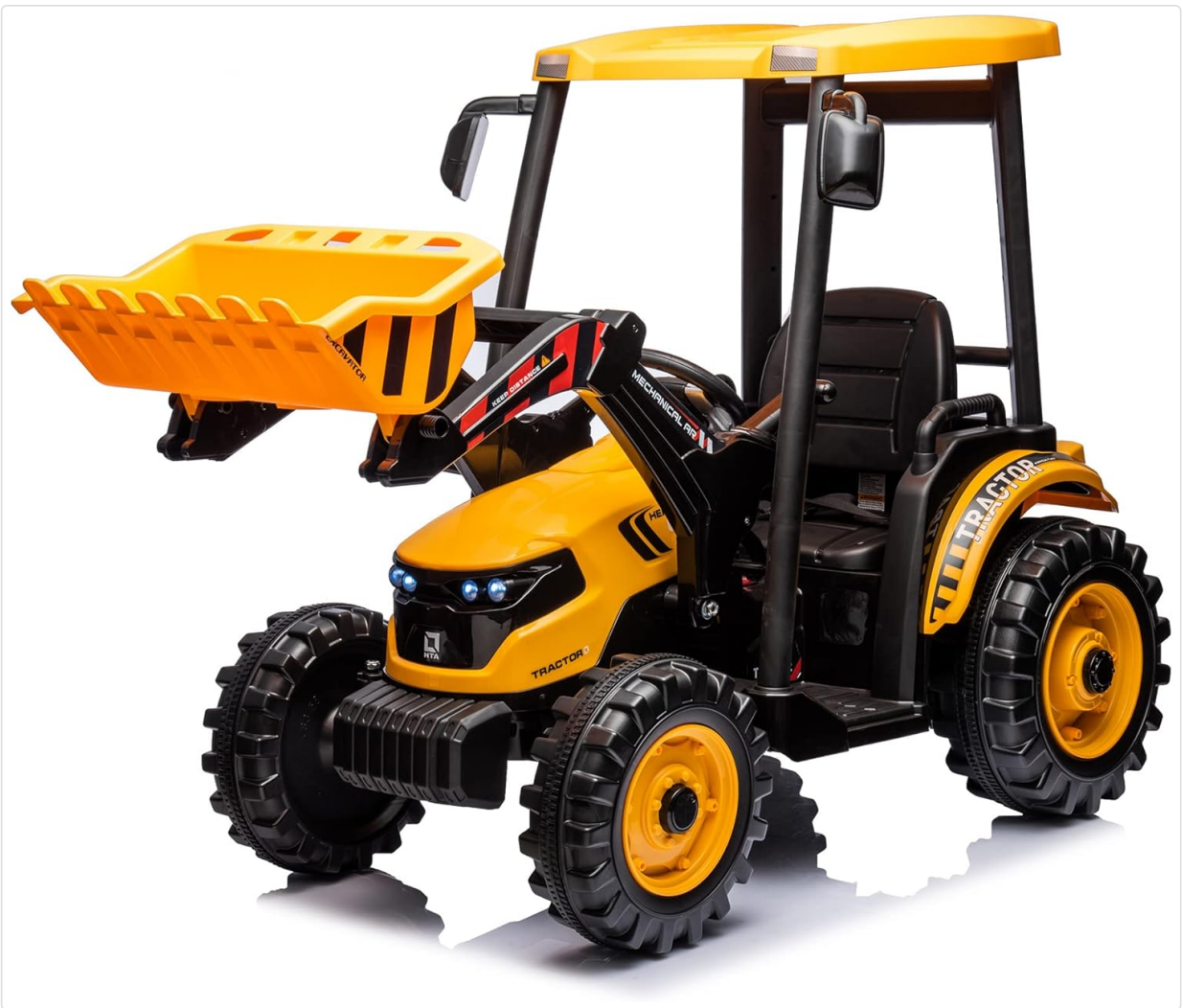
Figure 1: Kidsera 24V Ride-On Tractor with Front Loader. This image displays the complete yellow tractor with its front loader attachment and roof canopy.