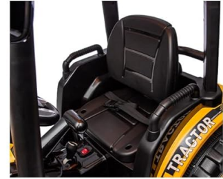
SEAT AND SEAT BELTS