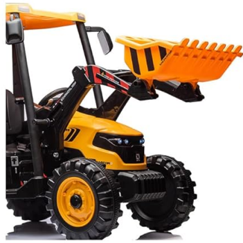
RUGGED AND ADJUSTABLE BUCKET