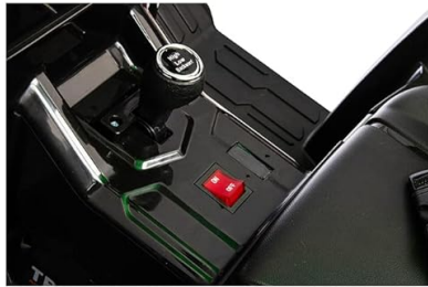
HIGH&LOW SPEED BACKWARD