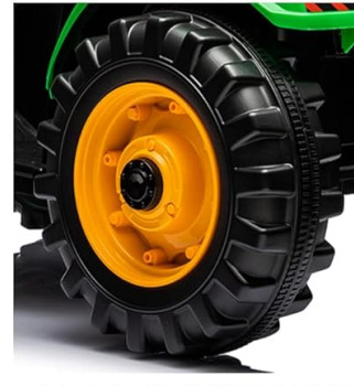
ALL TERRAIN TIRES