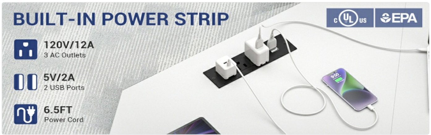
Figure 3: Built-in Power Strip. This image shows the integrated power strip with its 3 AC outlets and 2 USB ports, designed for convenient charging of various devices.