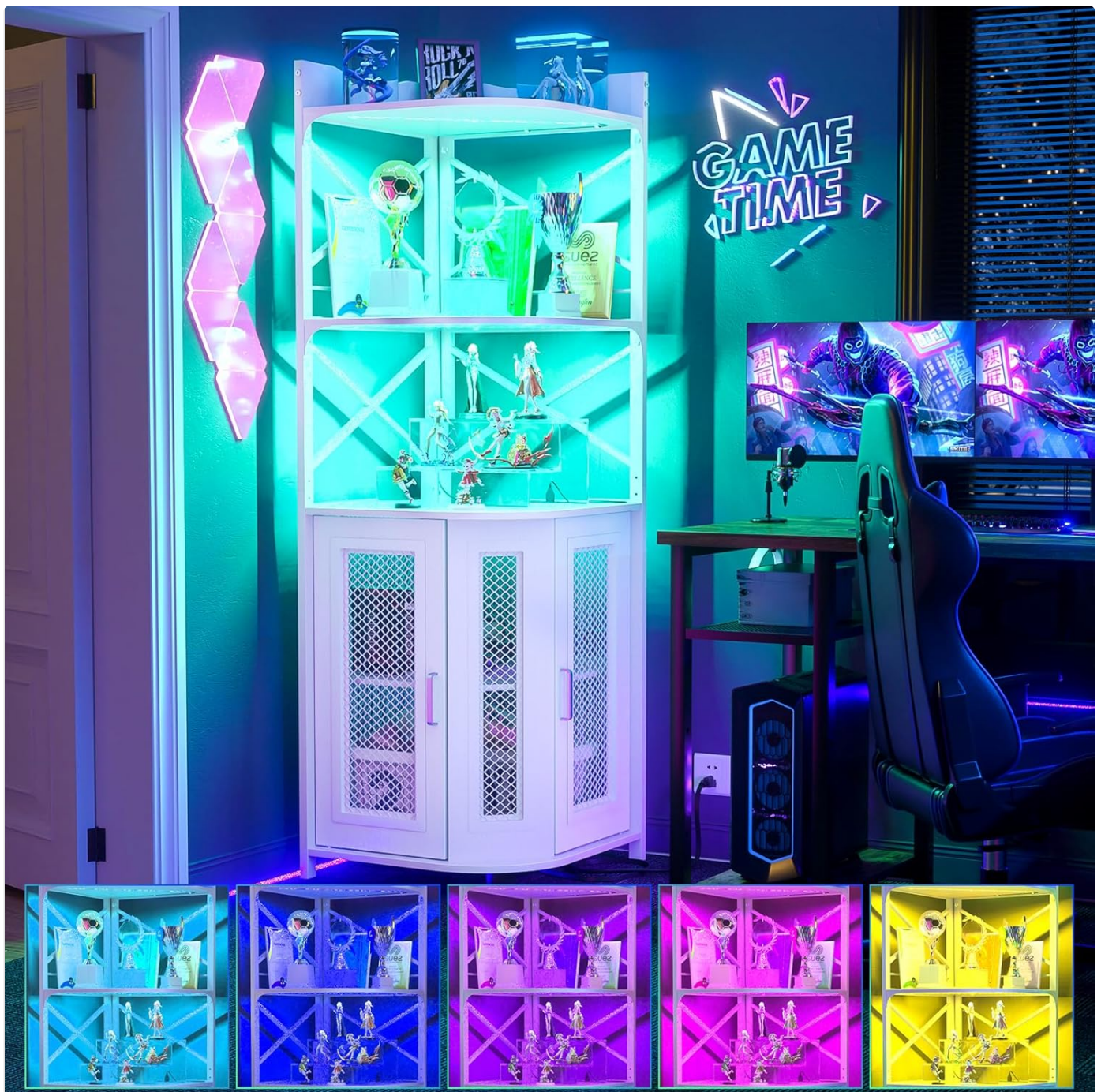
Figure 5: Versatile LED Colors. The cabinet is shown in a game room with blue LED lighting, and smaller insets display the cabinet with various other LED colors, illustrating the customizable ambiance.