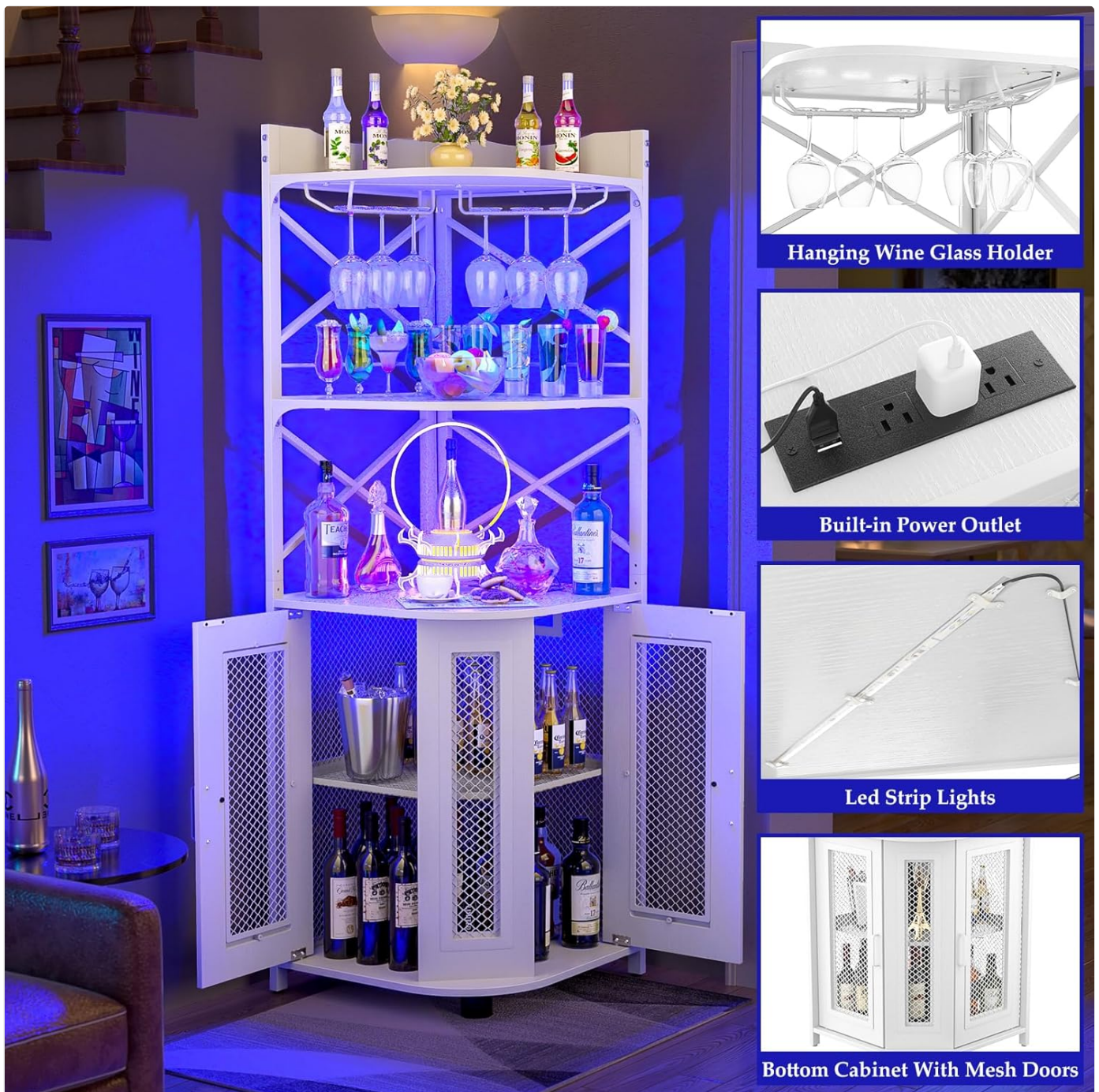
Figure 2: Key Features. This image highlights the hanging wine glass holder, the built-in power outlet, the LED strip lights, and the design of the bottom cabinet with mesh doors.