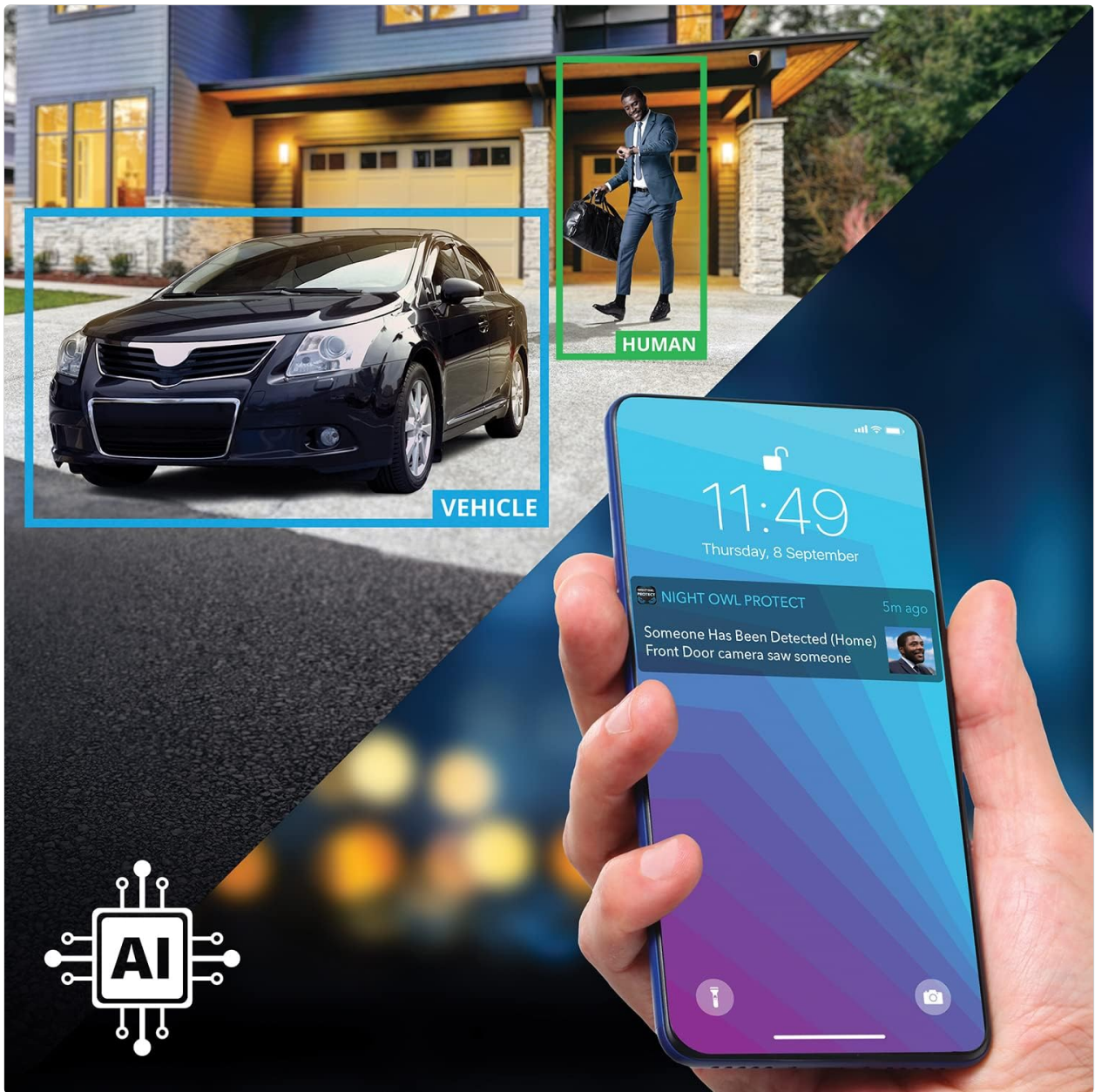
Image 4.2: The system's AI capabilities highlighting human and vehicle detection for precise alerts.