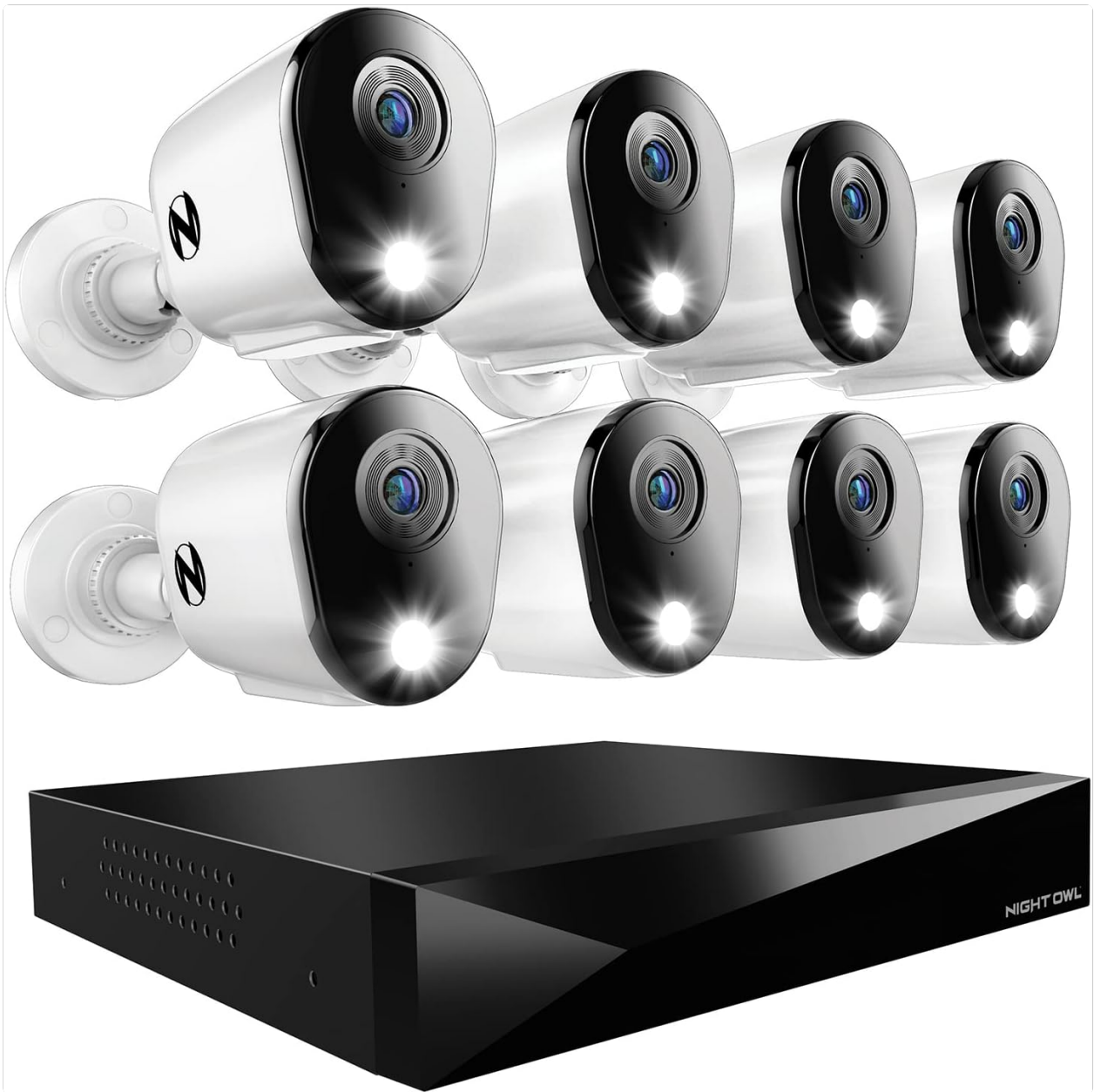
Image 1.1: The Night Owl FTD4-81-8L security system, featuring the DVR unit and eight wired 2K HD cameras.