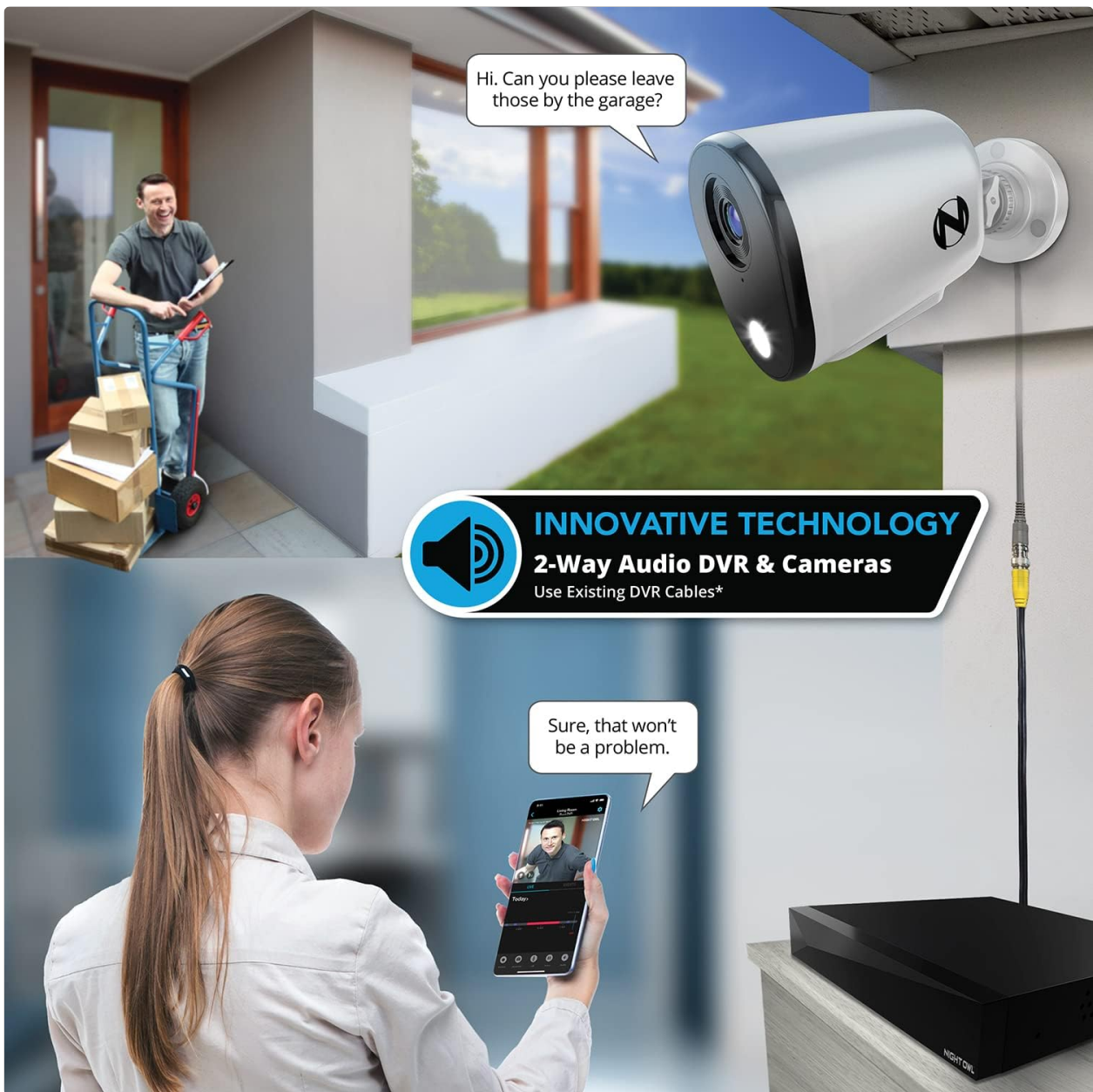
Image 4.1: An illustration of the 2-way audio feature, enabling communication with individuals near the camera.