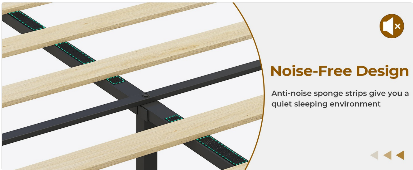
Image 4.2: A close-up demonstrating the quick-setup system where Velcro strips attach the wooden slats to the bed frame for secure and easy installation.