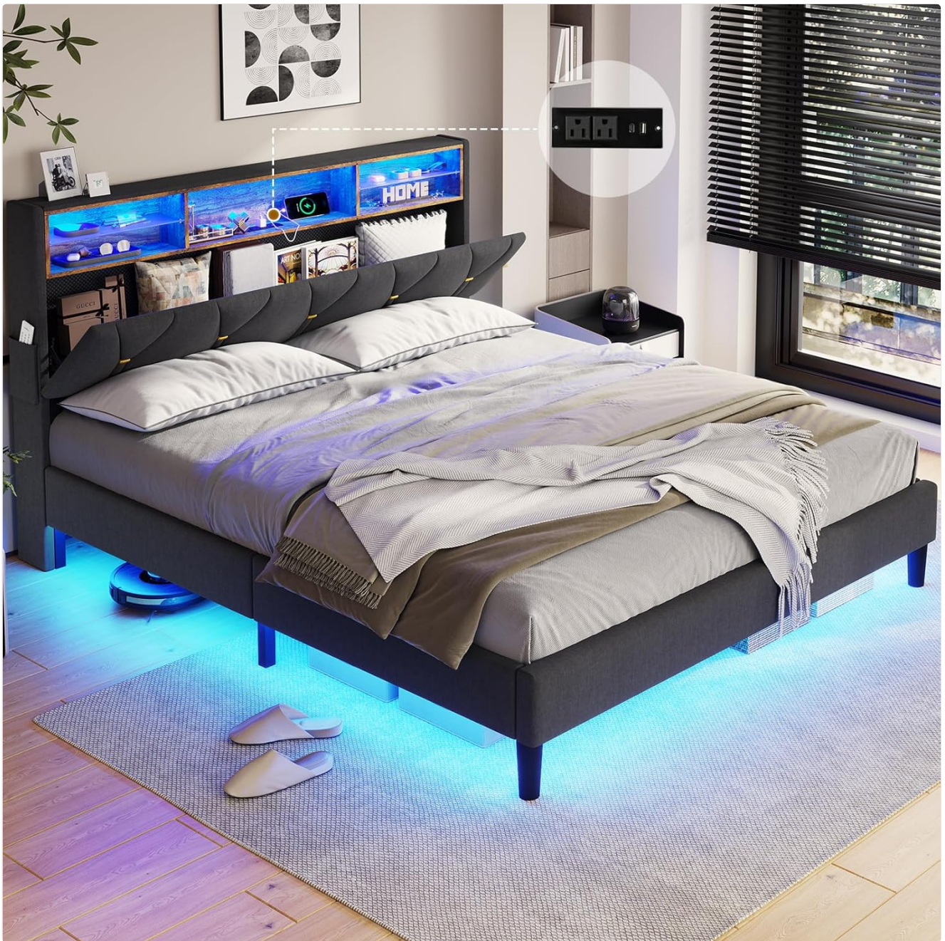
Image 1.1: The BTHFST Queen Bed Frame in dark grey linen fabric, showcasing the LED lights under the bed and in the headboard, along with the integrated charging station.