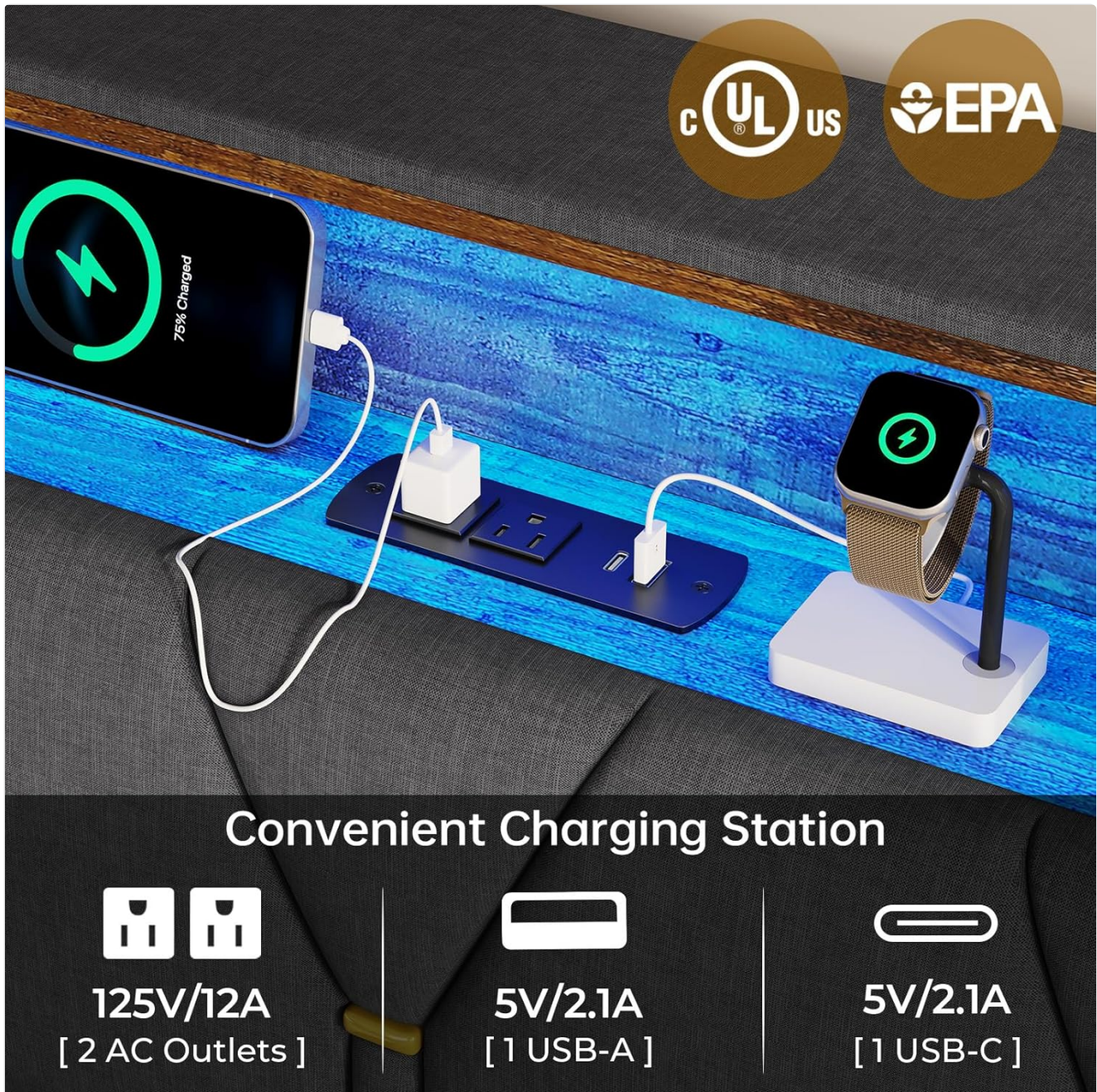
Image 5.3: A close-up view of the integrated charging station on the headboard, showing two AC outlets, one USB-A port, and one USB-C port, with devices actively charging.