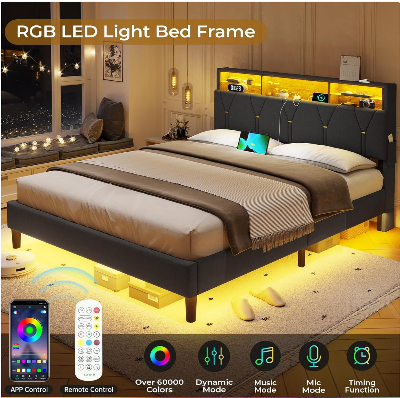
Image 5.1: The bed frame illuminated by RGB LED lights, with an overlay showing the remote control and mobile application interface for controlling colors, dynamic modes, music synchronization, microphone mode, and timing functions.