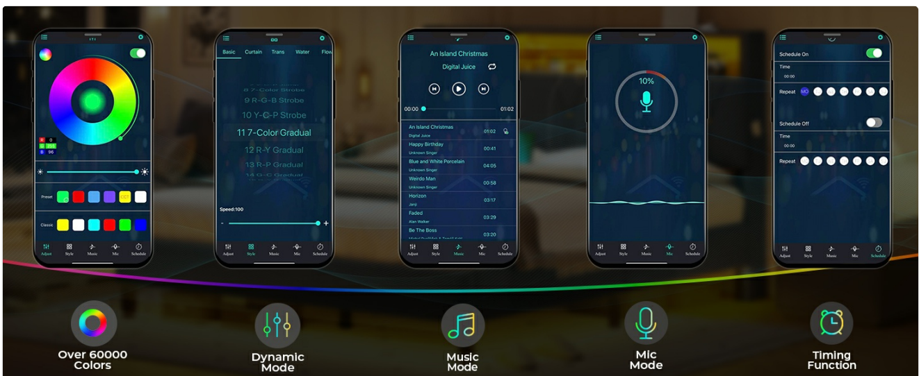
Image 5.2: A series of screenshots illustrating the mobile application interface for controlling the LED lights, including color selection, dynamic modes, music mode, microphone mode, and timing functions.