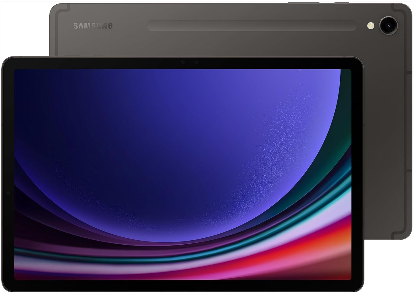
Figure 1: Front and back view of the Samsung Galaxy Tab S9.

The Samsung Galaxy Tab S9 is a powerful and versatile Android tablet designed for both productivity and entertainment. Featuring a durable design, a vibrant AMOLED screen, and advanced AI capabilities, it's built to enhance your daily digital experience.