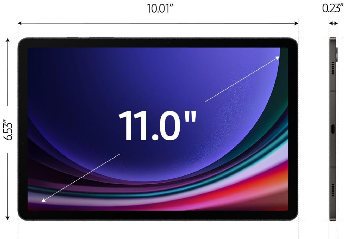
Figure 3: Display dimensions of the Samsung Galaxy Tab S9.

The Galaxy Tab S9 features an 11-inch Dynamic AMOLED 2X screen with a resolution of 2560 x 1600 pixels. The Vision Booster technology automatically adjusts brightness and contrast for optimal viewing in various lighting conditions.