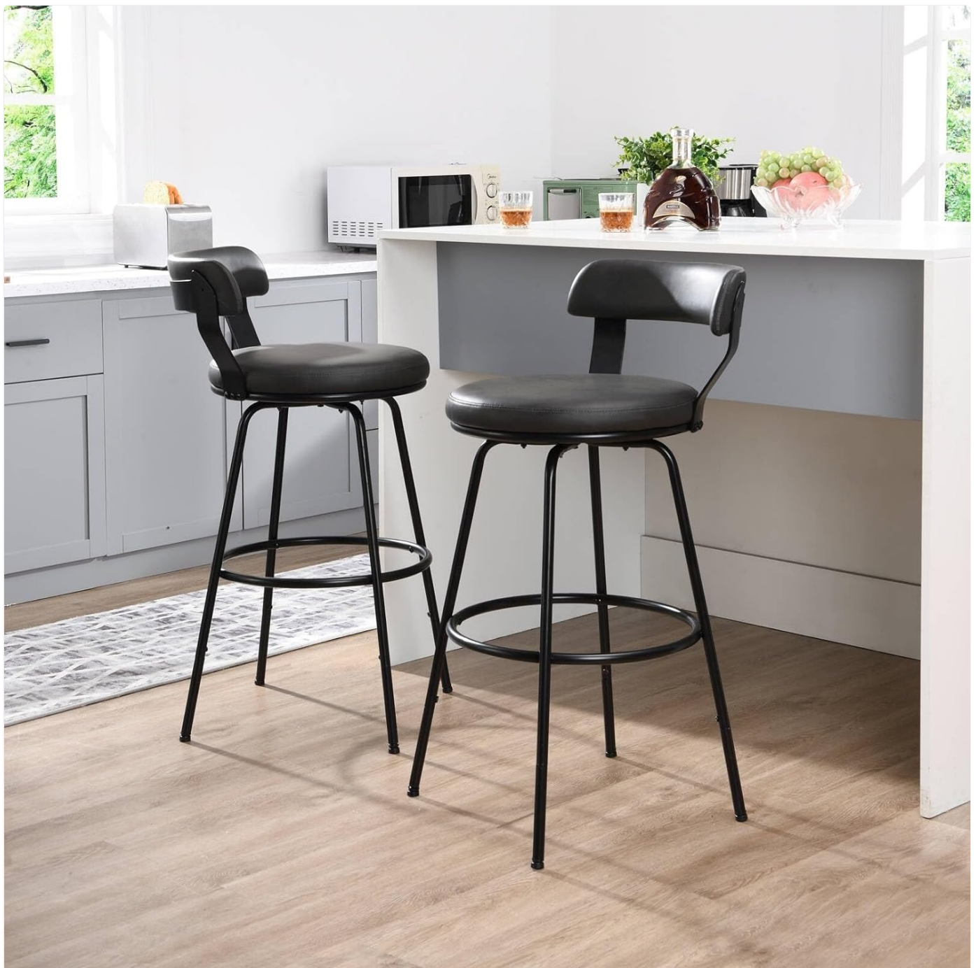
Figure 4.2: Assembled Hausfame Swivel Bar Stools in a Kitchen Environment.

This image displays two fully assembled Hausfame swivel bar stools positioned at a kitchen counter, demonstrating their appearance and fit in a typical home setting.