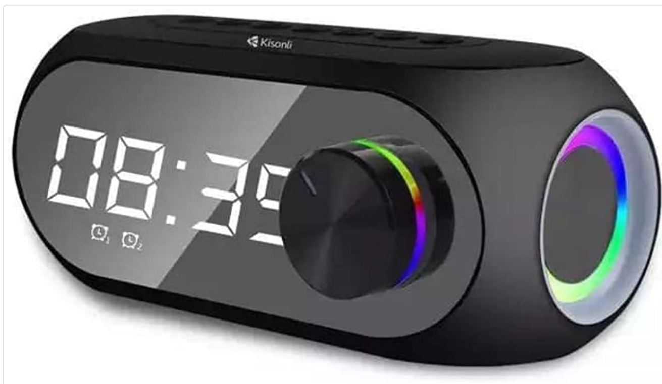
Image 1.1: Front view of the Kisonli LP-2S speaker, showcasing the digital time display and RGB lighting.

Thank you for choosing the Kisonli LP-2S Bluetooth Speaker. This device combines a high-quality audio speaker with an alarm clock, digital display, and RGB lighting, offering versatile functionality for your daily needs. This manual provides detailed instructions for setup, operation, and maintenance to ensure optimal performance and user experience.