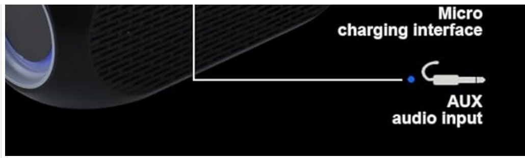
Image 4.2: Overview of speaker features, including TWS tandem technology.