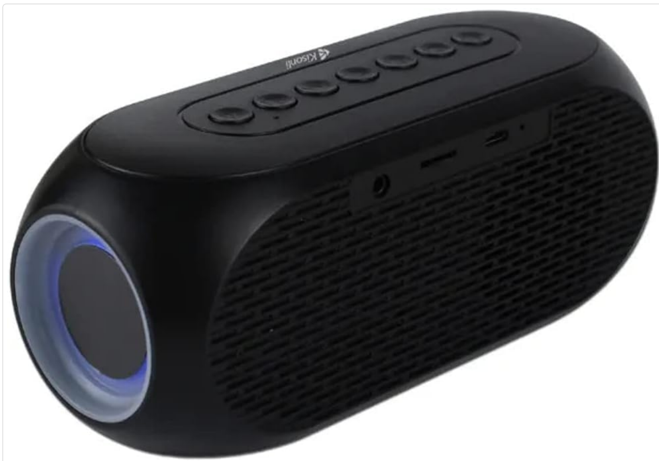
Image 2.2: Side view detailing the Micro USB charging port, TF card slot, and AUX audio input.