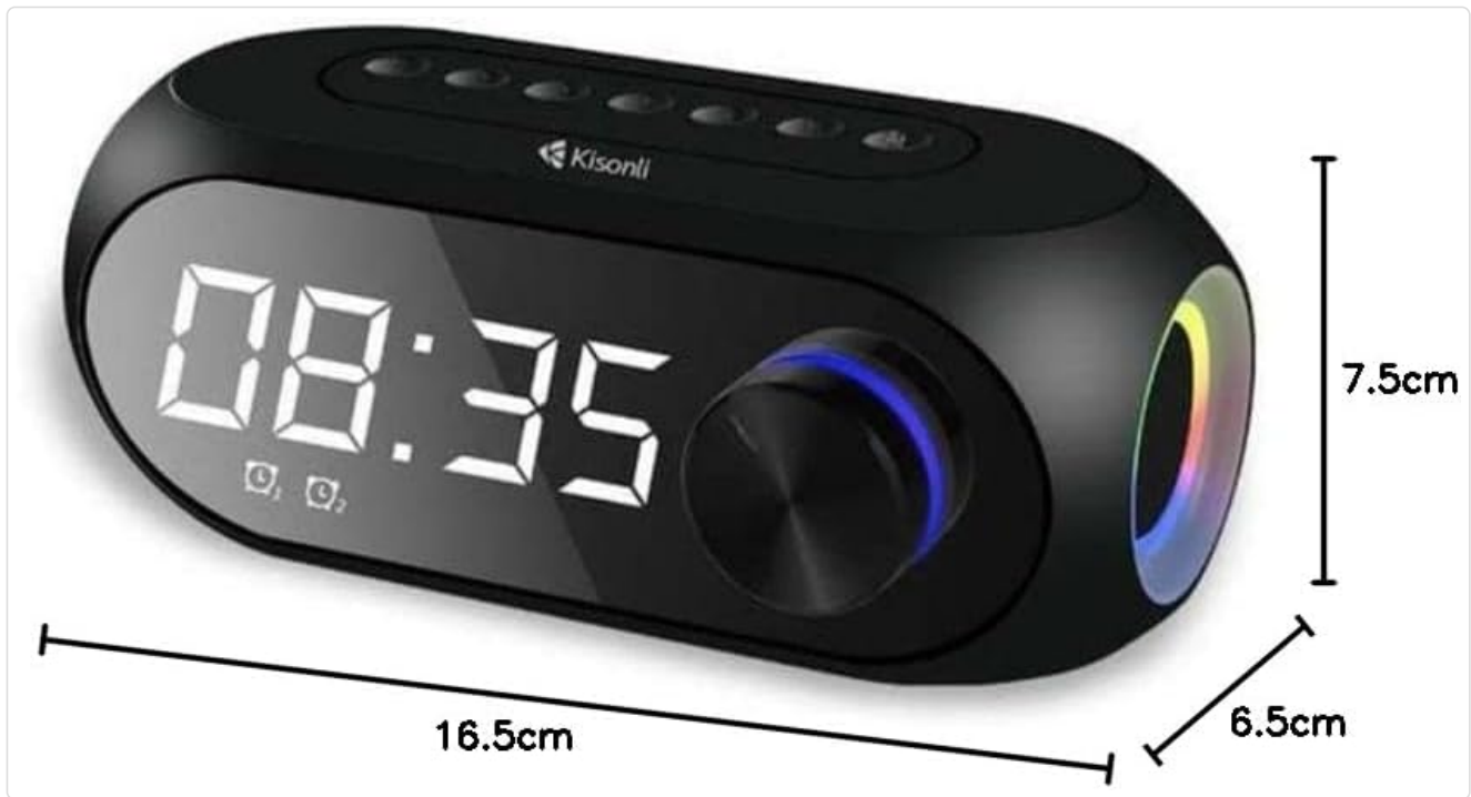
Image 2.1: Top and side view of the speaker with labeled controls and ports.