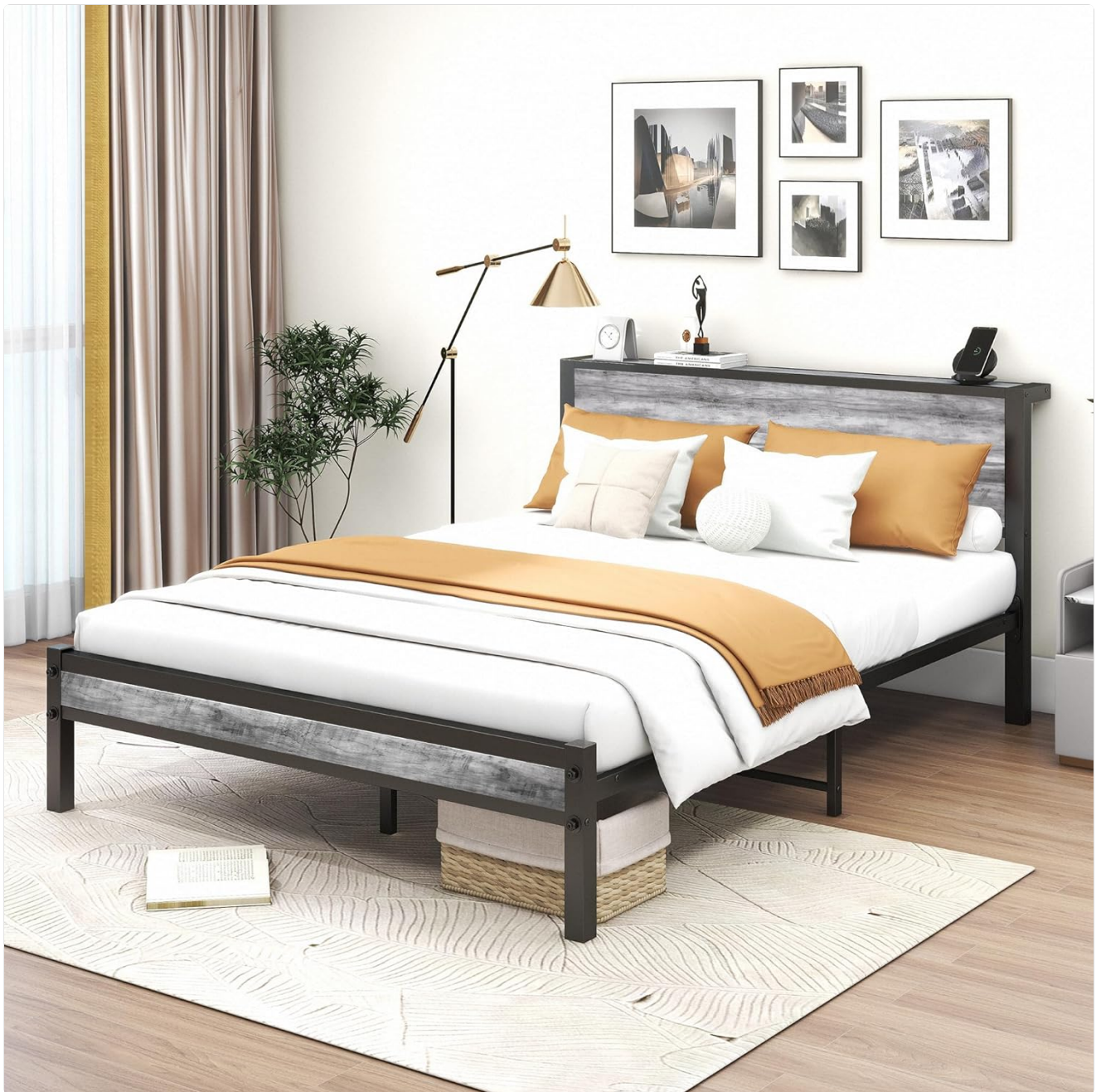
Image: The DUMEE Queen Bed Frame fully assembled with a mattress, showcasing the functional headboard shelf with various items.