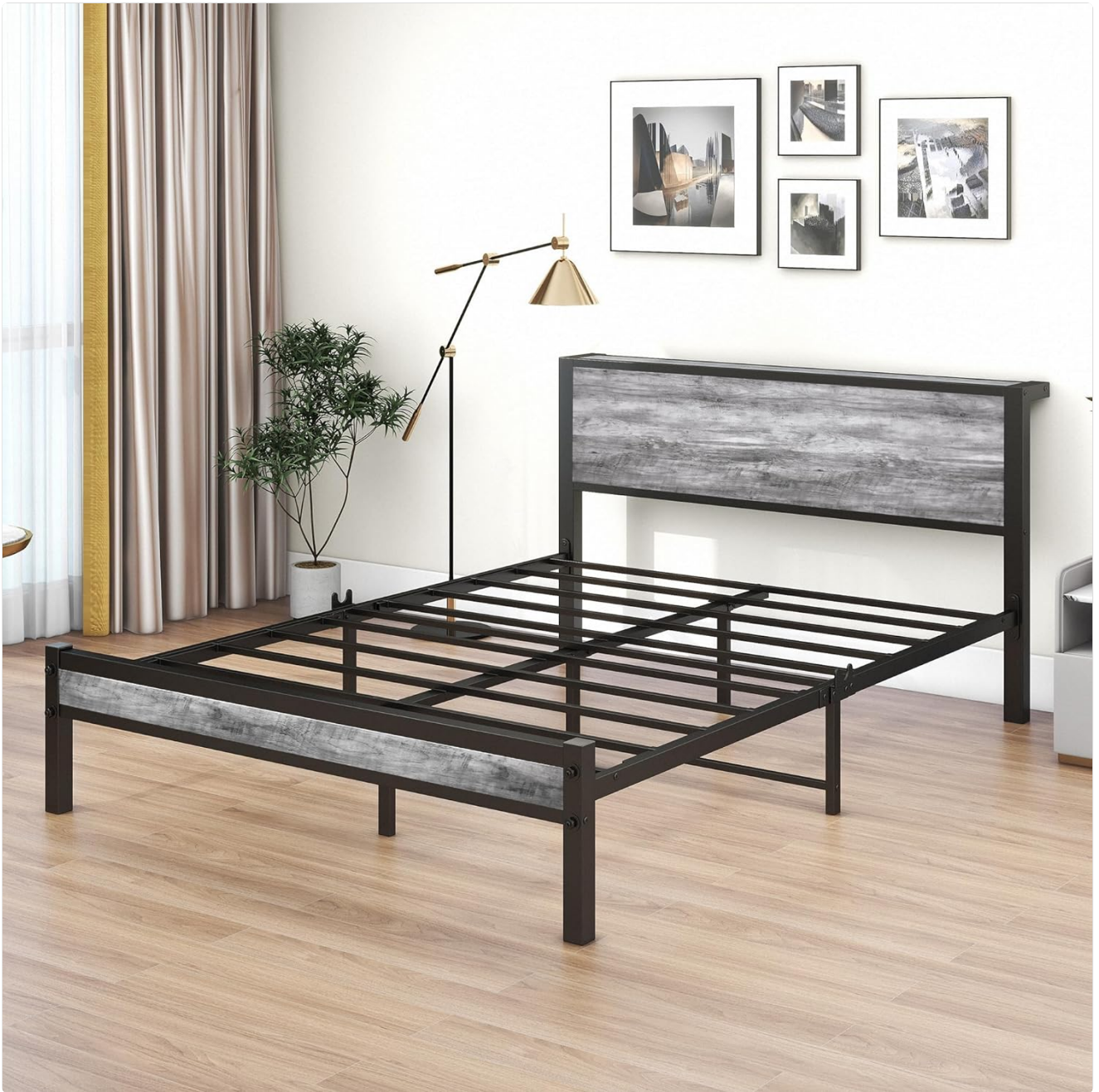
Image: Assembled DUMEE Queen Bed Frame structure, illustrating the metal frame and slat system before mattress placement.