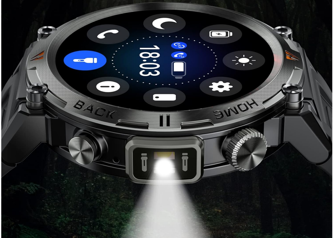
Image: The smart watch's flashlight feature in use, providing illumination in a dark setting.