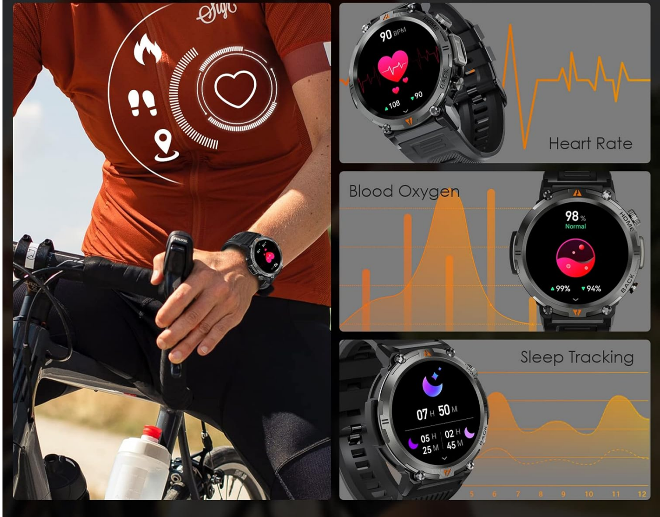
Image: The smart watch interface showing real-time heart rate, blood oxygen saturation, and sleep pattern data.

Helps you to know your physical status at all times.