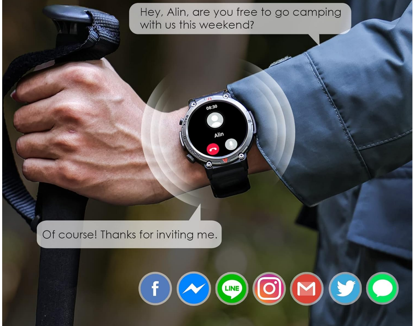
Image: The smart watch showing a message notification, illustrating its smart notification capability.