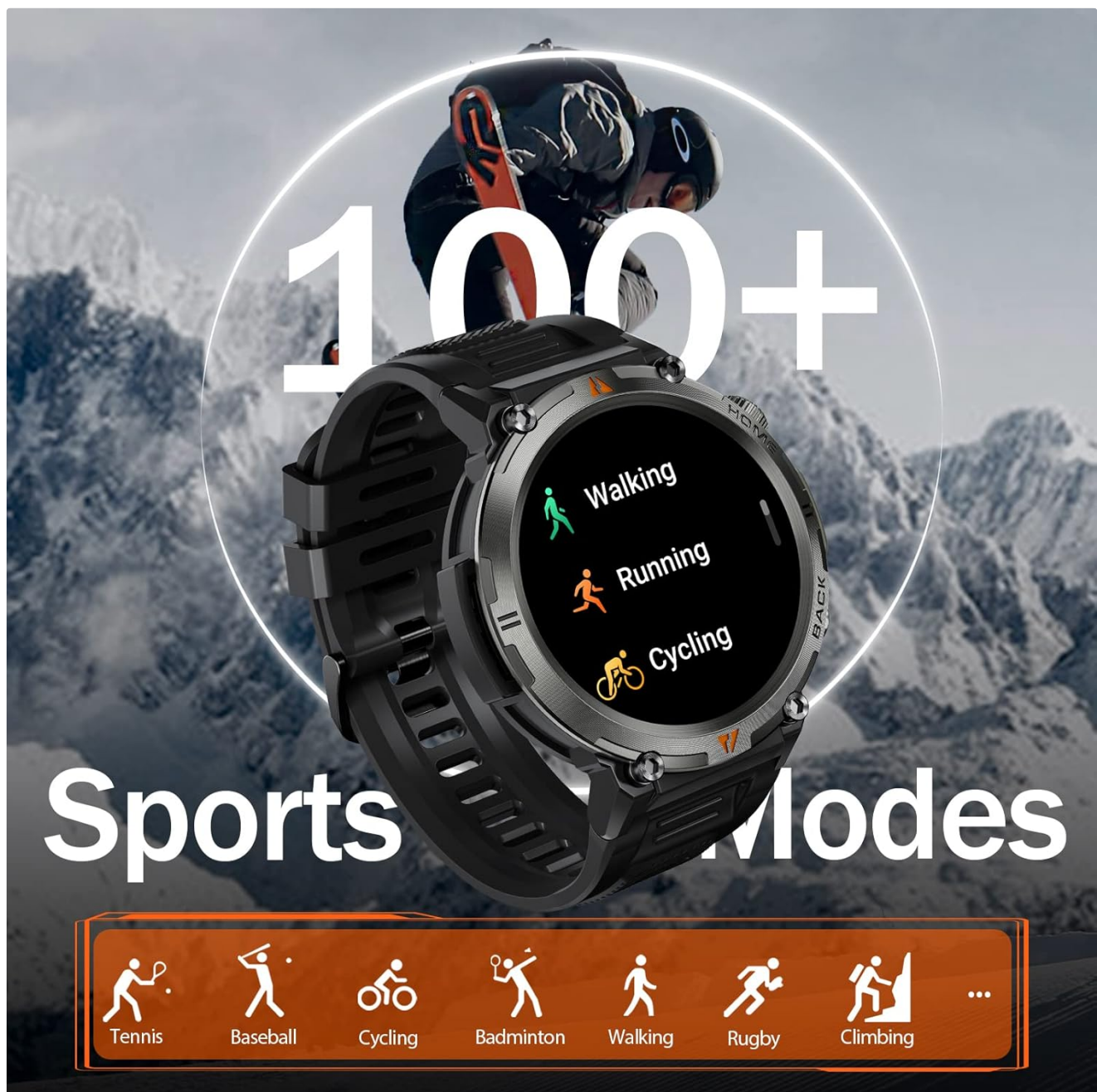
Image: The smart watch interface showing a selection of over 100 sports modes, including walking, running, and cycling.