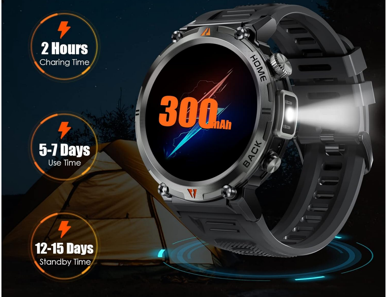
Image: The smart watch indicating its 300mAh battery capacity, 2-hour charging time, 5-7 days use time, and 12-15 days standby time.

Note: It is normal to open the flashlight for a long time will accelerate battery consumption.