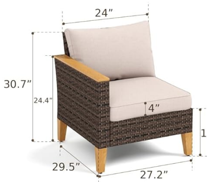
1 x Single Armrest