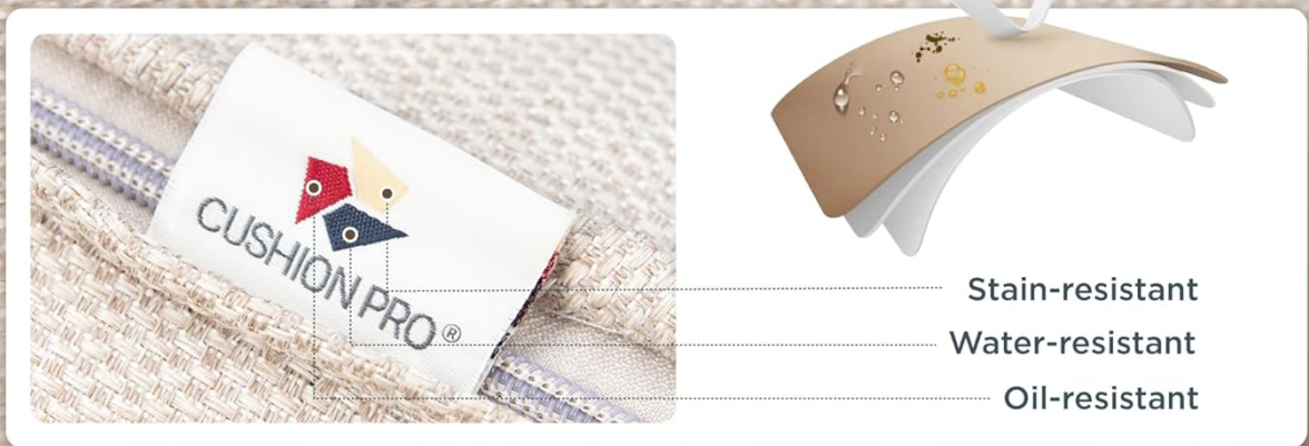
Image: A close-up view of the cushion fabric with water droplets beading on its surface, illustrating the water-resistant feature of the Cushion Pro Technology.