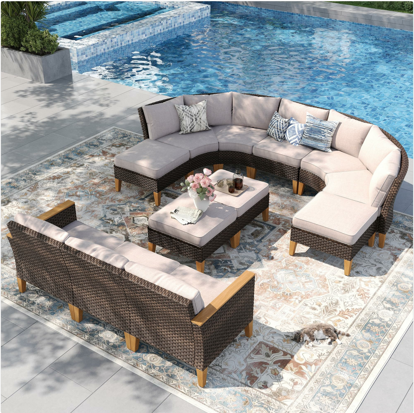
Image: The complete 12-seat curved wicker patio furniture set arranged in a half-moon shape with four ottomans, suitable for a large outdoor conversation area.