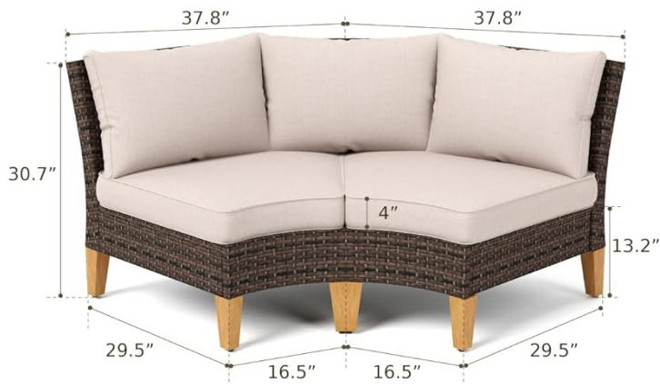
2 x Half Moon Sofa