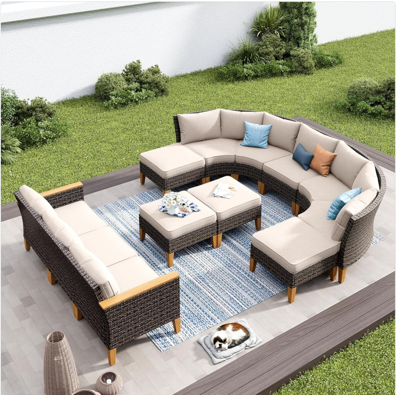
Image: An aerial view of the PHI VILLA patio set demonstrating a large U-shaped configuration, highlighting the versatility of its modular components for different outdoor arrangements.