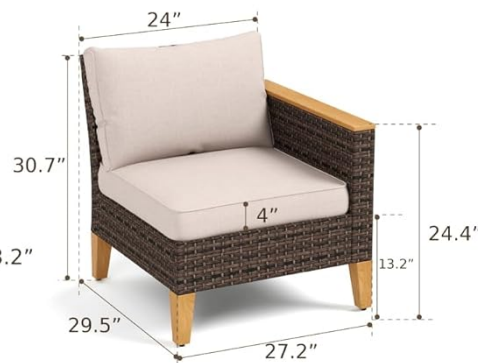
1 x Single Armrest