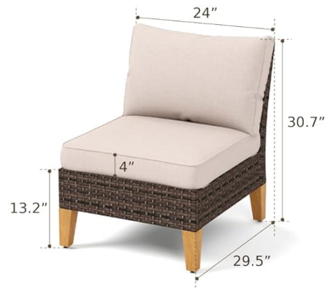
2 x Armless Chair