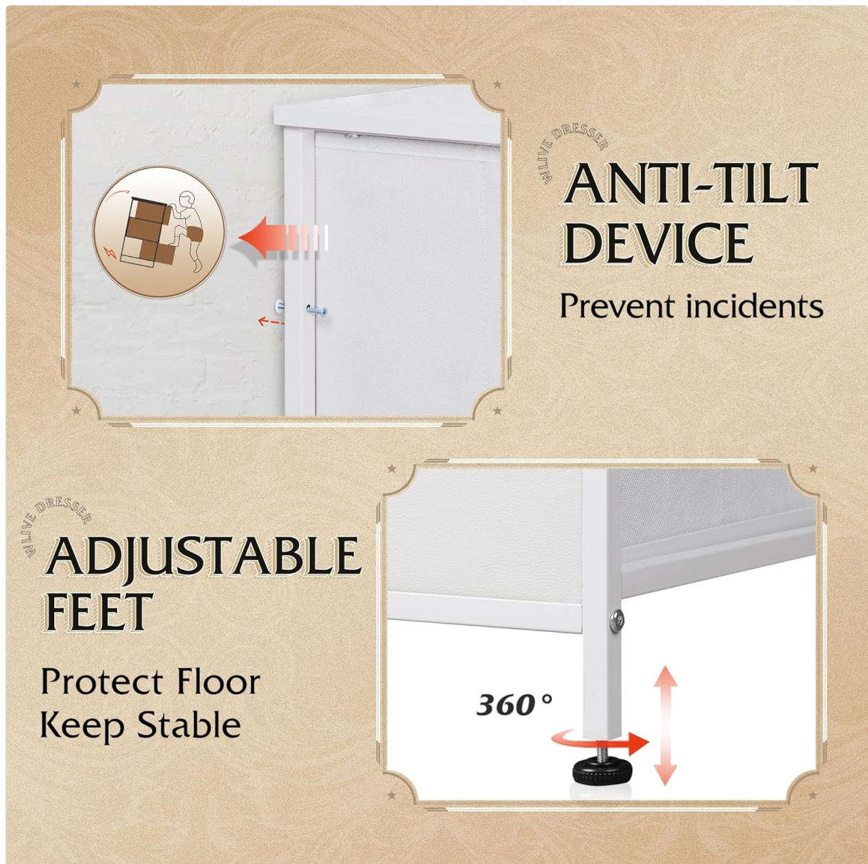
Illustration of the anti-tilt device for wall attachment and the adjustable feet for floor protection and stability.

Important: Always install the anti-tipping accessories to secure the dresser to the wall, especially in households with children or pets, to prevent accidental tipping.