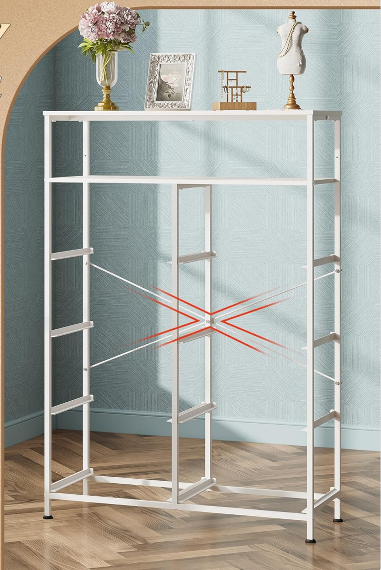
Close-up view of the sturdy steel frame construction, solid drawer slides, and 360-degree adjustable feet.