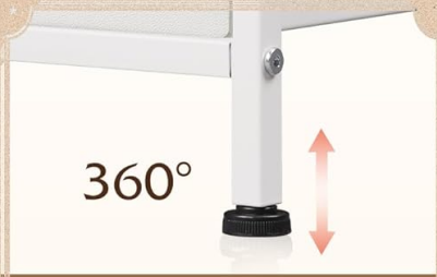
360° Adjustable Feet