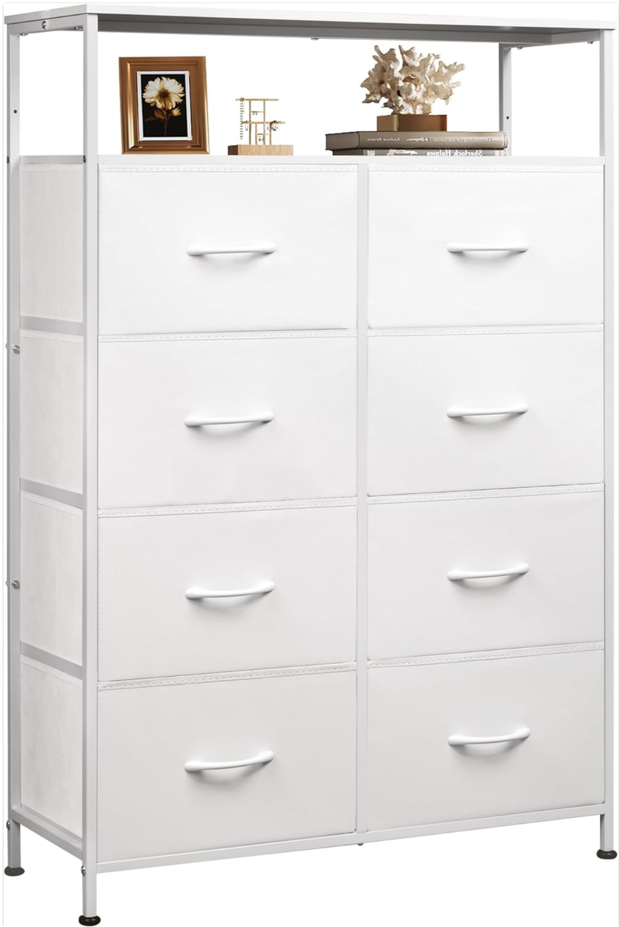
Front view of the WLIVE Tall Fabric Storage Dresser in white, showcasing its 8 fabric drawers and top shelf.