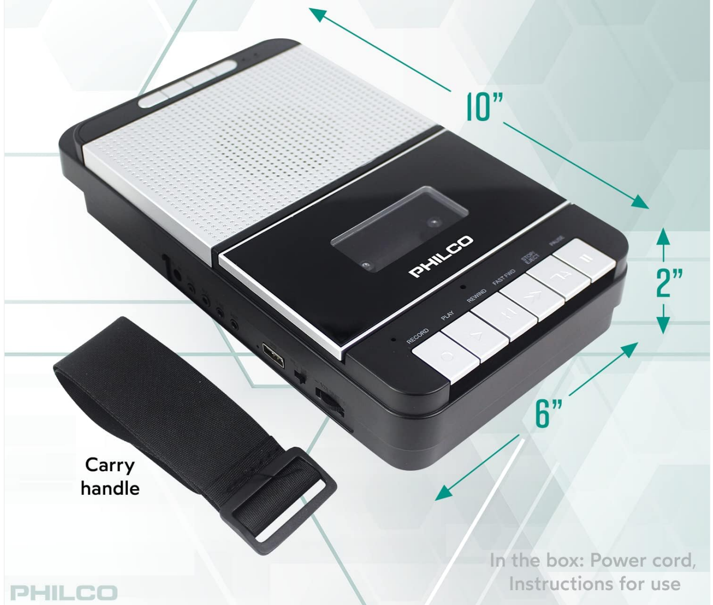
Diagram showing the approximate dimensions of the PHILCO Digital Cassette Recorder: 10 inches long, 6 inches wide, and 2 inches high.