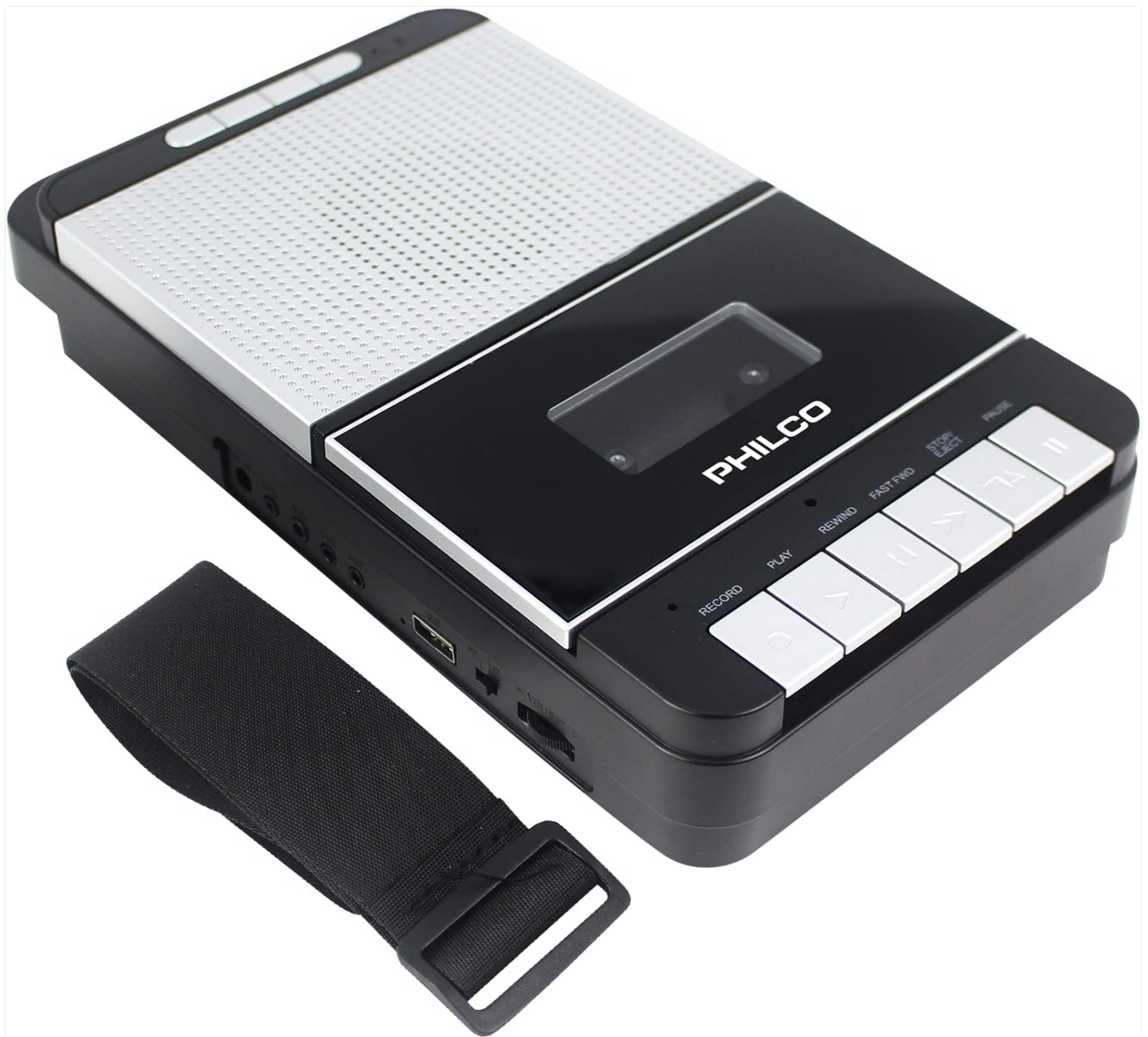
Front view of the PHILCO Digital Cassette Recorder, showing the speaker grille, cassette window, and control buttons. A detachable carry handle is also visible.