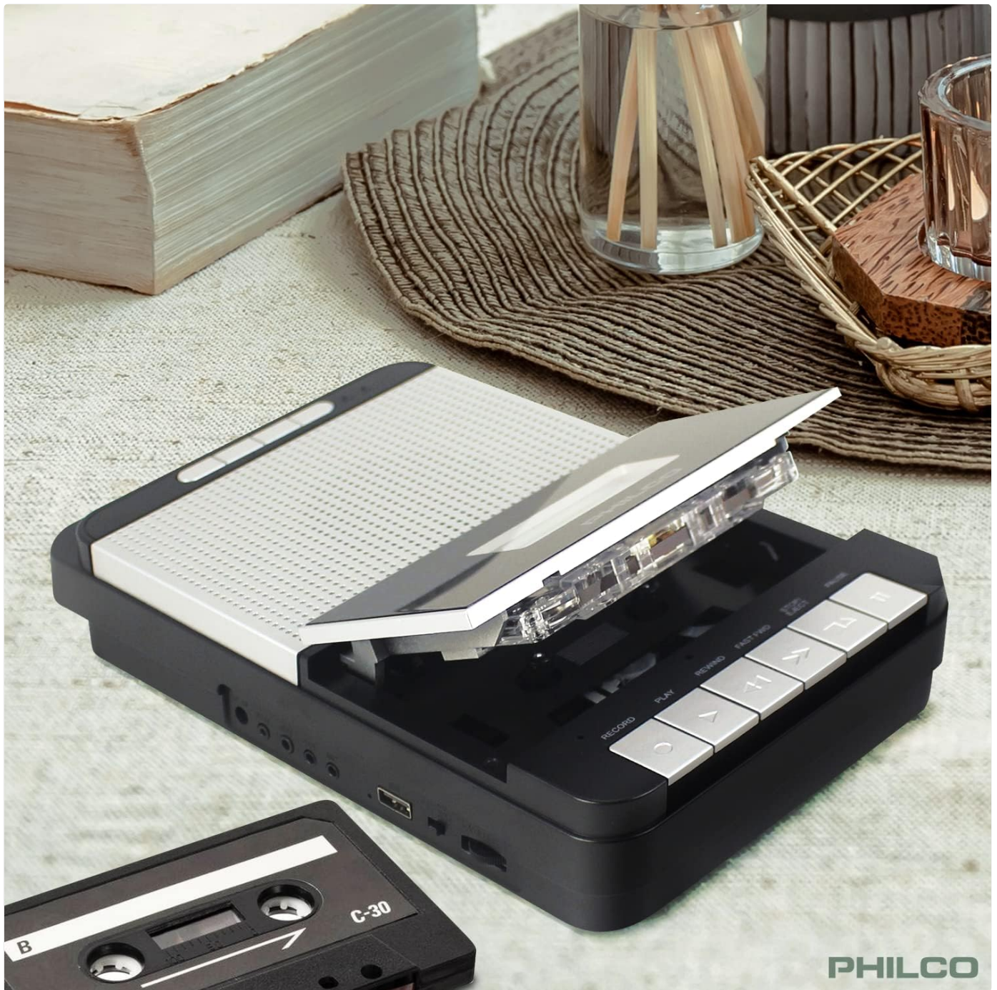
Image demonstrating the process of opening the cassette compartment and inserting a tape.