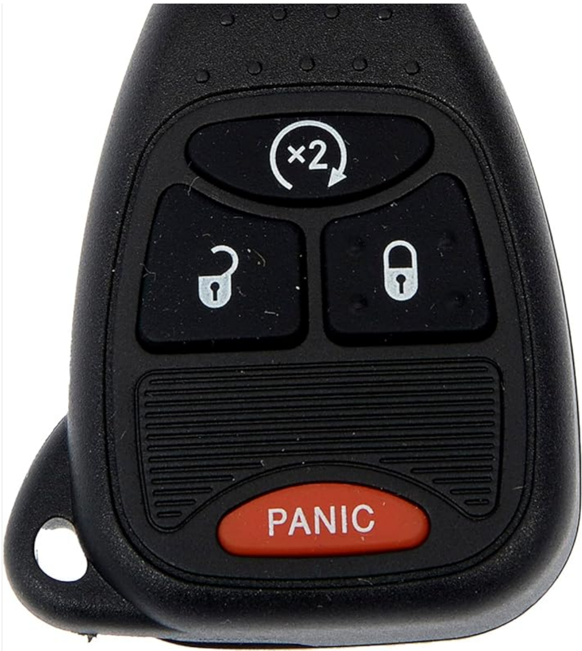
Image: Detailed view of the remote's buttons.