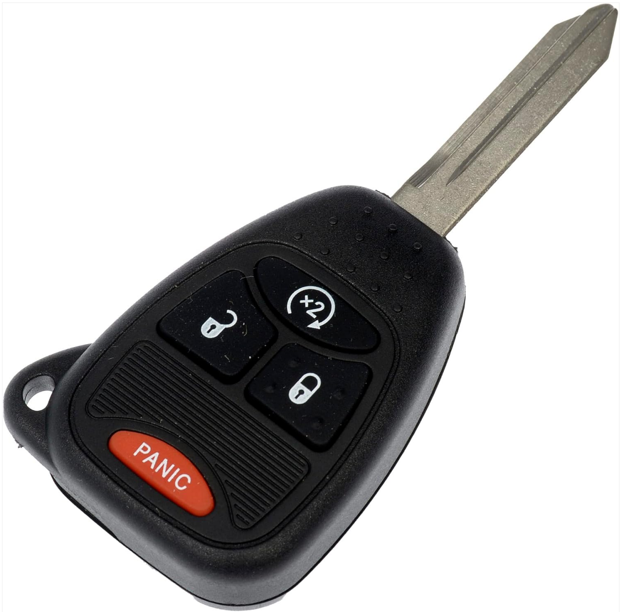
Image: Front view of the Dorman 99277ST Keyless Entry Remote with key blade extended.