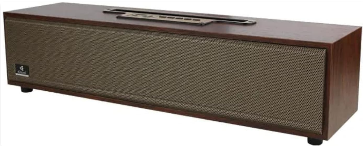
Image: The Kisonli G11 Wireless Bluetooth Wooden Music Speaker, featuring a brown wood finish and a metal speaker grille.

Thank you for purchasing the Kisonli G11 Wireless Bluetooth Wooden Music Speaker. This manual provides essential information for the safe and efficient operation of your new speaker. Please read this manual thoroughly before using the product and retain it for future reference.