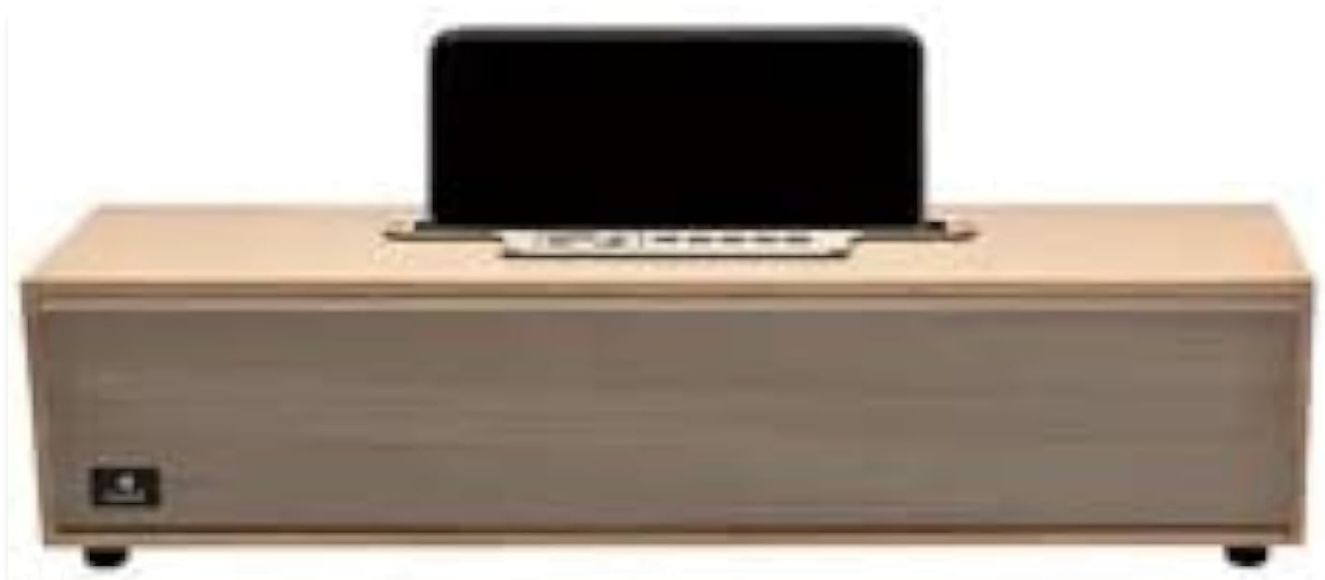
Image: The Kisonli G11 speaker in a light wood finish, showcasing the integrated phone holder slot on the top panel.