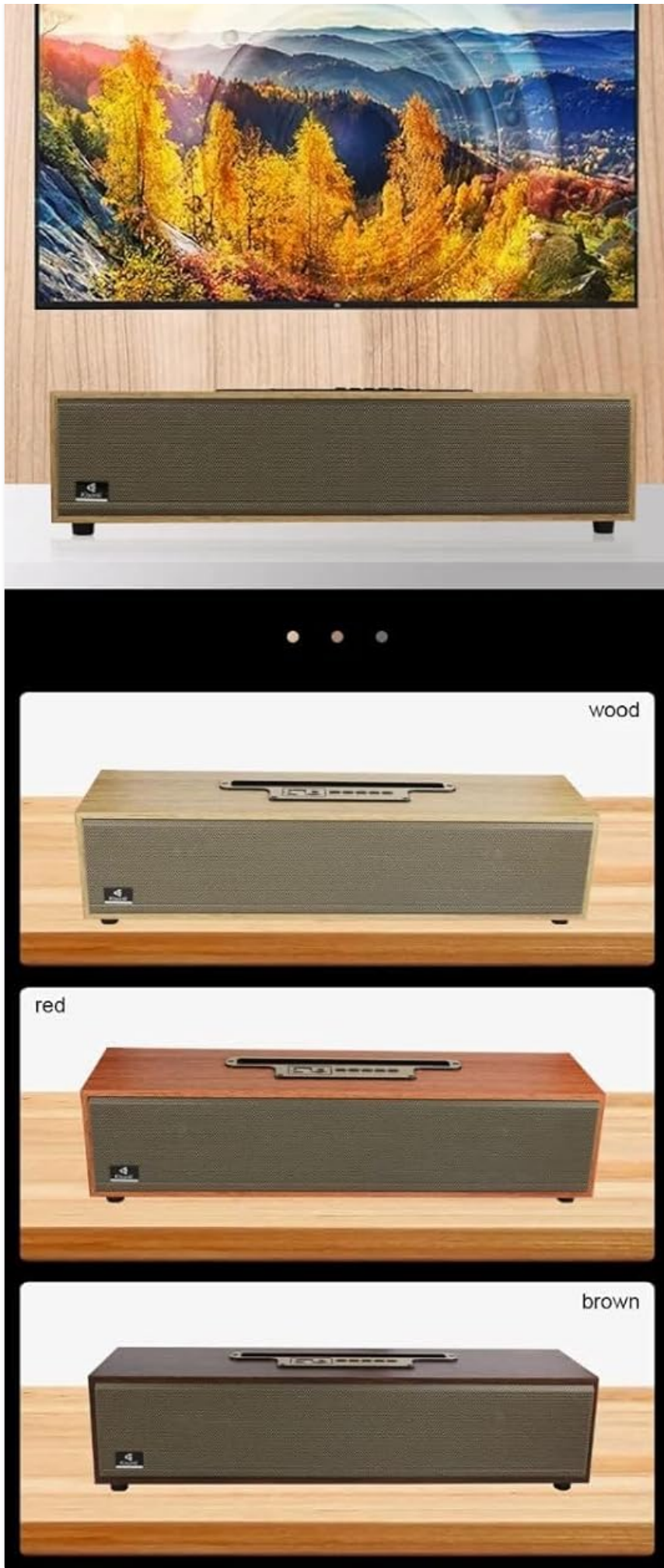
Image: An illustration of the Kisonli G11 speaker's 360-degree stereo sound capability, along with visual representations of