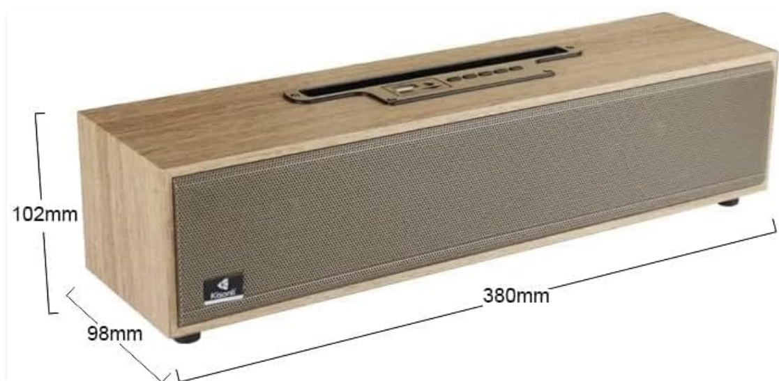
Image: The Kisonli G11 speaker with its dimensions indicated: 380mm in length, 98mm in depth, and 102mm in height.