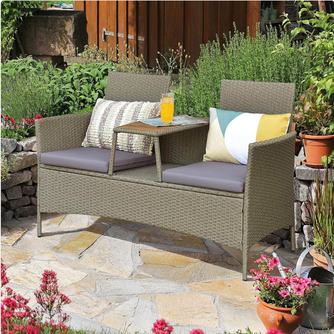
The loveseat is shown in a garden environment, highlighting its versatility for various outdoor spaces.