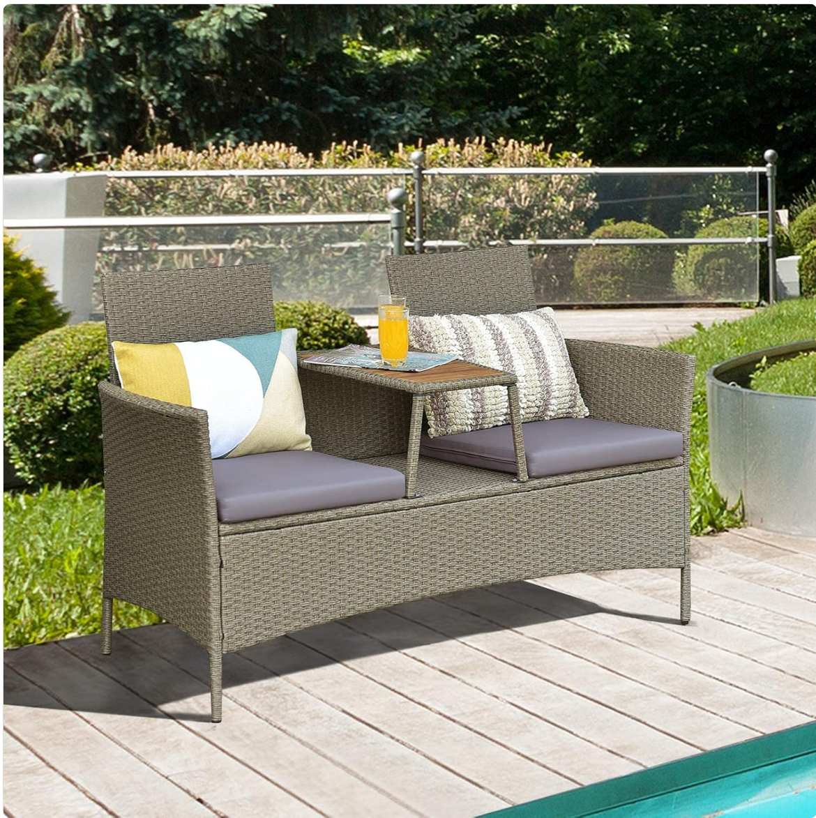
This image shows the assembled HAPPYGRILL Patio Loveseat with its built-in table and cushions, situated on a wooden deck next to a swimming pool, demonstrating its intended outdoor use.