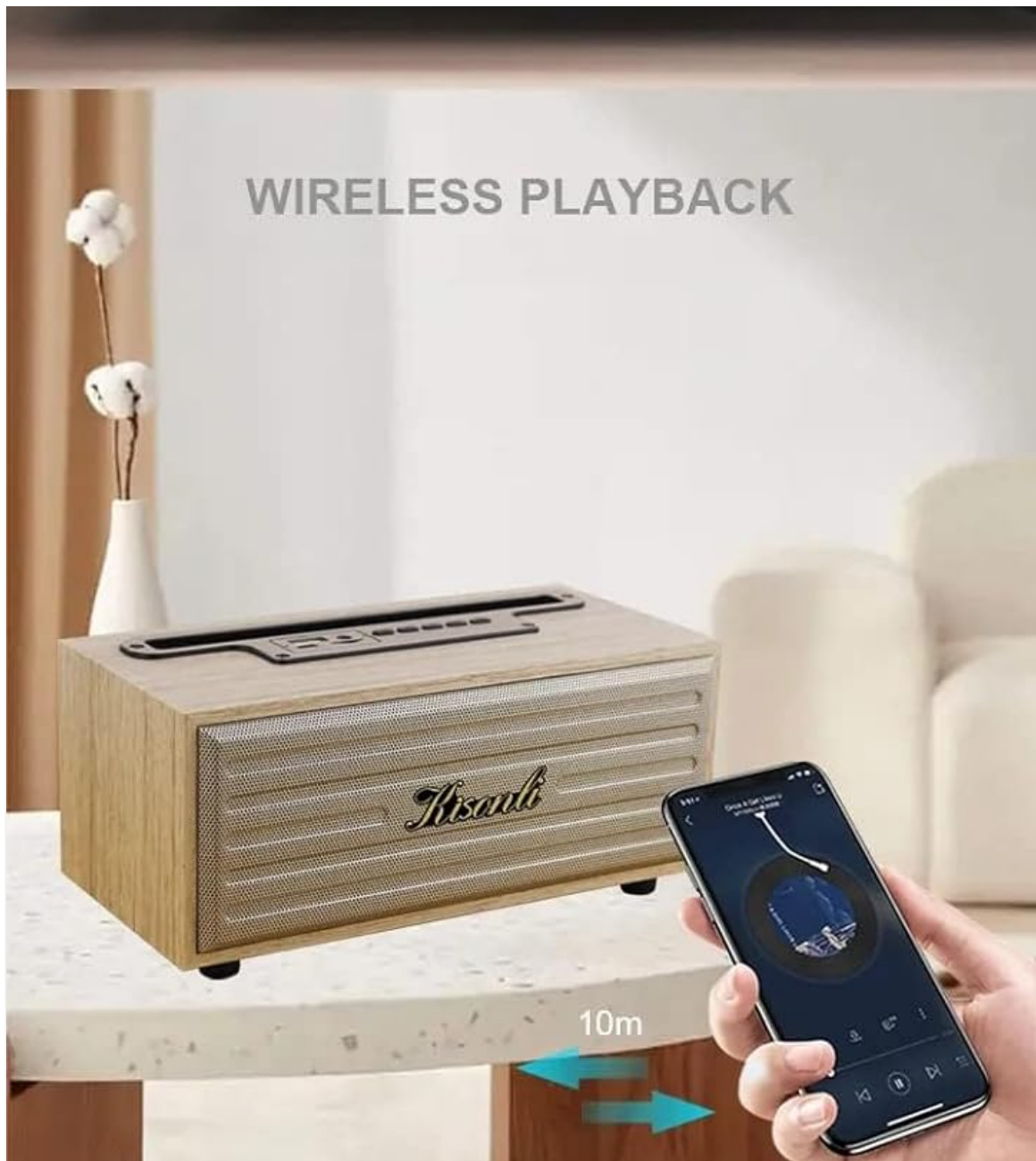
Image: The Kisonli G12A speaker in a home setting, demonstrating its phone holder functionality with a device docked, and illustrating wireless Bluetooth playback from another smartphone up to 10 meters away.