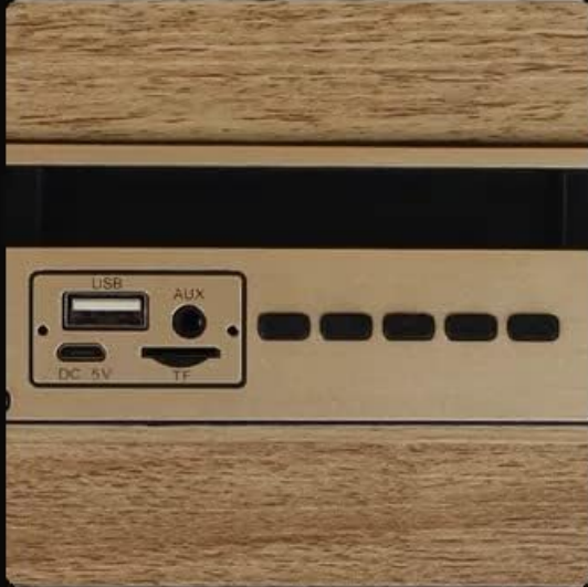
multiple playback modes easy to operate