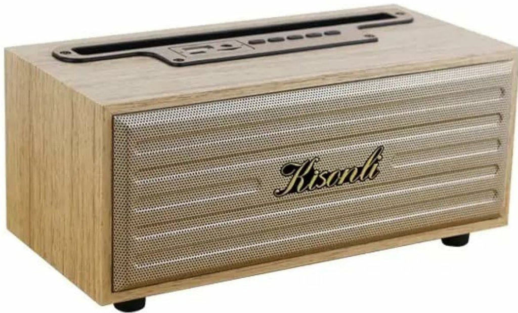
Image: The Kisonli G12A speaker, showcasing its wooden finish and retro design, with a smartphone placed in its integrated holder.