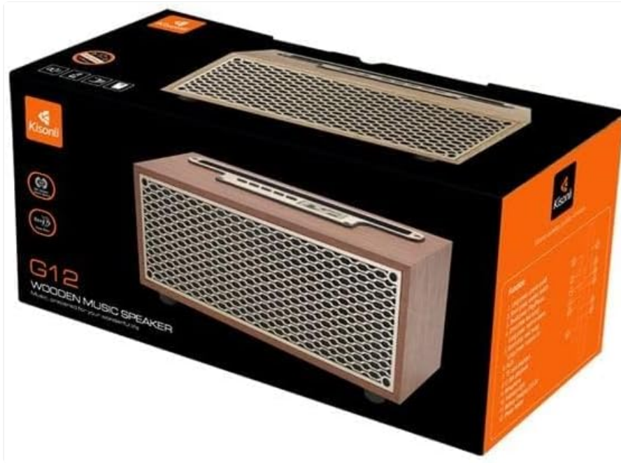
Image: The retail packaging box for the Kisonli G12A speaker, showing the product image and brand logo.