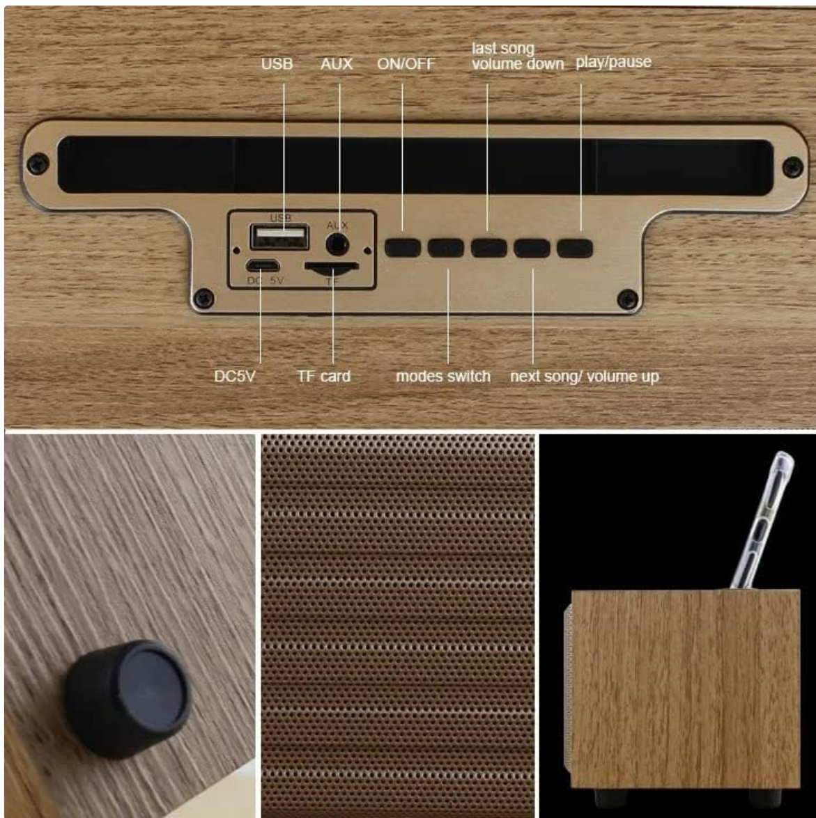
Image: A detailed view of the speaker's top panel, highlighting the control buttons and ports including USB, AUX, ON/OFF, volume controls, play/pause, mode switch, TF card slot, and DC 5V charging port.