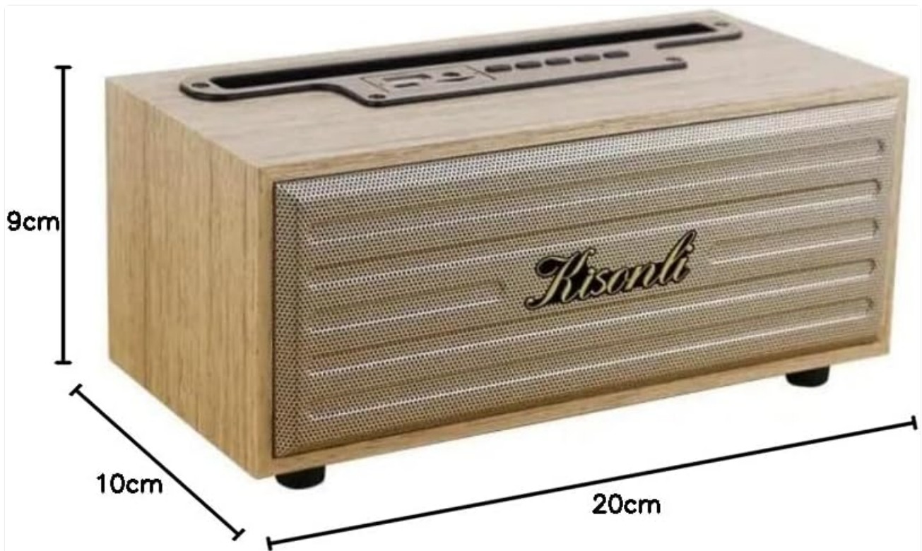
Image: The Kisonli G12A speaker with its physical dimensions clearly marked: 9cm height, 10cm depth, and 20cm width.