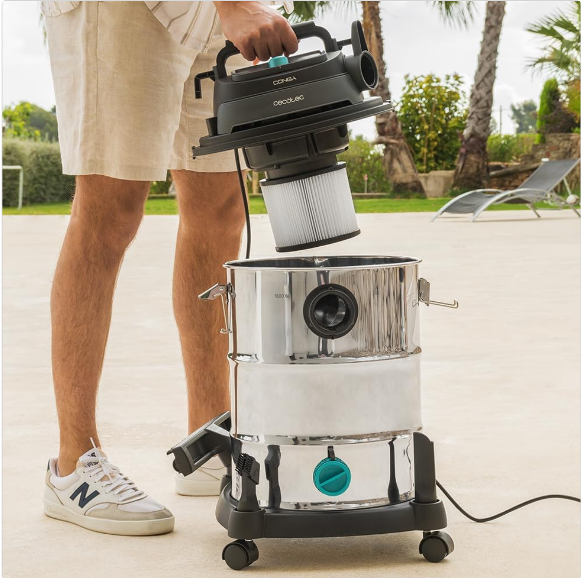
Image 3.1: Illustration of the filter removal/installation process. The top motor unit is lifted off the tank, revealing the filter assembly.