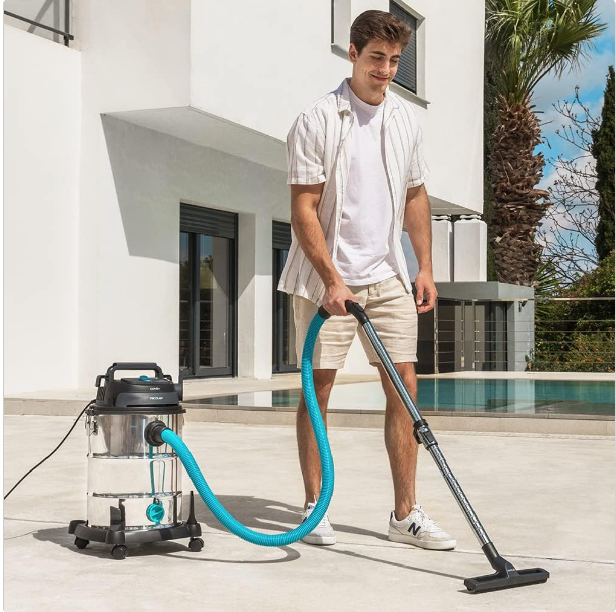
Image 4.1: A user demonstrating dry vacuuming of outdoor patio with the floor brush attachment.