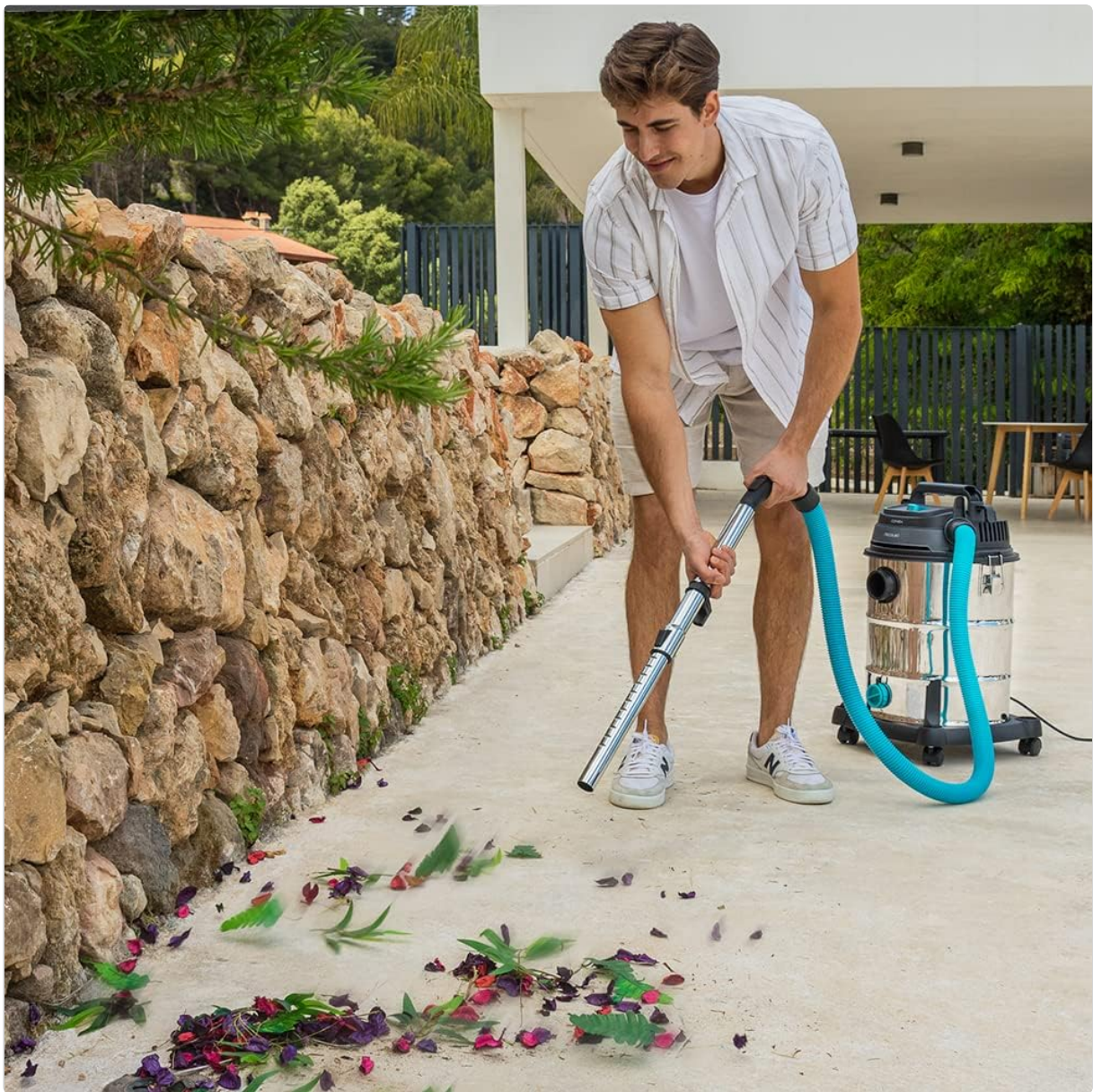
Image 4.3: A user utilizing the blowing function to clear leaves and debris from an outdoor path.