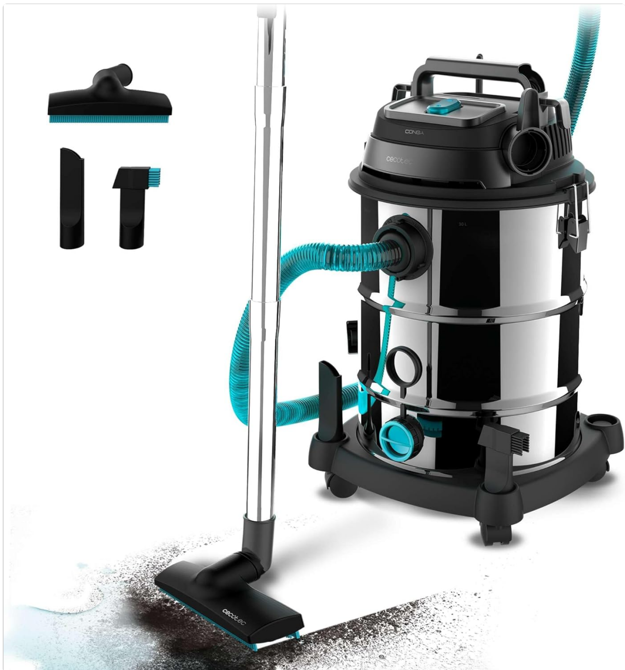
Image 2.1: The Cecotec Conga Rockstar Wet & Dry Steel Pro 30L vacuum cleaner with its various attachments, including floor brush, crevice tool, and upholstery brush.