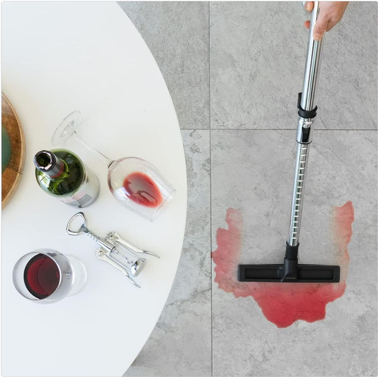
Image 4.2: The vacuum cleaner effectively cleaning a spilled liquid (red wine) from a tiled floor.