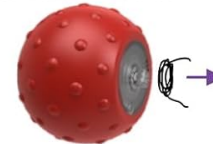
Image: A step-by-step visual guide on how to open the toy, remove the inner ball, clean accumulated fur from the gears, and reassemble it.