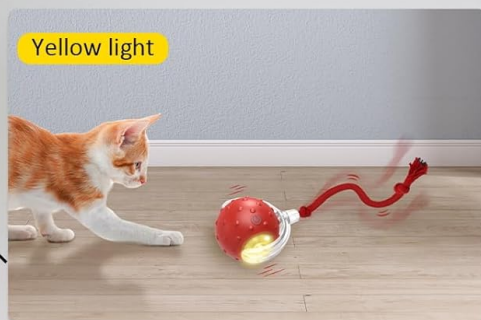
Image: Visual guide to the three working modes: Fast (Blue light) for high-energy cats, Slow (Purple light) for general play, and Interactive (Yellow light) for touch-activated engagement.