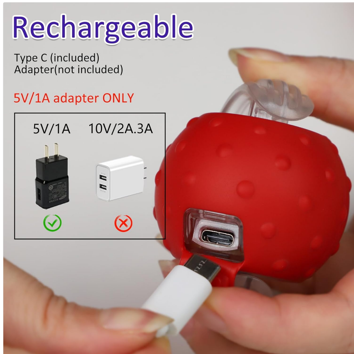
Image: The Giciv cat toy ball showing its USB-C charging port and indicating that only a 5V/1A adapter should be used.

Before first use, fully charge the cat toy ball. Use only a 5V/1A adapter for charging. The charging port is a USB-C type. A red light will flash regularly during low battery, and remain solid red when fully charged. Charging typically takes approximately 2 hours.