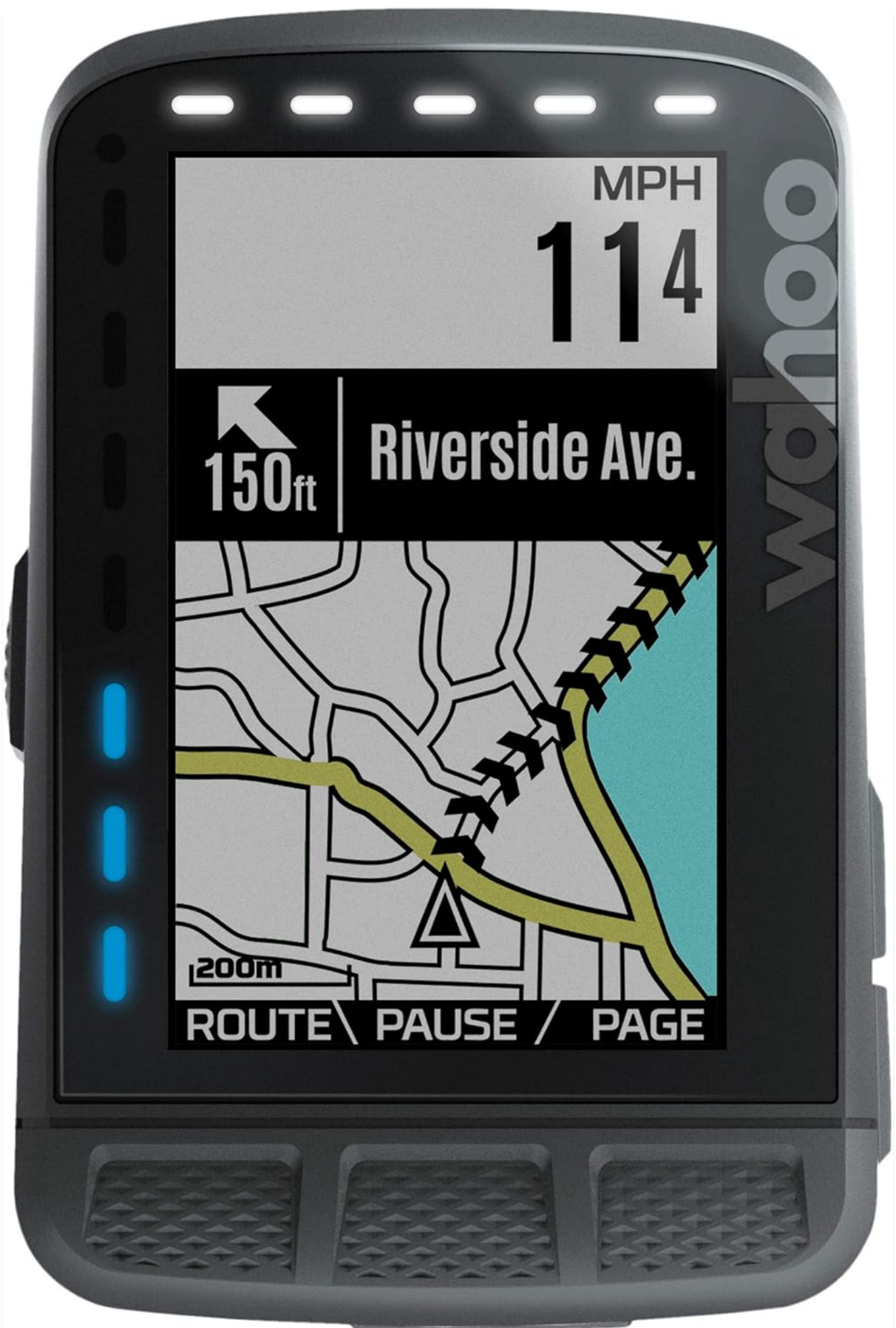
Figure 1: Front view of the Wahoo ELEMNT ROAM displaying turn-by-turn navigation.