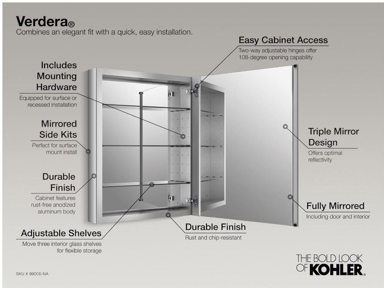
Image: Exploded view showing mounting hardware, adjustable shelves, and the triple mirror design of the cabinet.

for mounting hardware placement and specific feature callouts.