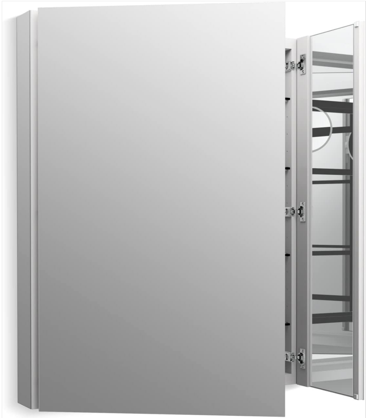
Image: The medicine cabinet with its doors open, showcasing the interior storage and mirrored surfaces.

The cabinet features two slow-close doors designed for quiet and smooth operation. Gently pull the door handle to open. The integrated slow-close mechanism will ensure the door closes softly without slamming. Avoid forcing the doors open or closed, as this can damage the hinges.