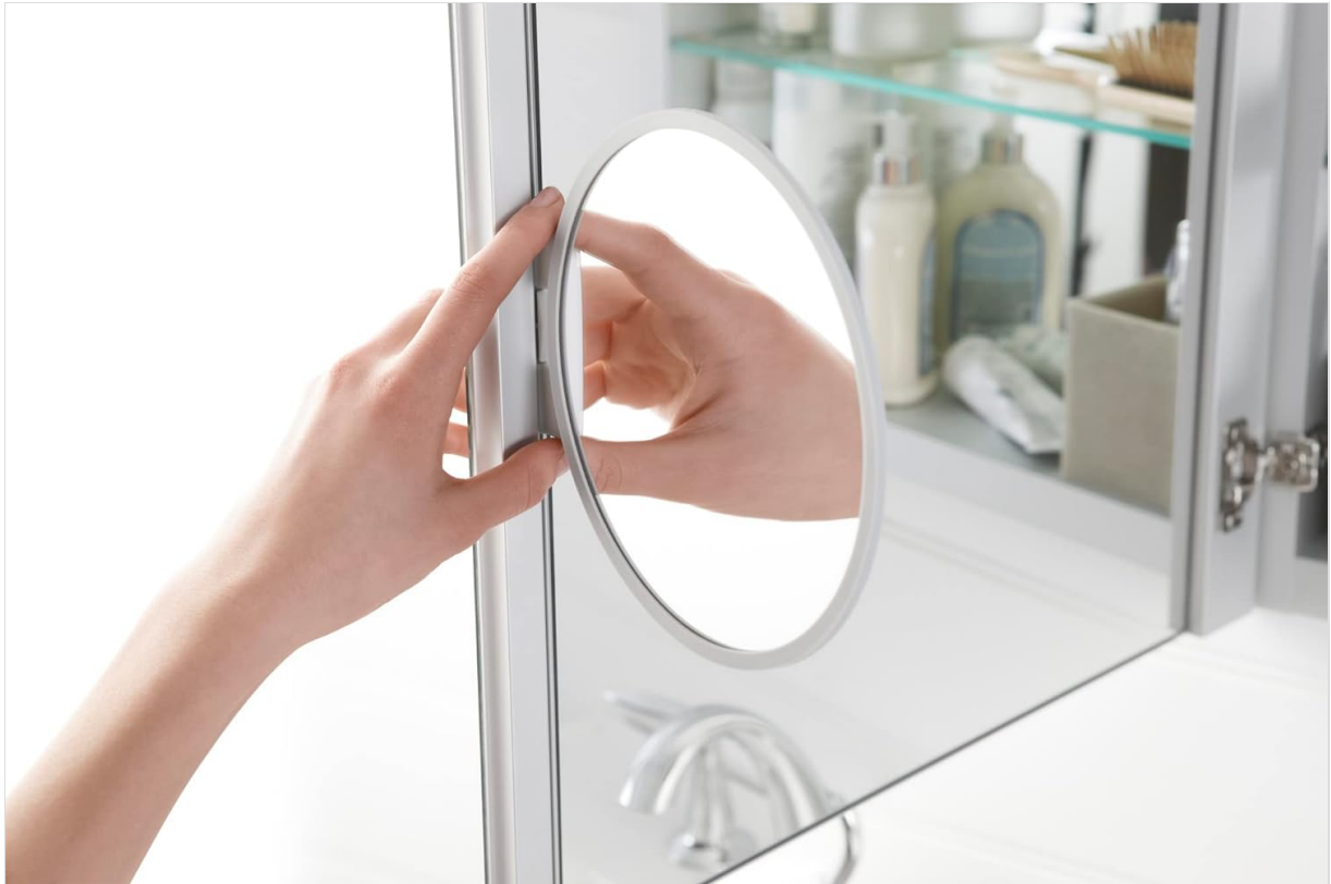
Image: A hand demonstrating the vertical adjustment of the magnifying mirror inside the cabinet door.