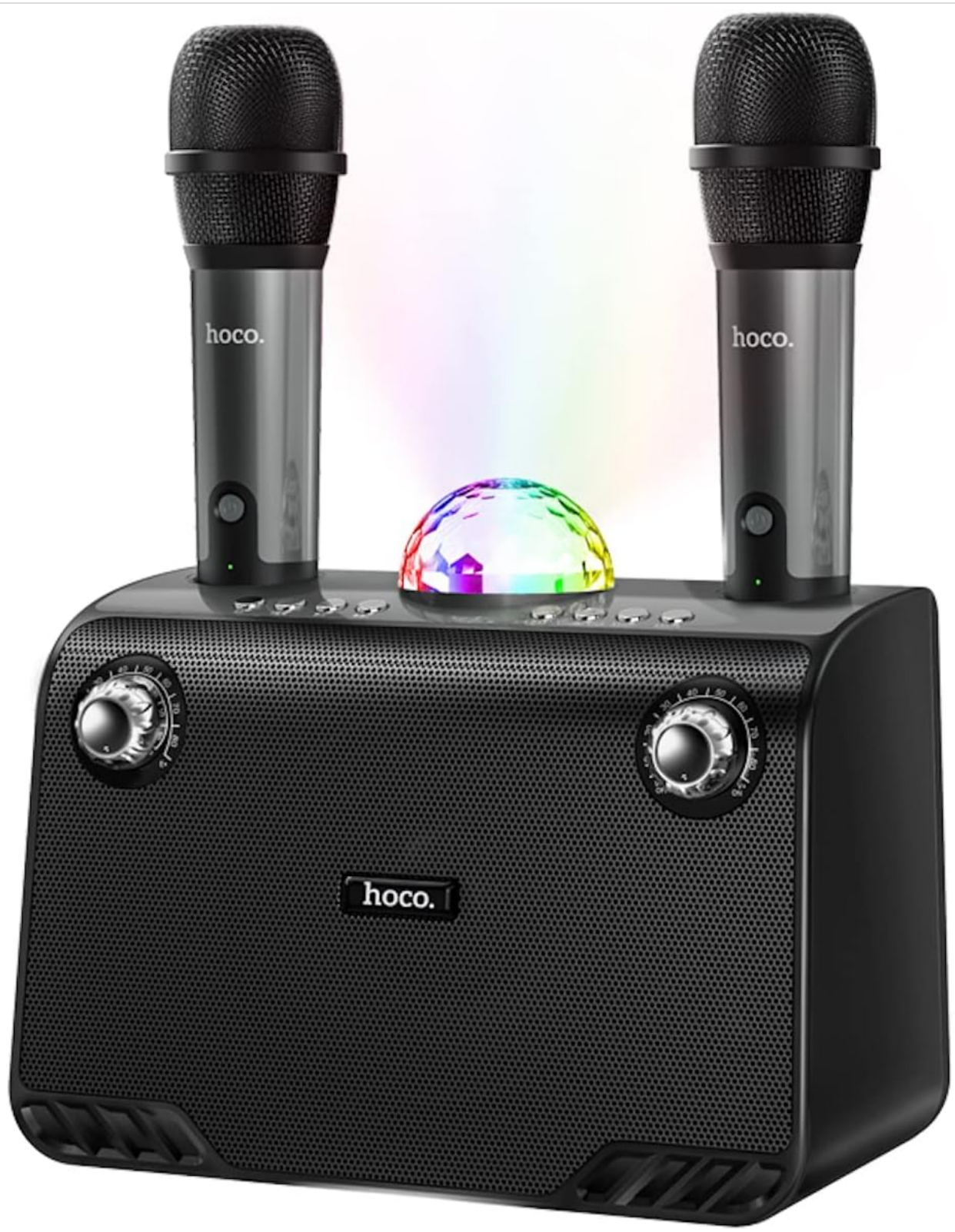
Front view of the HOCO BS41 Plus speaker, showcasing its robust design, integrated disco light, and two wireless microphones docked on top.