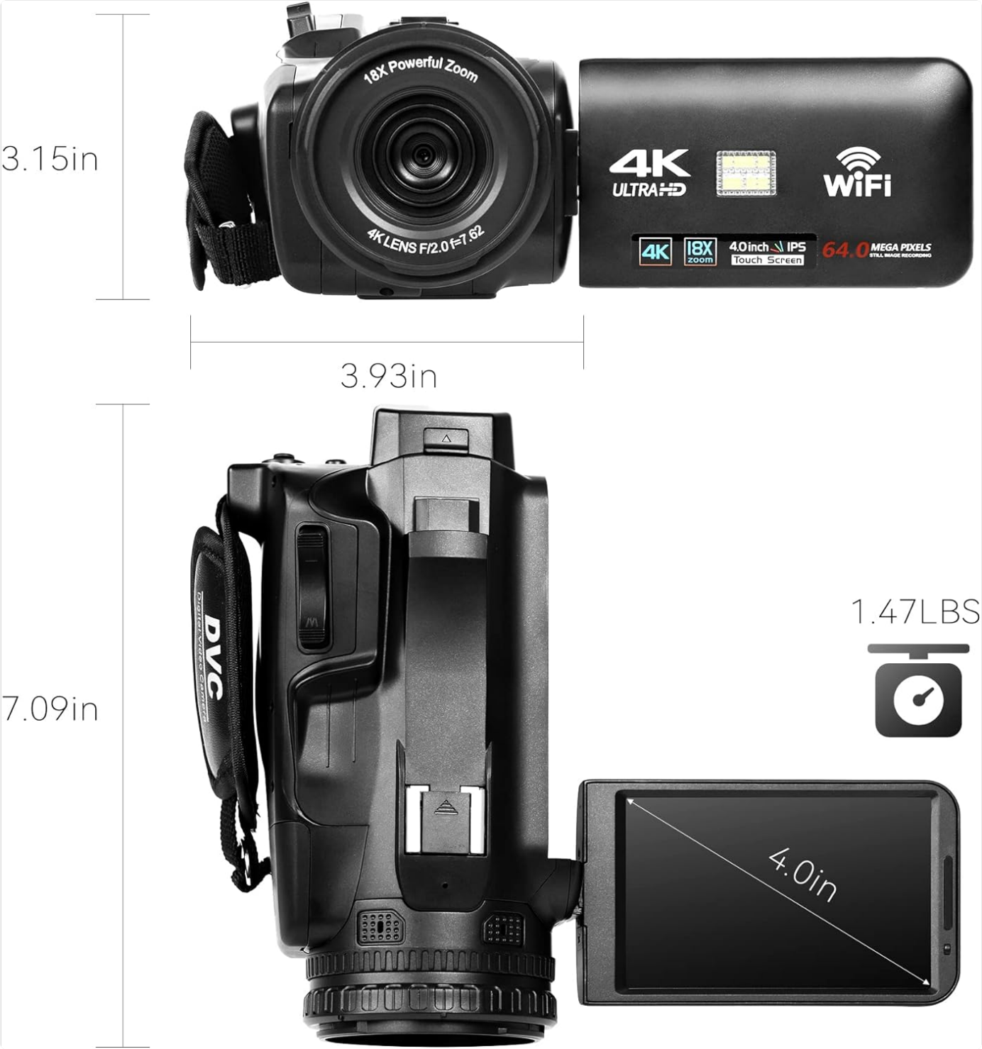
Figure 8: Camcorder dimensions and weight.