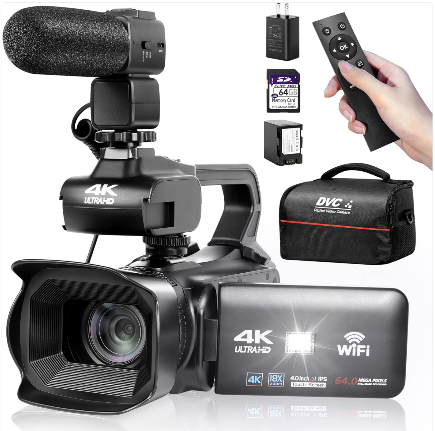
Figure 1: OIEXI UHD 4K Video Camera Camcorder and Included Accessories.