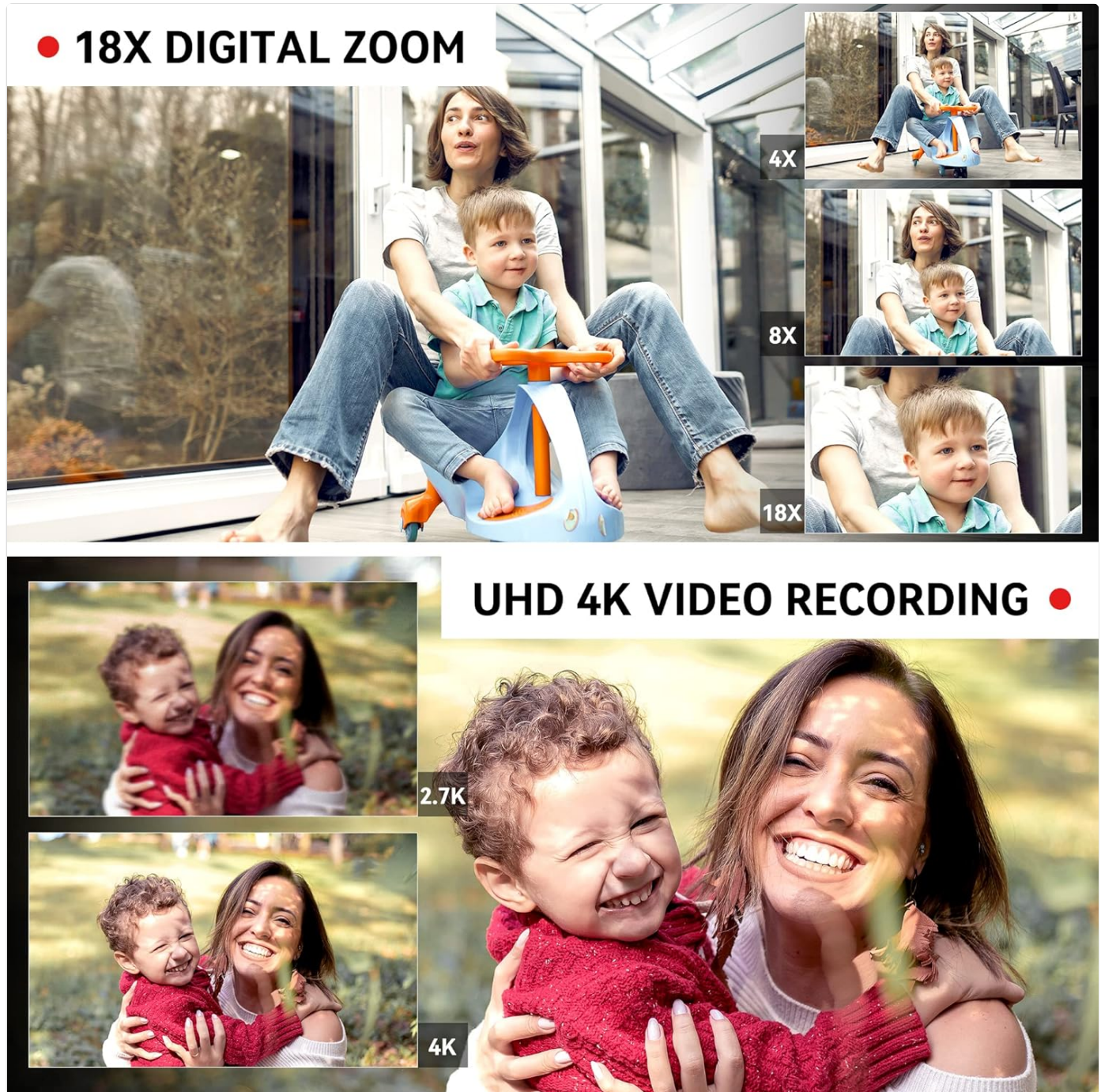
Figure 4: Demonstrating 18X Digital Zoom and 4K video quality.