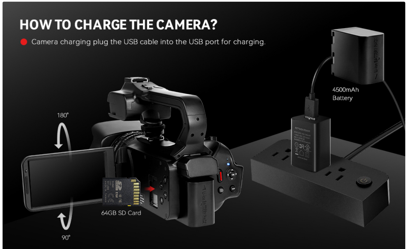
Figure 3: Battery charging and SD card insertion.