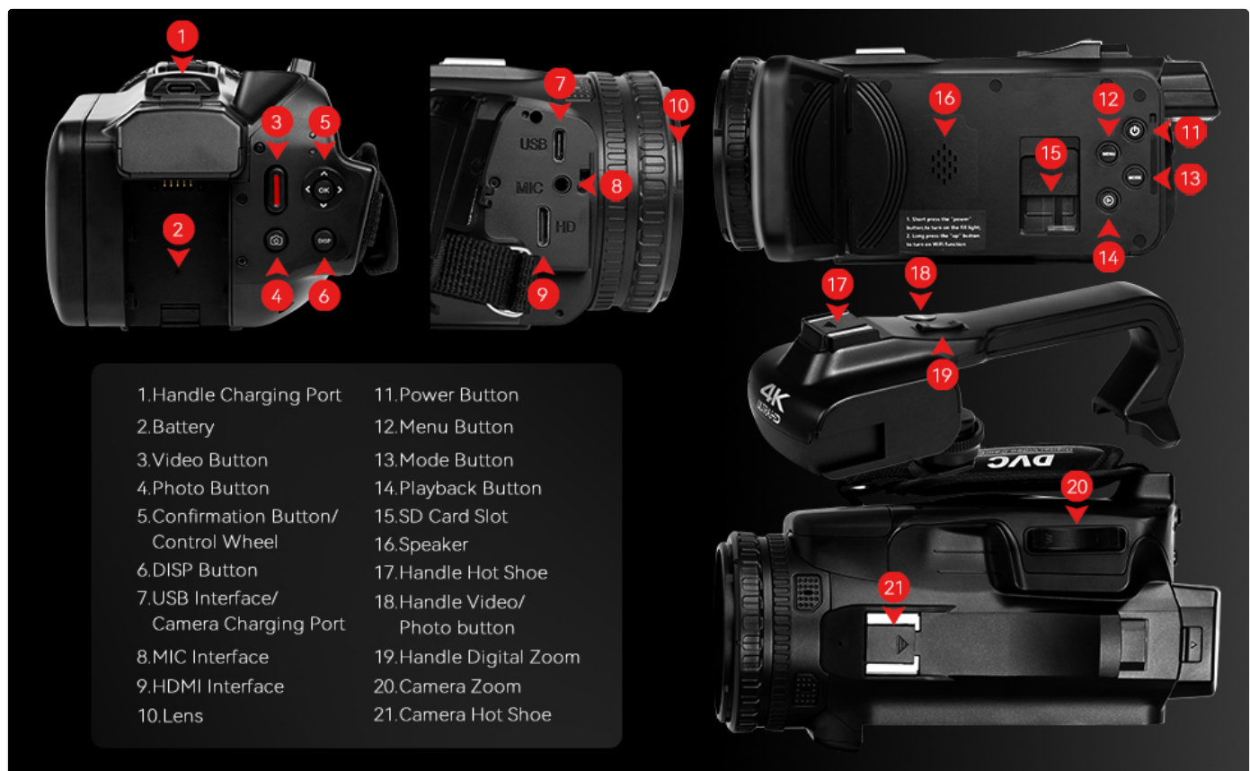
Figure 2: Detailed diagram of the camcorder's components.