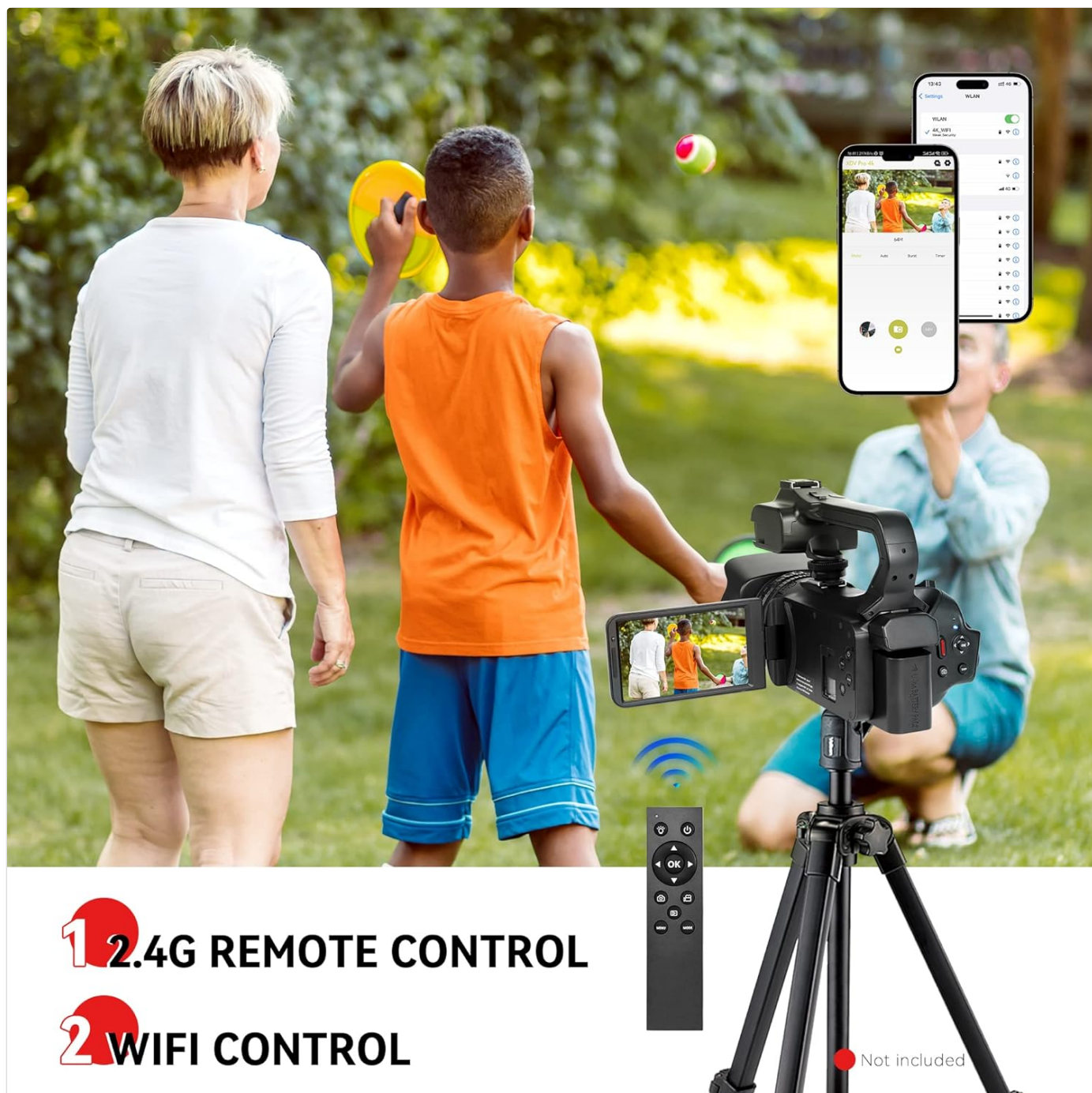
Figure 7: Remote and Wi-Fi control options.