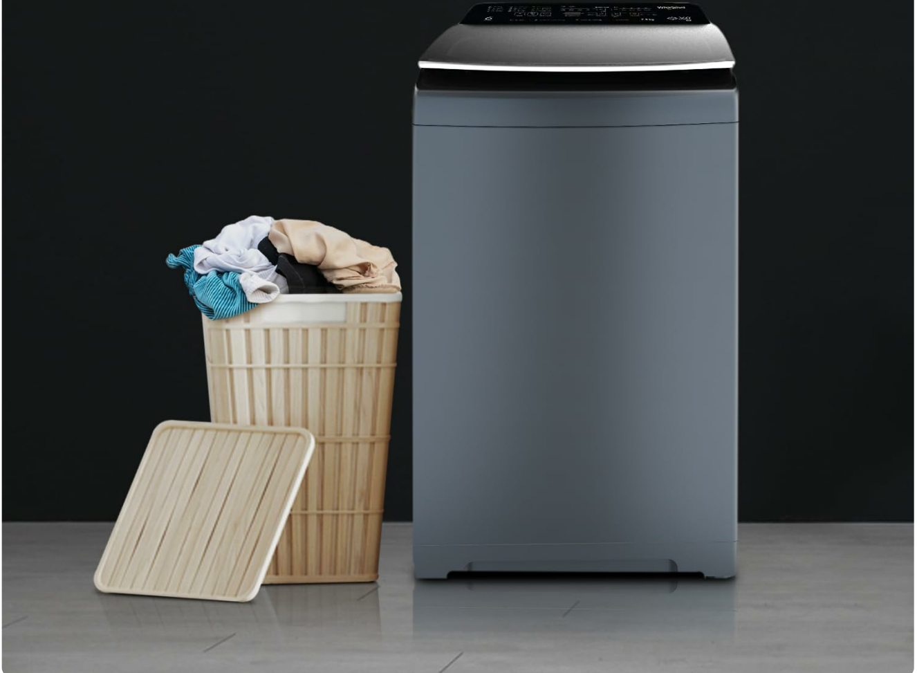
Figure 4.3: Additional features like ZPF Technology, Hard Water Wash, and Soft Close Lid.

7 YEAR ADDITIONAL WARRANTY ON MOTOR & PRIME MOVE