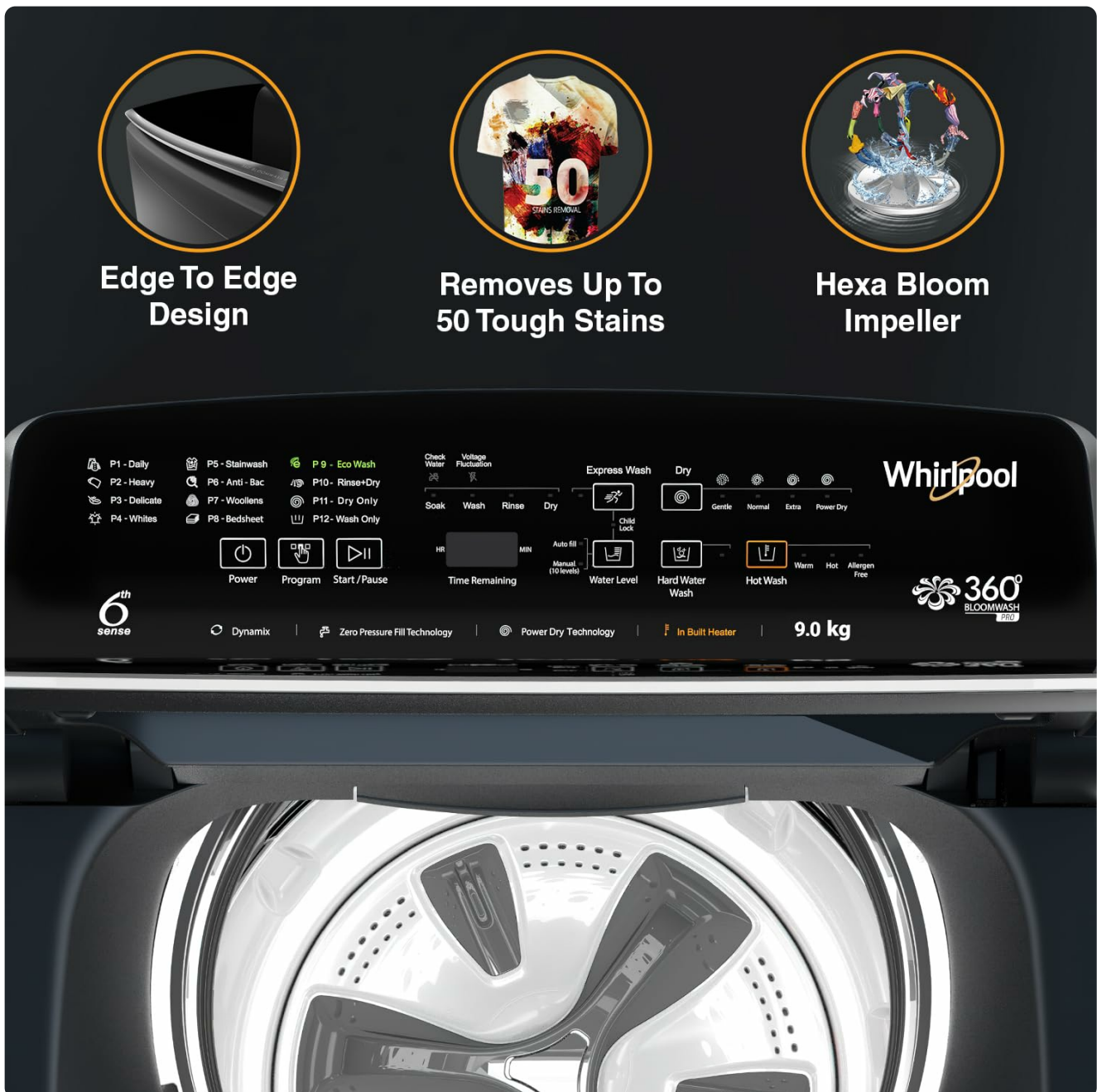
Figure 4.2: Key features including removal of up to 48-hour old stains, Power Dry, and 3 Hot Water Modes.