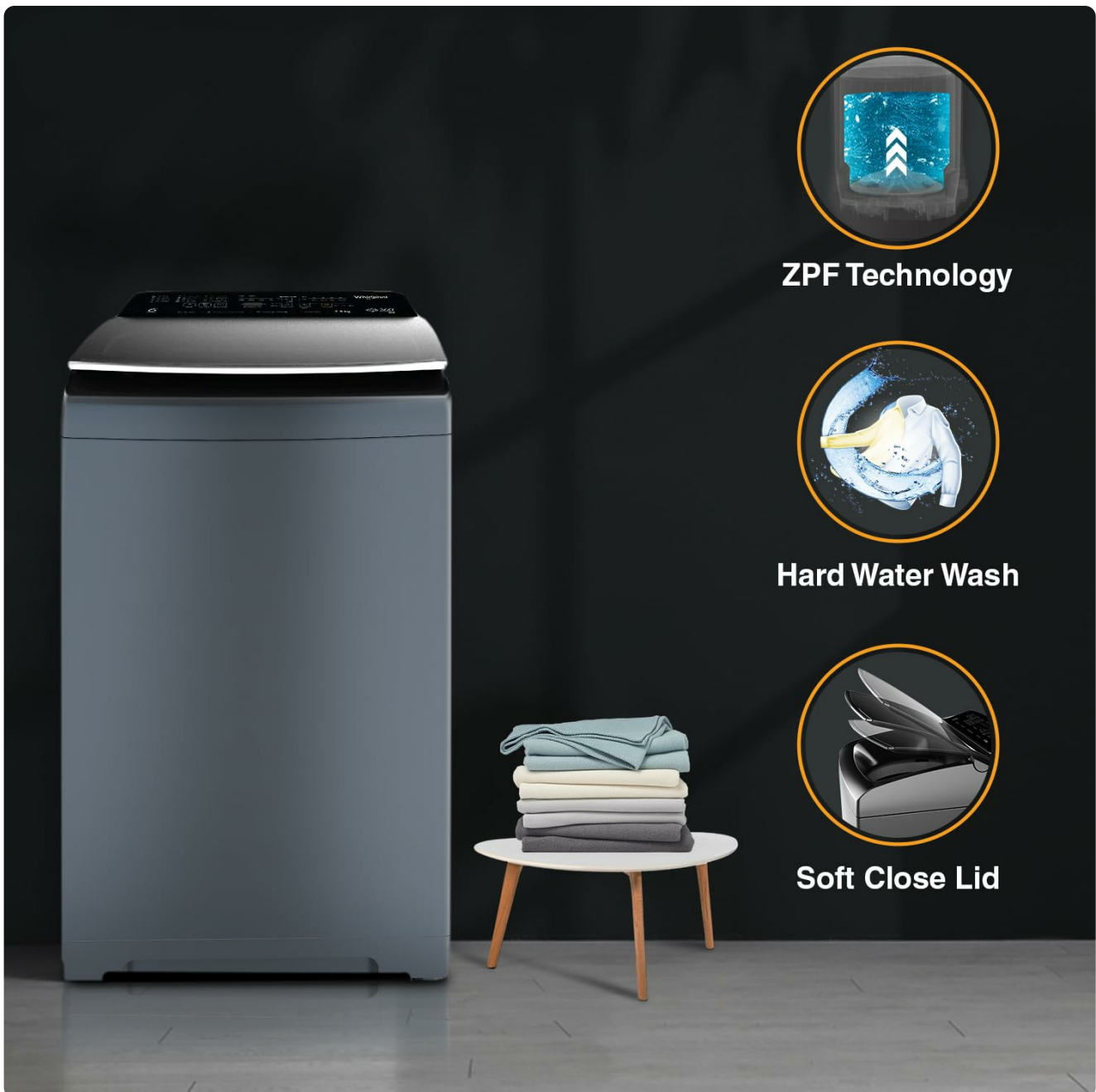
Figure 4.1: Control panel and key features including 12 Wash Programs, In-Built Heater, Express Wash, Child Lock, 6th Sense Technology, and 5 Star Energy Rating.