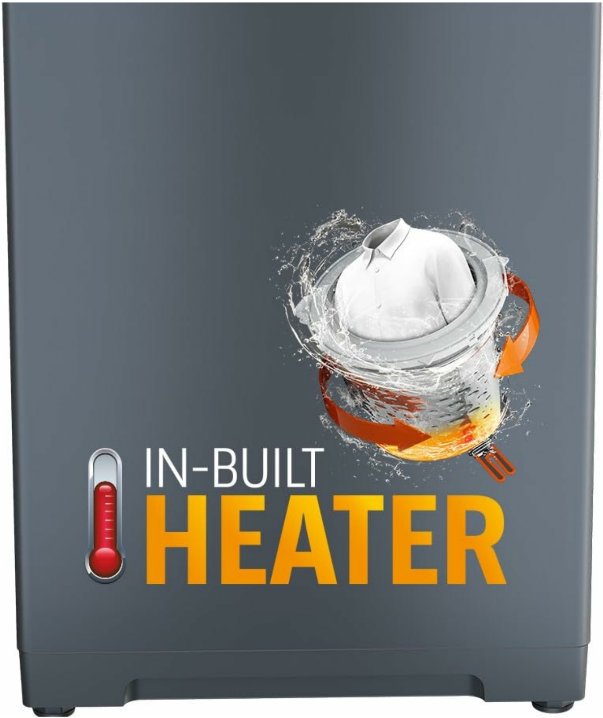
Figure 1.1: Whirlpool Bloomwash Pro Washing Machine.