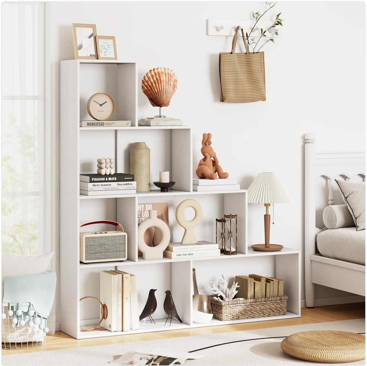
Image: The bookcase integrated into a bedroom, displaying books and various decorative objects, highlighting its aesthetic and functional use.