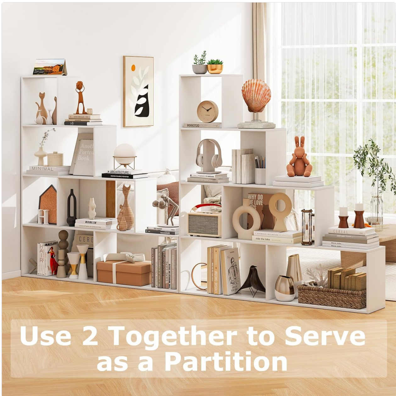
Image: Two bookcases arranged together, illustrating how they can be combined to form a larger unit or serve as a room divider.