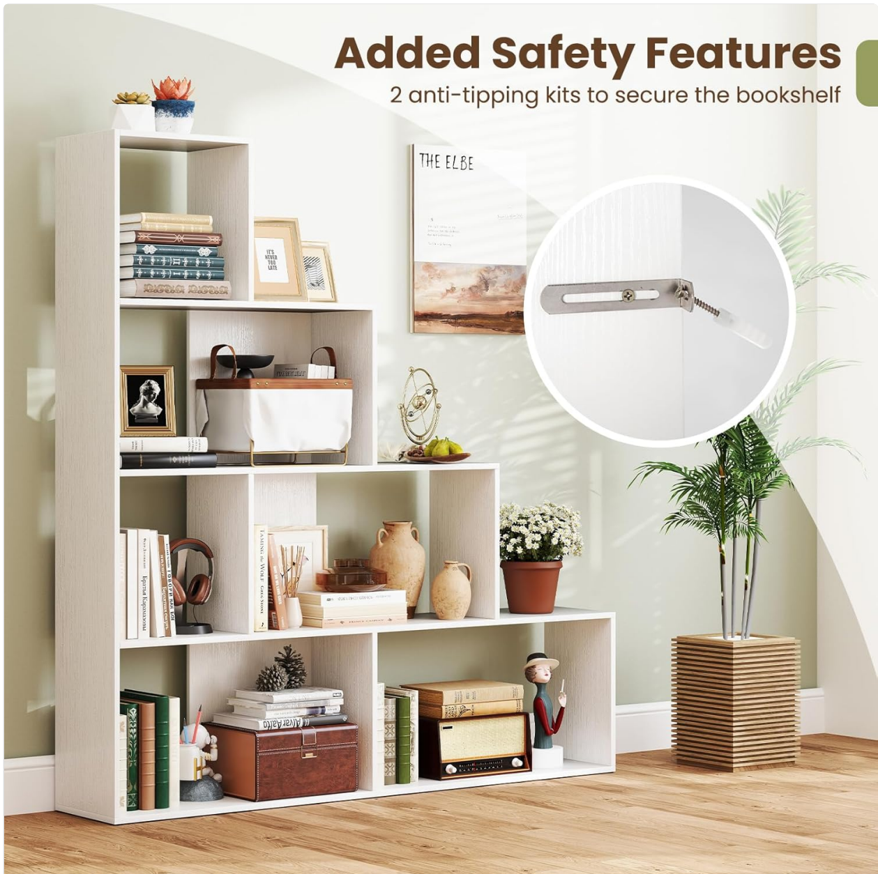
Image: Illustration of the anti-topping device installation, showing how to secure the bookcase to a wall for safety.