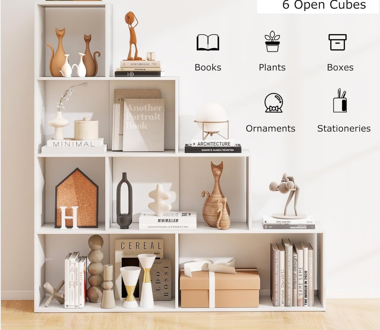
Image: Demonstrates the large storage capacity of the bookcase, showcasing its ability to hold books, plants, boxes, ornaments, and stationery within its six open cubes.