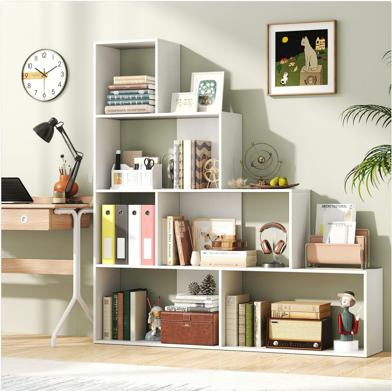
Image: Overall dimensions of the IFANNY 4-Tier Step Bookcase, including height, width, depth, and individual cube measurements.

The bookcase features a step design that can be oriented with the steps on either the left or right side during assembly. Refer to the diagram below for overall dimensions.