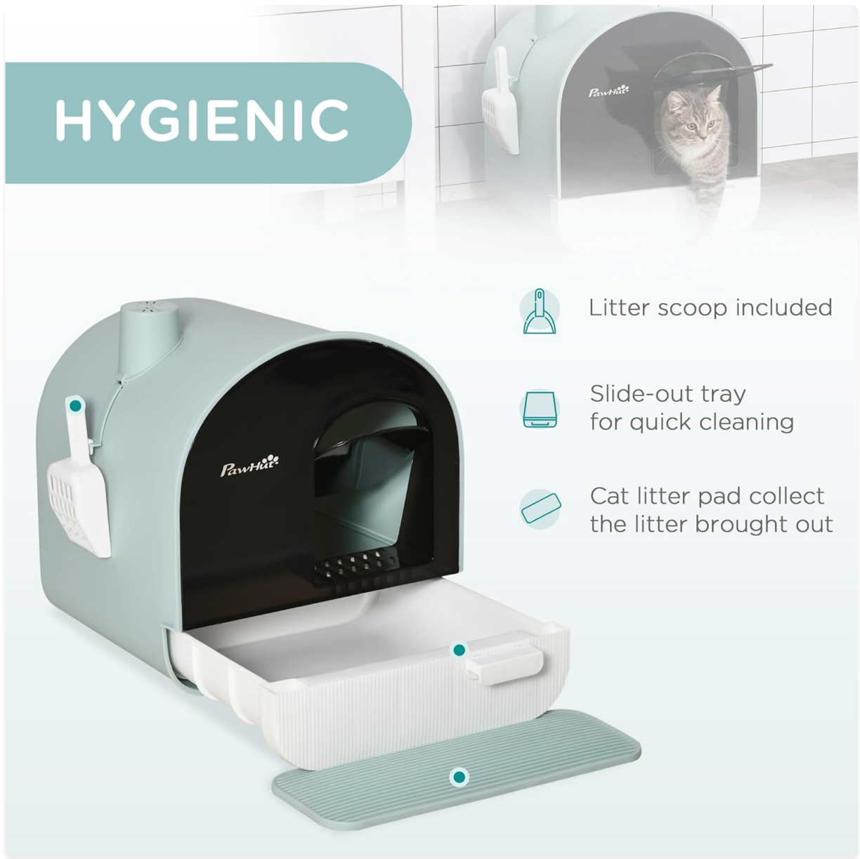
Image 2.1: Included components: litter box, removable tray, scoop, and mat.