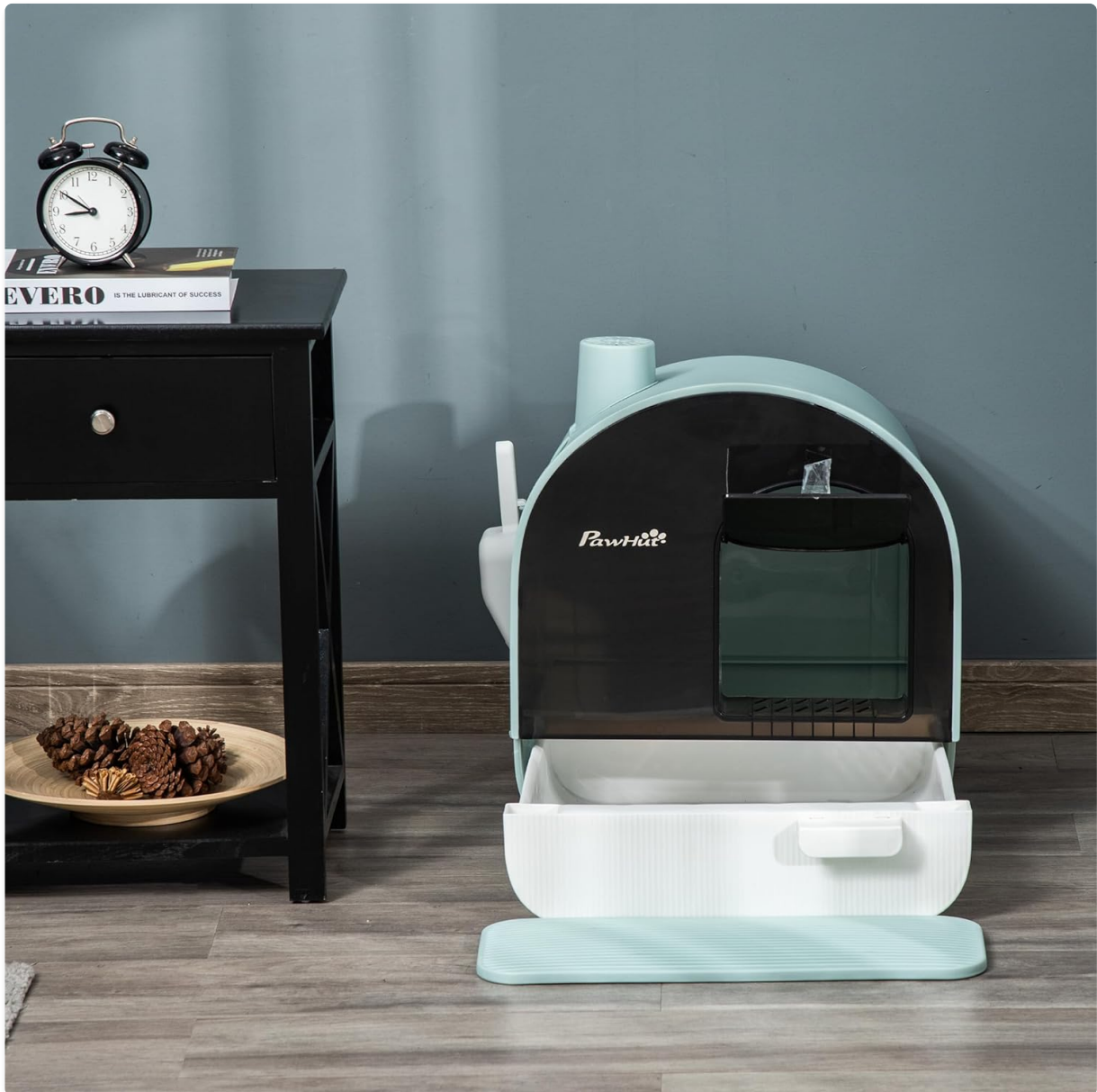
Image 4.1: Litter box in a typical home environment, showing the attached scoop.