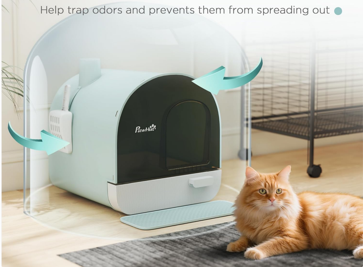
Image 5.2: Illustration of the covered design's odor containment feature.

Help trap odors and prevents them from spreading out ●