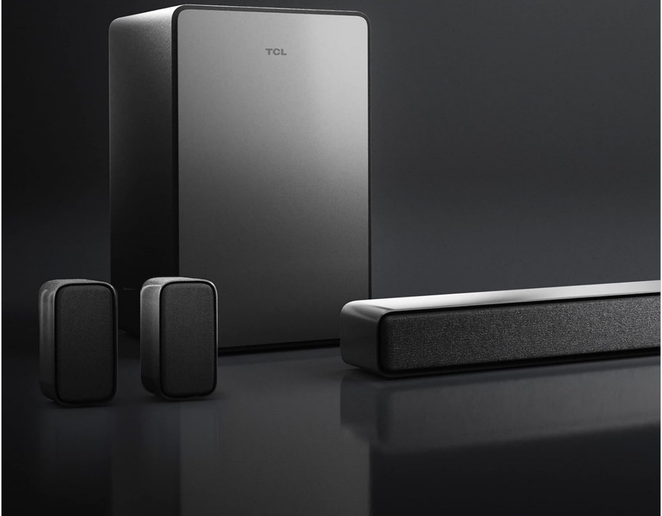
Image 1.2: Overhead view of the sound bar, subwoofer, and rear speakers.