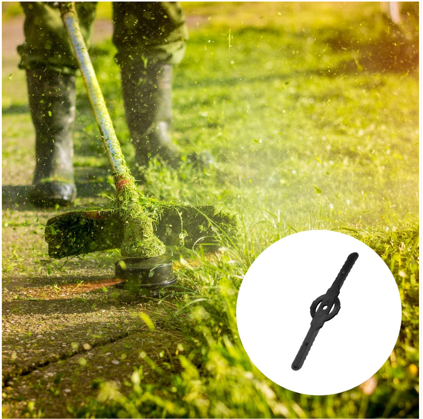
Image: A person operating a string trimmer, demonstrating the blades in action, effectively cutting grass and weeds.