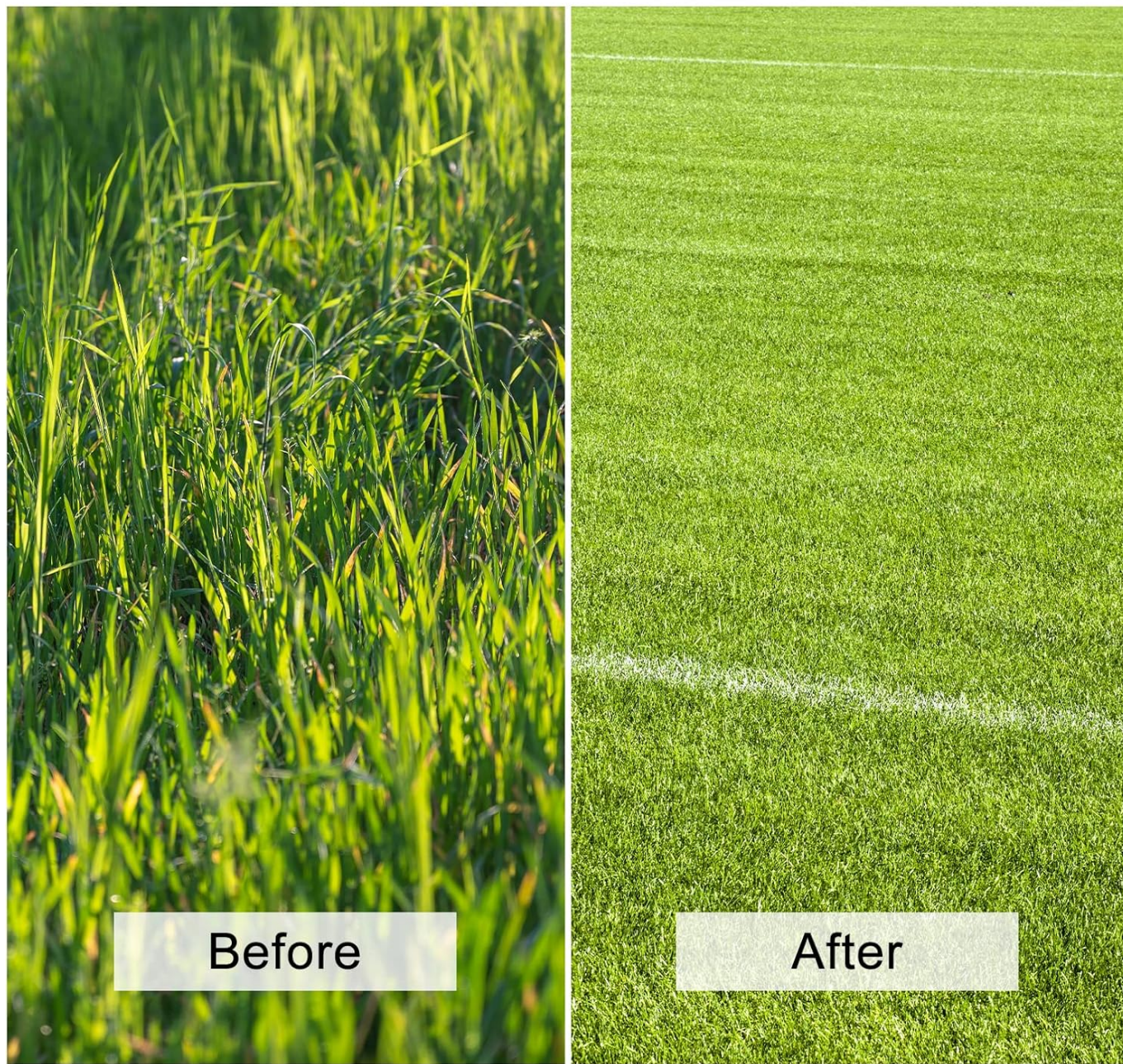
Image: A visual comparison showing an area before and after weeding, illustrating the efficient cutting capability of the uxcell blades.