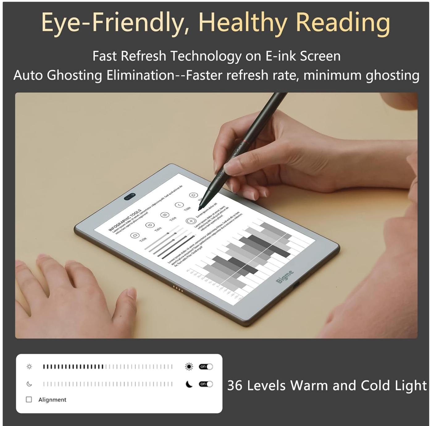
Figure 5.2: Eye-Friendly, Healthy Reading. This image shows the Bigme S6 tablet in use, highlighting features such as fast refresh technology on the E-ink screen, auto ghosting elimination for a faster refresh rate and minimum ghosting, and the ability to adjust between 36 levels of warm and cold front light for optimal reading comfort.

The E-ink display provides a comfortable reading experience with soft front light. The device supports a wide range of e-book formats.