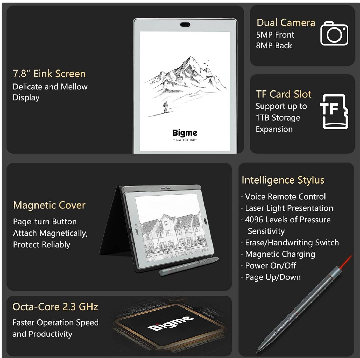
Figure 3.1: Bigme S6 Tablet Overview. This image highlights the 7.8-inch E-ink screen, dual 5MP front and 8MP back cameras, TF card slot for up to 1TB expansion, magnetic cover with page-turn button, octa-core 2.3 GHz processor, and the intelligence stylus with features like voice remote control, laser light presentation, 4096 levels of pressure sensitivity, erase/handwriting switch, magnetic charging, power on/off, and page up/down.