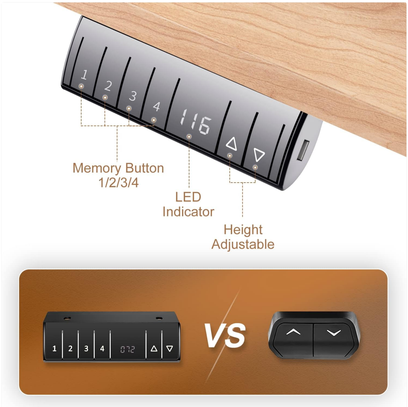
Figure 4: The control panel features memory buttons (1, 2, 3, 4), an LED indicator for current height, and up/down adjustment buttons. This panel allows for precise height control and preset memory functions.