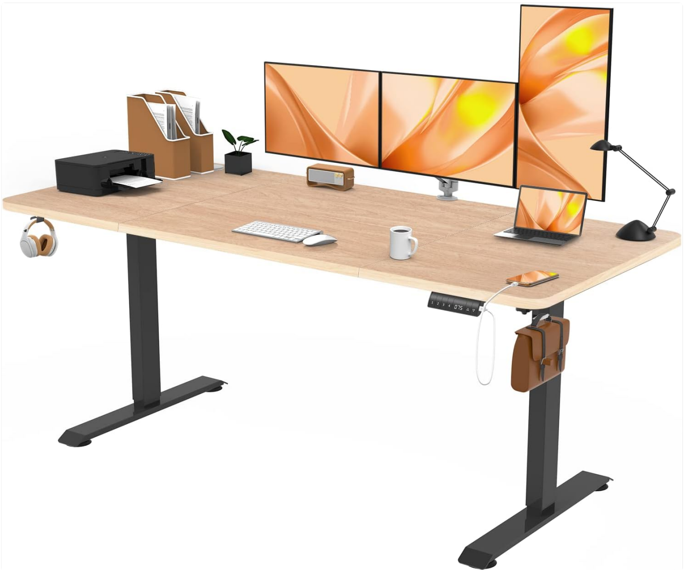
Figure 1: Devoko 180x80 cm Height Adjustable Standing Desk with various office items, showcasing its spacious desktop and integrated features.