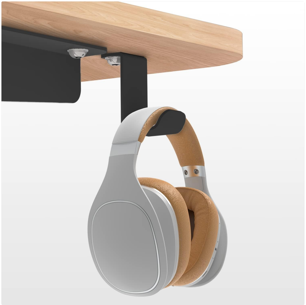
Figure 3: Integrated hook located on the underside of the desk, suitable for hanging headphones or other small items, contributing to a tidy workspace.