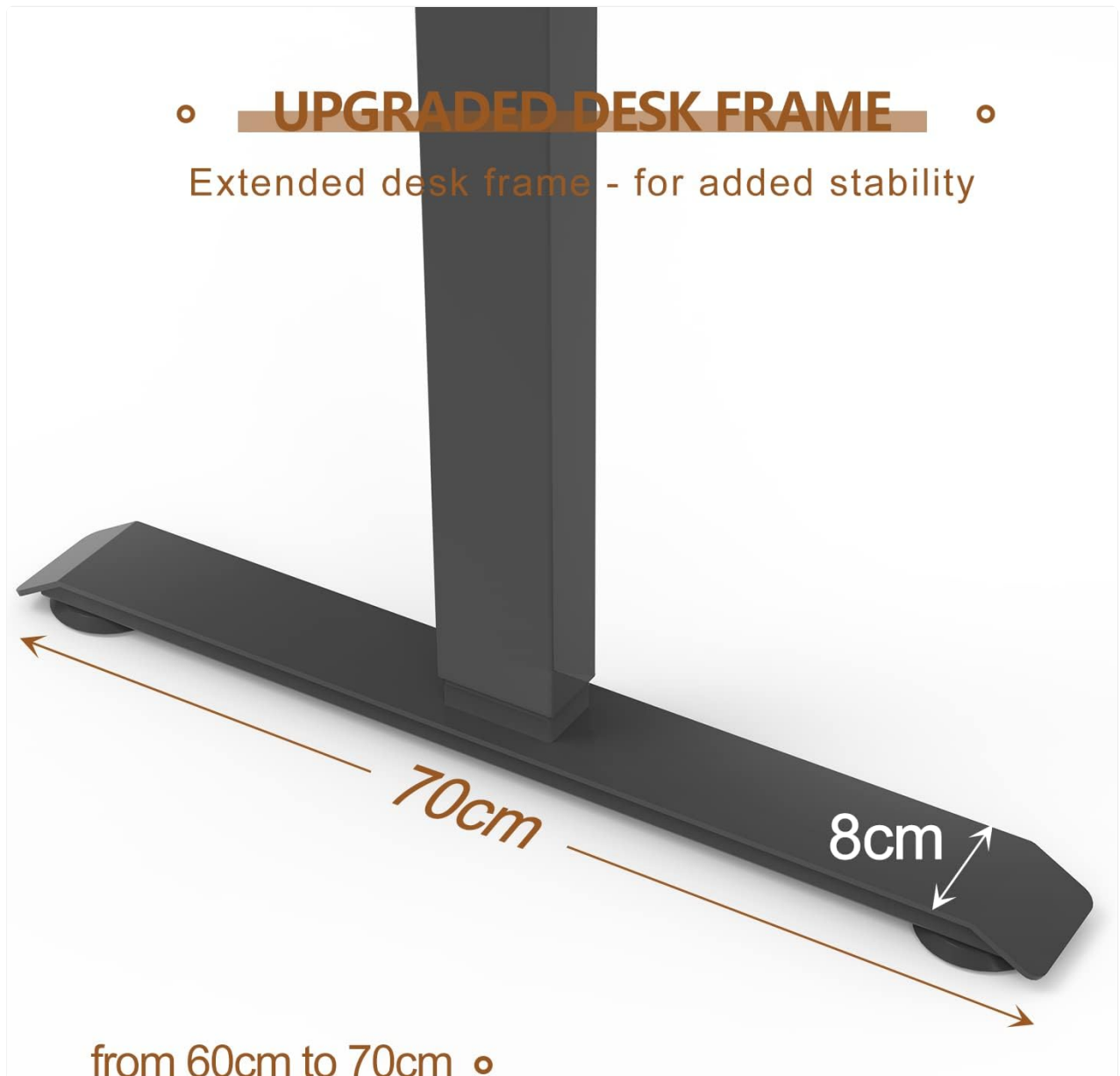
Figure 2: Detail of the desk frame base, indicating its extended design for enhanced stability. The base measures 70cm in length and 8cm in width.