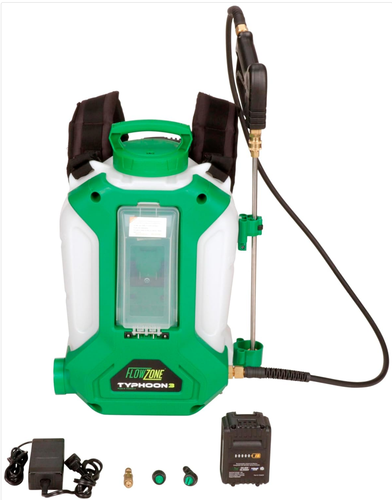
Image: Front view of the FlowZone Typhoon 3 sprayer with key dimensions and weight indicated.