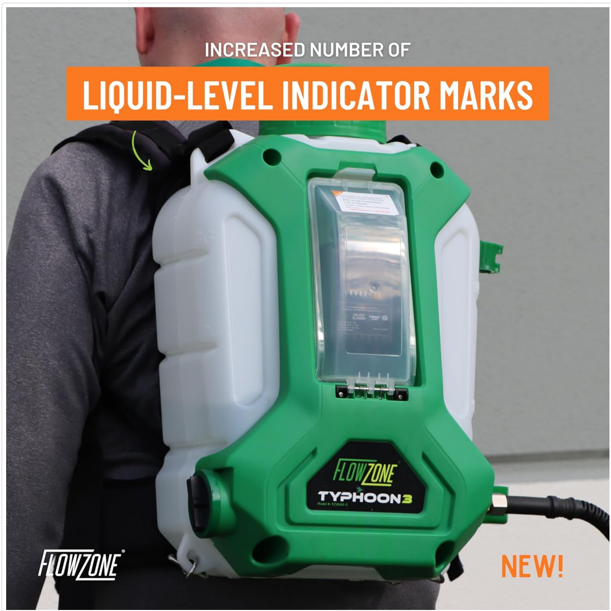
Image: Liquid level indicators on the sprayer tank for easy monitoring.