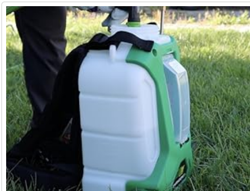
Image: Demonstrating the process of filling the sprayer tank.