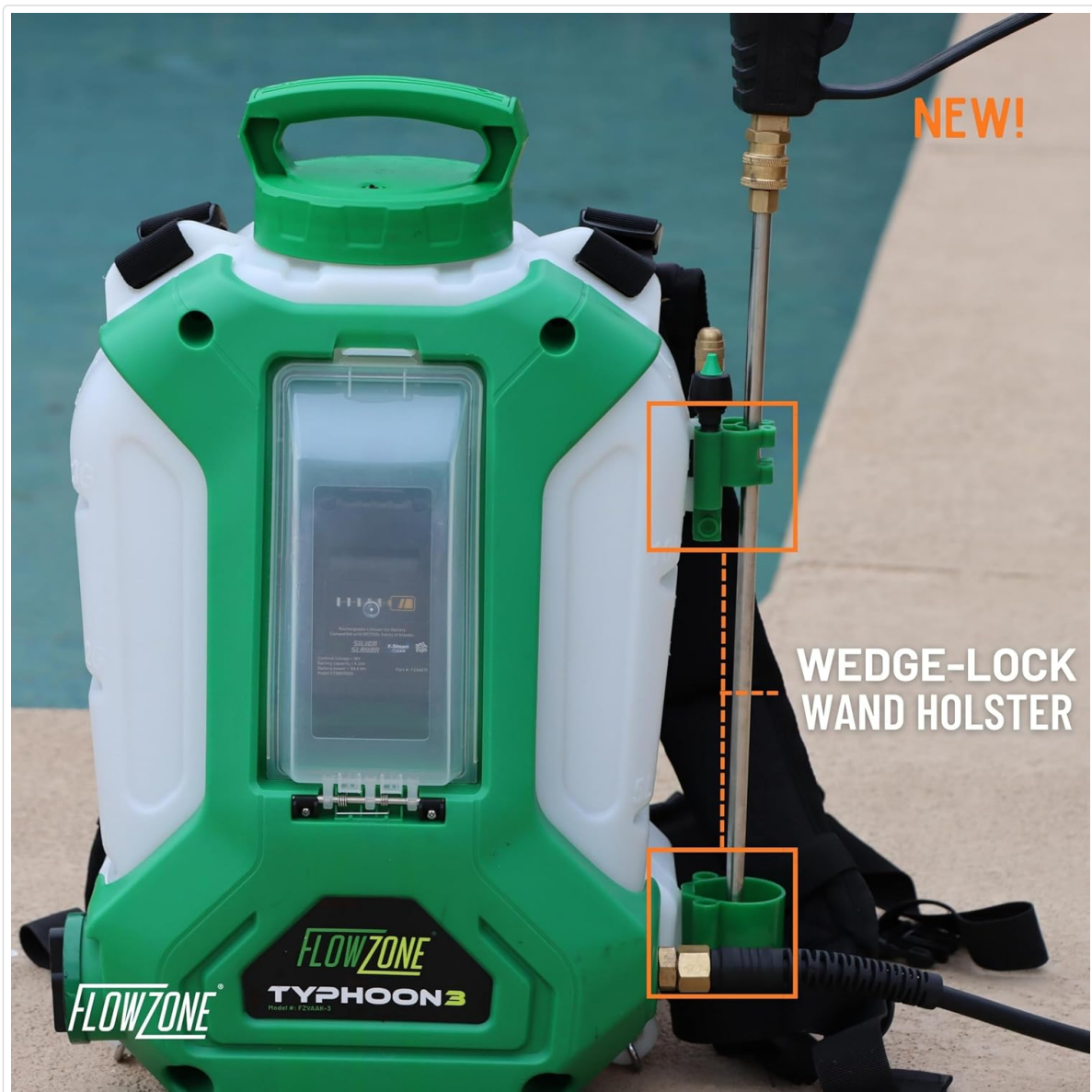
Image: Detail of the wedge-lock wand holster for convenient storage.