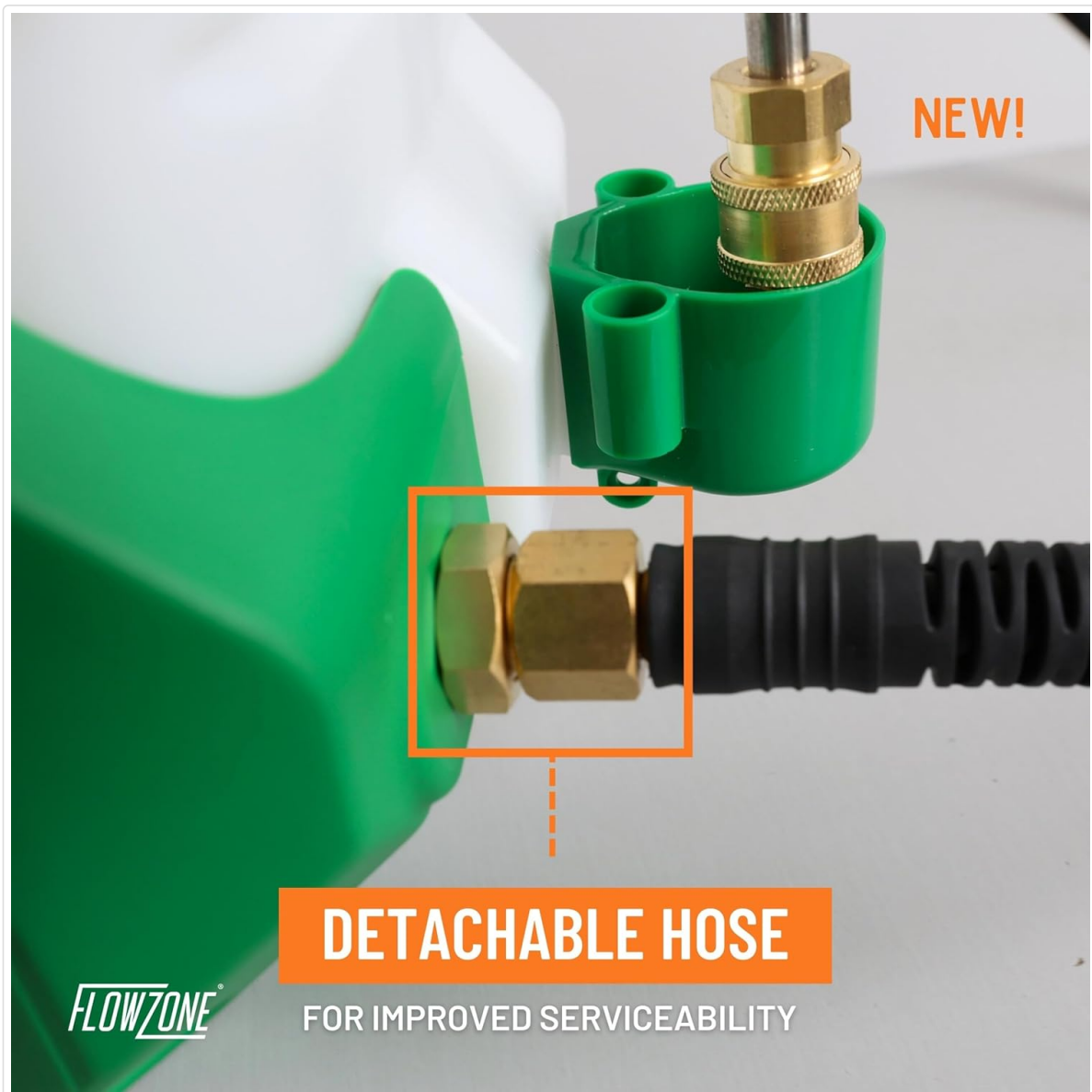
Image: Detailed view of the detachable hose connection point.