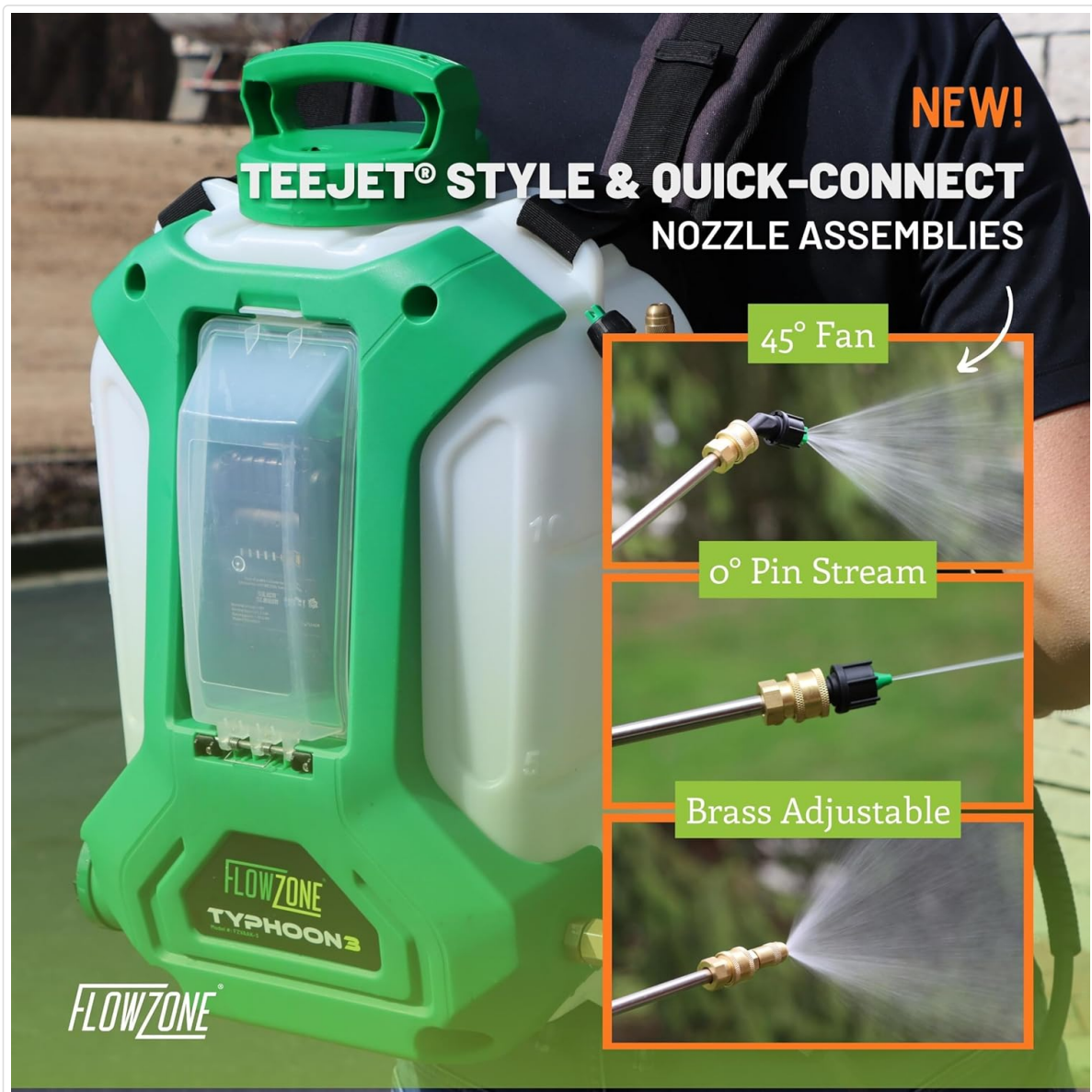
Image: Various quick-connect nozzles for different spray patterns.