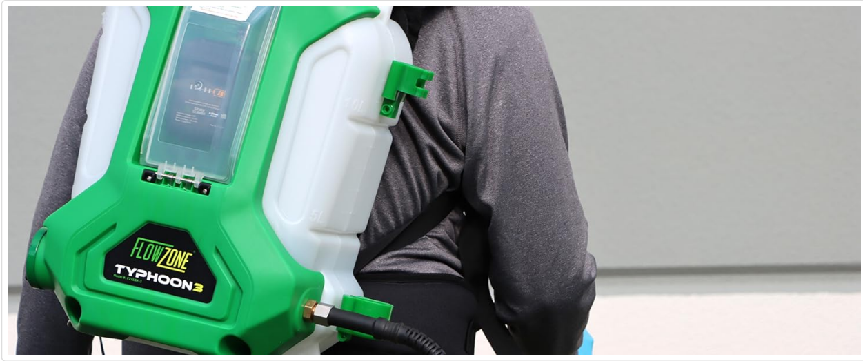
Image: User wearing the FlowZone Typhoon 3 backpack sprayer, highlighting its ergonomic design.