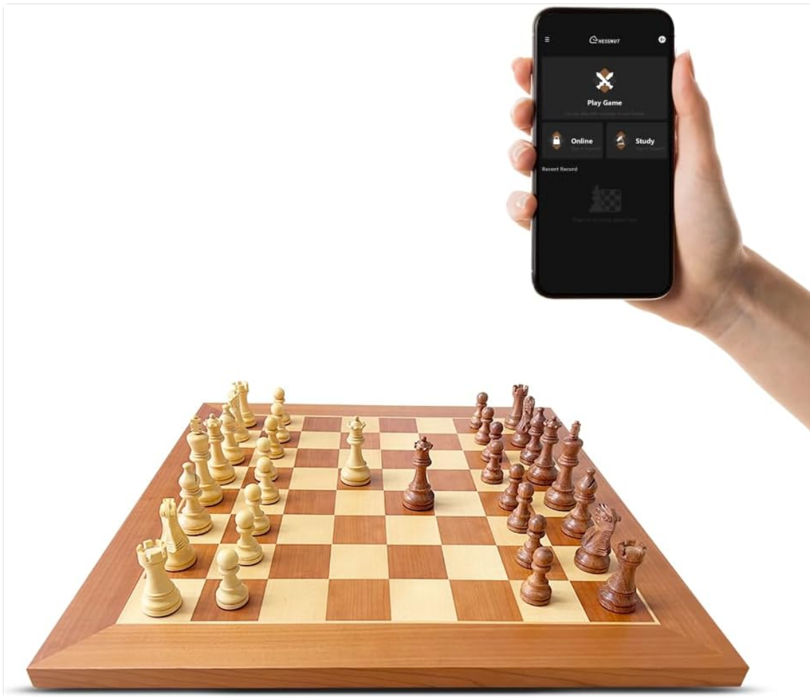
Figure 1.1: Chessnut Pro AI Electronic Chessboard with companion app on a smartphone.

This electronic chessboard features full piece recognition, allowing the board to automatically detect the position and movement of each piece. It supports Chess960 and offers AI-powered training with 20 adjustable difficulty levels. Users can connect to popular online chess platforms like Chess.com and Lichess to play against millions of players worldwide.