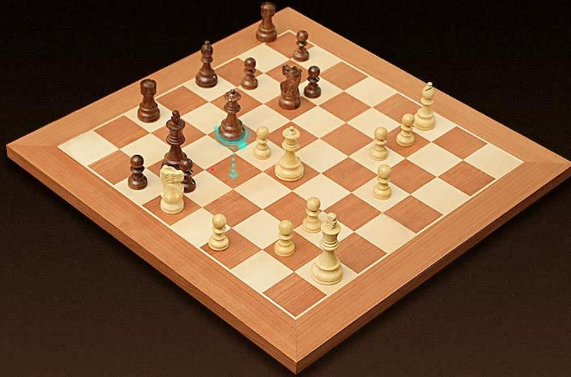
Figure 2.1: The Chessnut Pro board showcasing its integrated electronic features.

Sensing Your Moves Potential with Chessnut