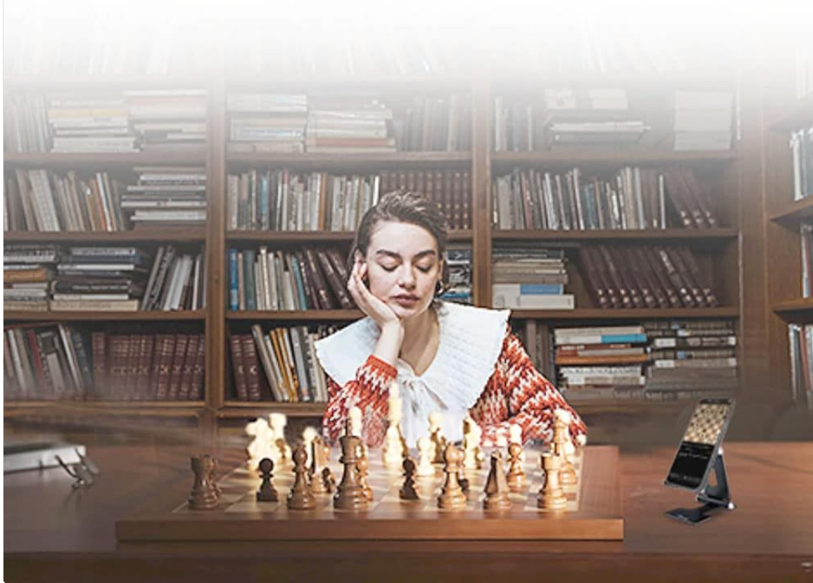
Figure 3.2: Connecting the Chessnut Pro to a mobile device for gameplay.