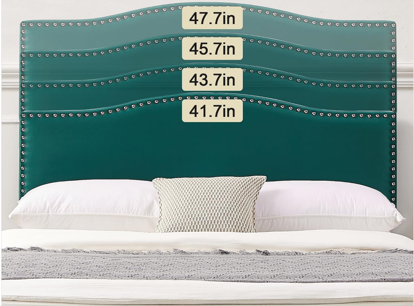
Image: Visual representation of the headboard's adjustable height settings.

Fit for Different Mattress Thickness (Recommend 6"-12" Mattress)