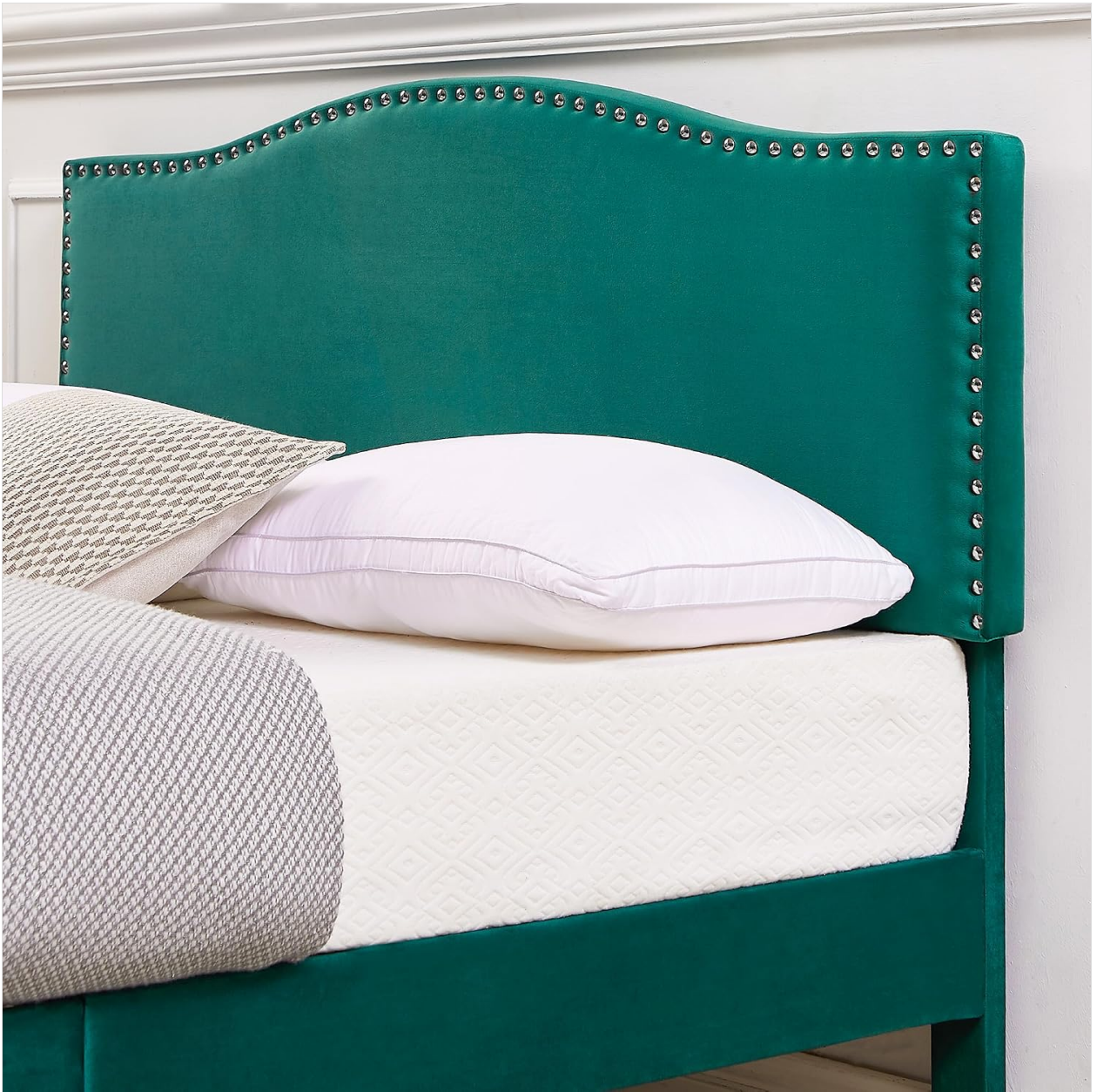
Image: Close-up of the upholstered headboard with decorative rivet detailing.