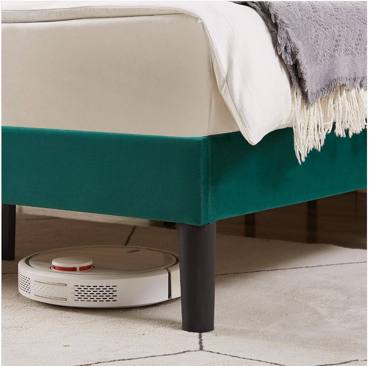
Image: Demonstrates the ample under-bed clearance, suitable for storage or robot vacuum cleaning.