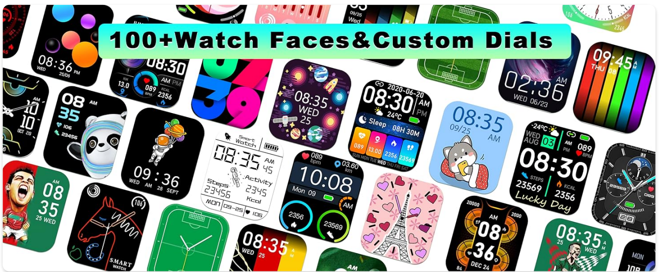
Image 4.11: A collage of diverse watch faces and custom dial options available for the smartwatch.