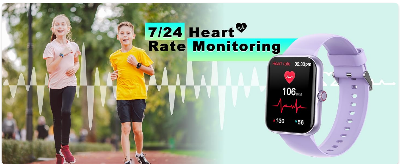
Image 4.5: The smartwatch interface showing continuous heart rate monitoring.