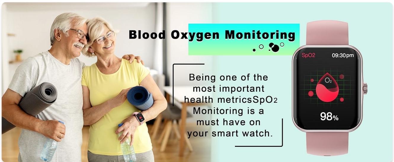
Image 4.6: The smartwatch displaying blood oxygen monitoring results.