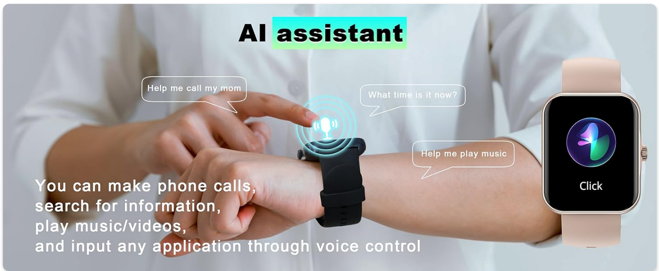
Image 4.13: A user engaging with the AI voice assistant feature on the smartwatch.