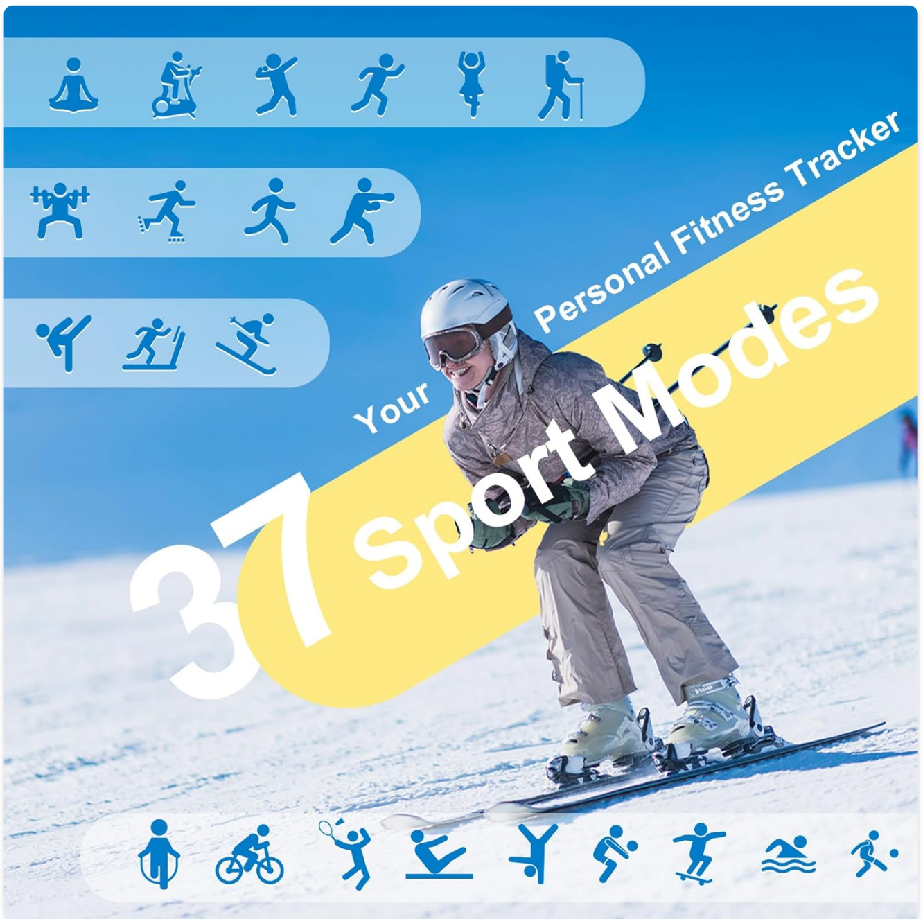
Image 4.8: Visual representation of the 37 available sport modes, including skiing, running, and cycling.