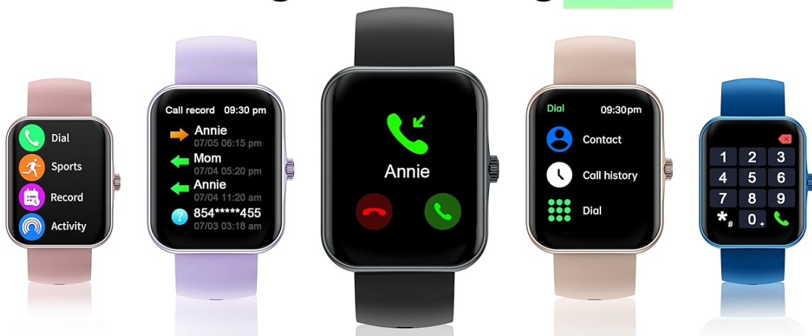
Image 4.2: Visual representation of making and answering calls directly from the smartwatch interface.