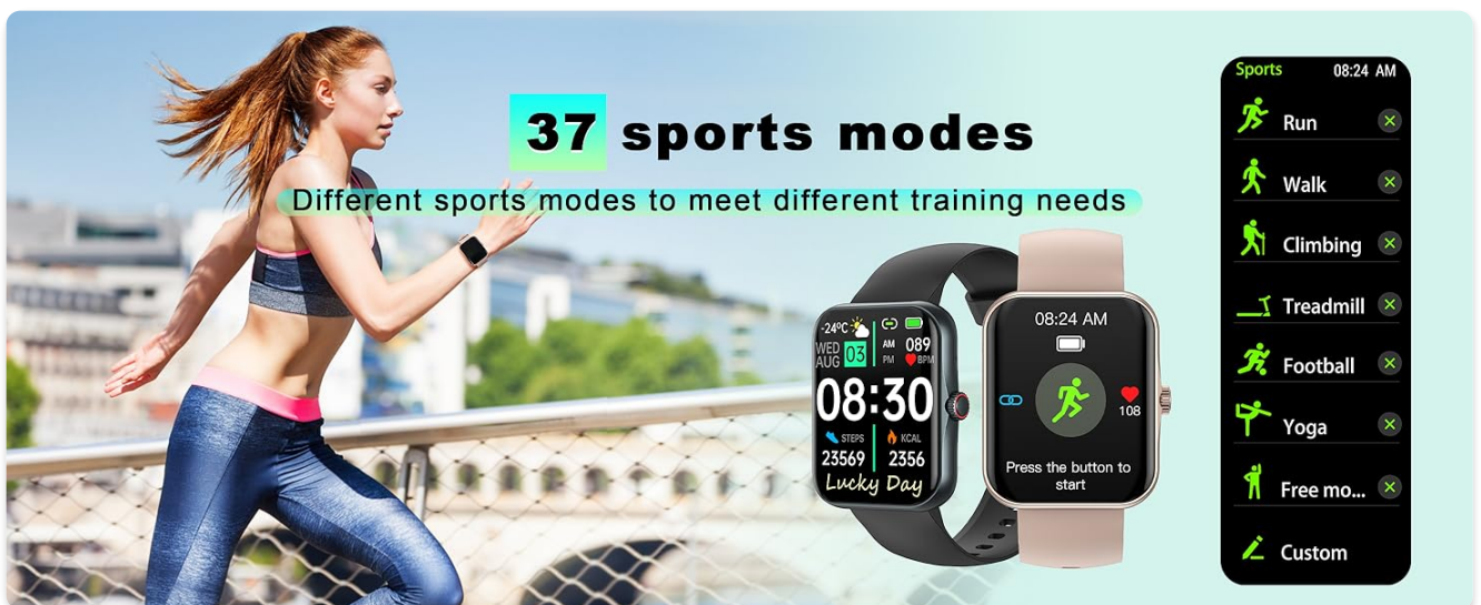
Image 4.9: The smartwatch interface showing a list of sports modes for selection.