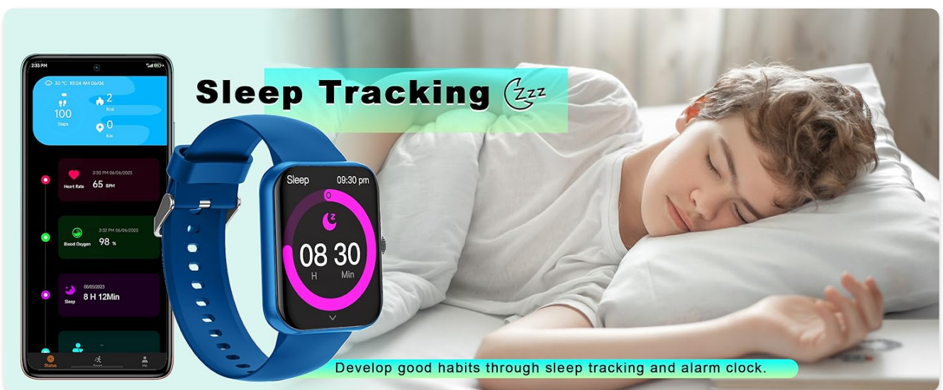
Image 4.7: The smartwatch showing sleep tracking data, encouraging healthy sleep habits.