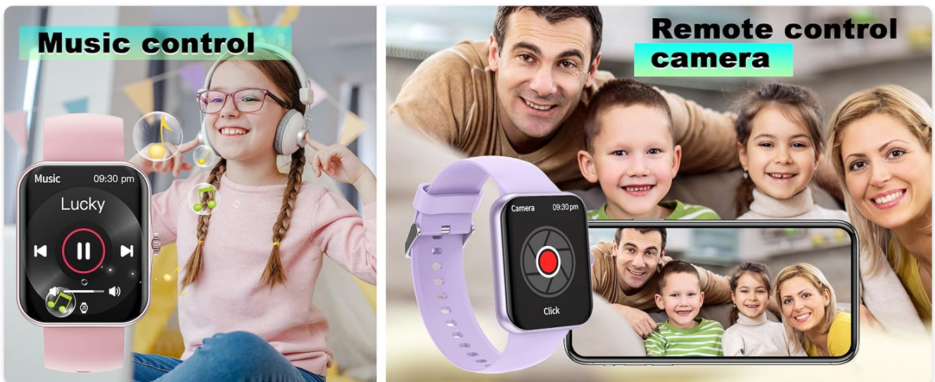
Image 4.12: The smartwatch interface for music control and remote camera operation.