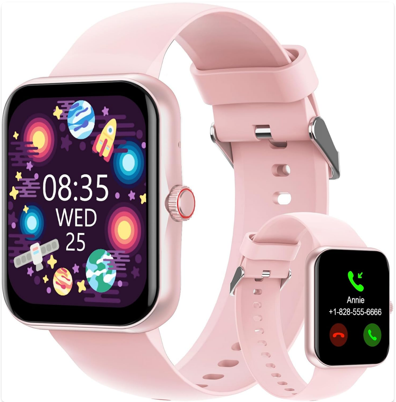
Image 1.1: The PTHTECHUS S80K Smart Watch, showcasing its display and pink strap.