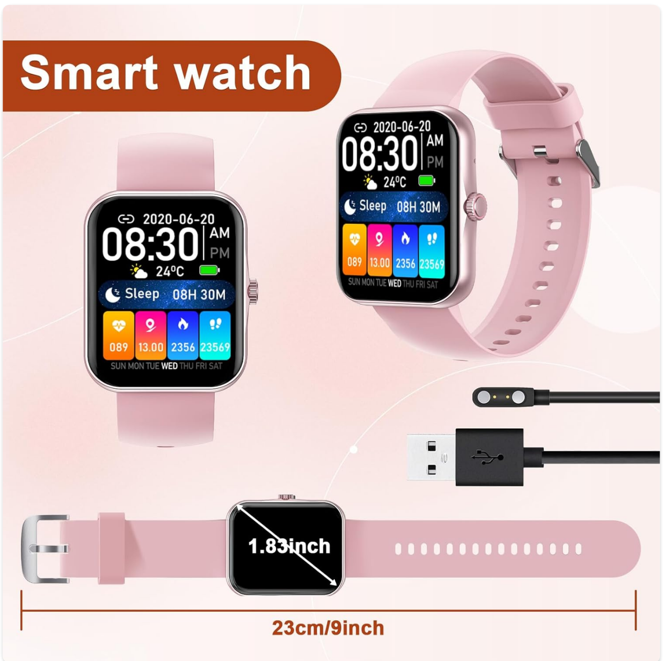
Image 2.1: Contents of the PTHTECHUS S80K Smart Watch package, including the watch and its charging cable, with dimensions.