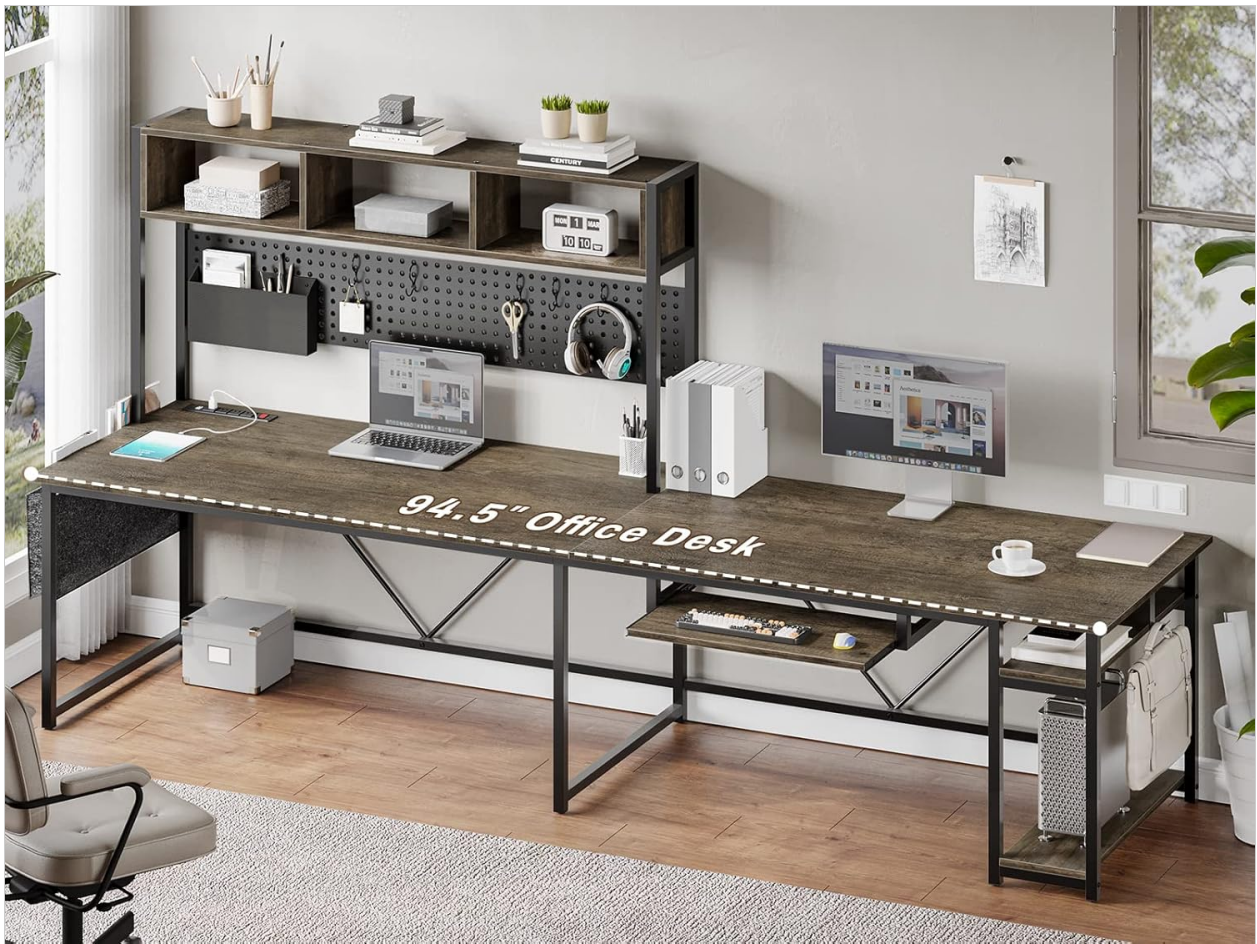
Image 1.1: Overview of the SEDETA L Shaped Desk in a 94.5-inch configuration.