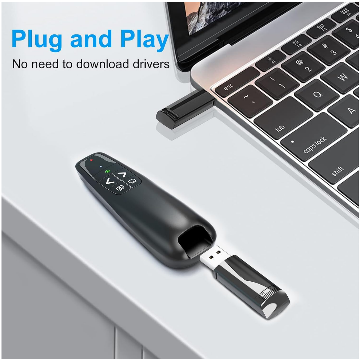
Figure 3.1: The USB receiver is shown plugged into a laptop, demonstrating the plug-and-play setup.