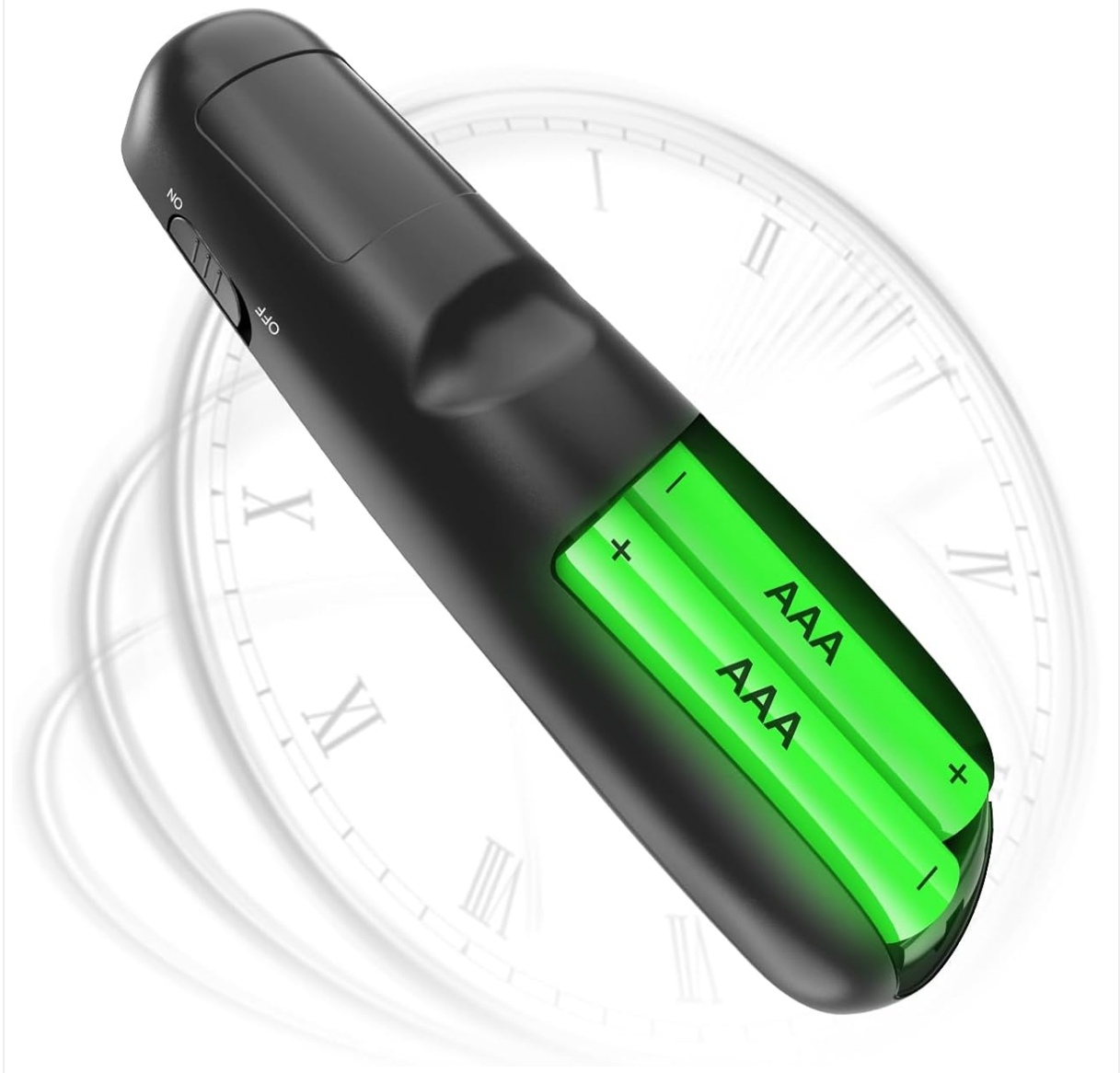
Figure 3.2: The battery compartment of the VILNIU Presentation Clicker showing two AAA batteries inserted, highlighting its long standby time.