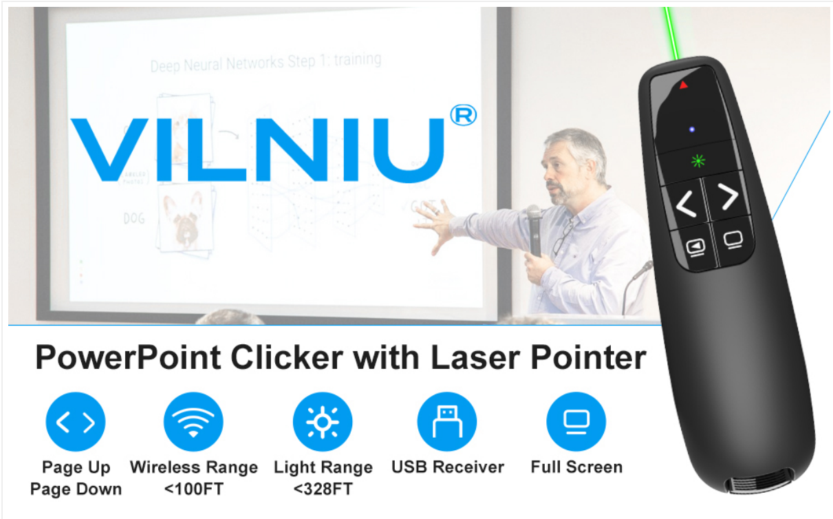
Figure 2.2: Overview of VILNIU PowerPoint Clicker features including page navigation, wireless range, light range, USB receiver, and full screen function.