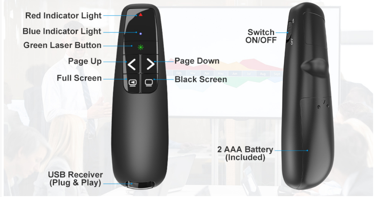
Figure 4.1: Diagram illustrating the function of each button on the VILNIU Presentation Clicker, including Page Up, Page Down, Green Laser Button, Full Screen, Black Screen, and the ON/OFF switch.