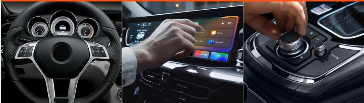
Image: Depiction of different control methods available for the adapter, including voice commands, touchscreen interaction, and physical car controls.