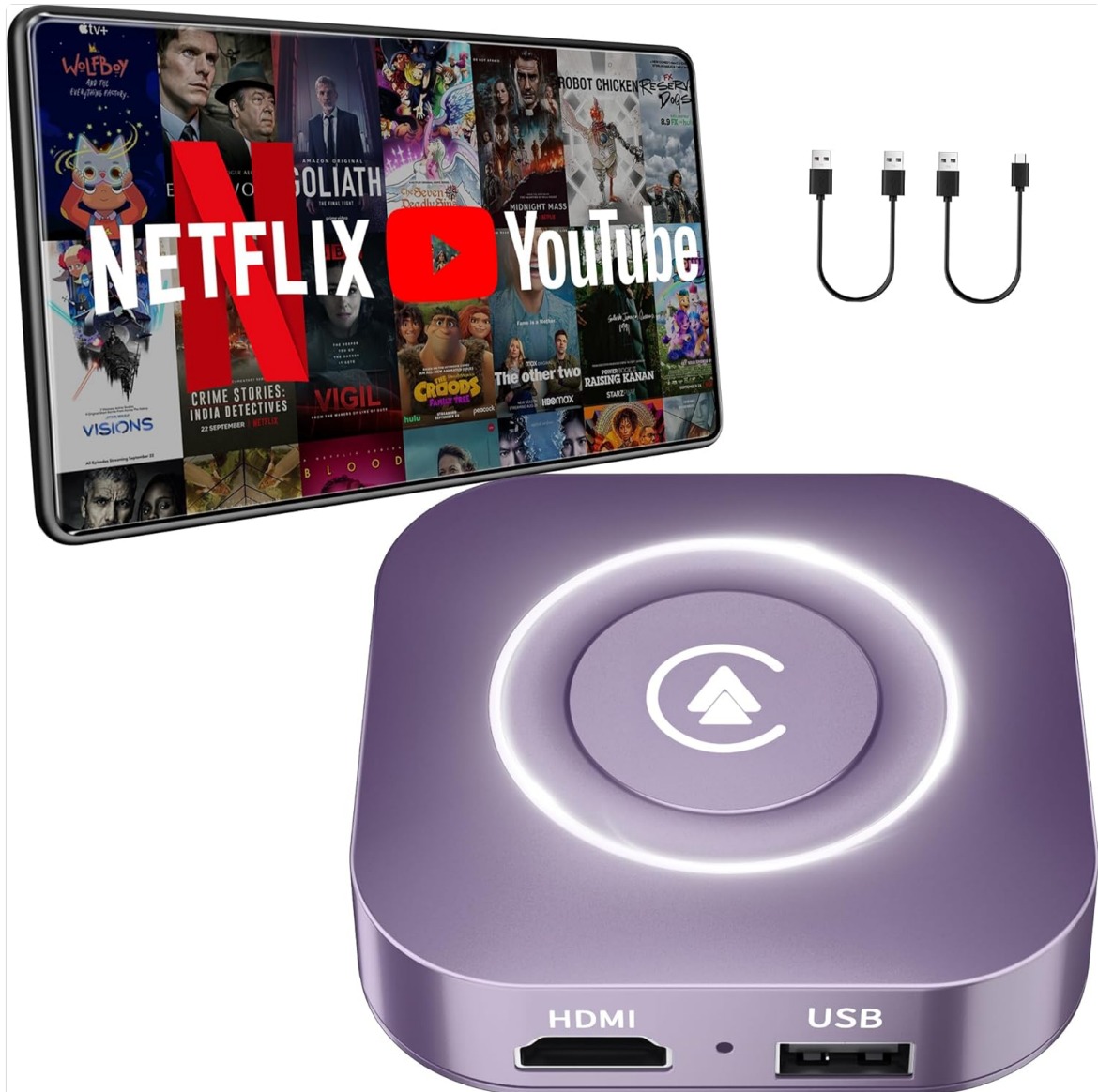
Image: The KAMING Wireless CarPlay Adapter Z3K with two USB cables (USB-A to USB-C and USB-C to USB-C).