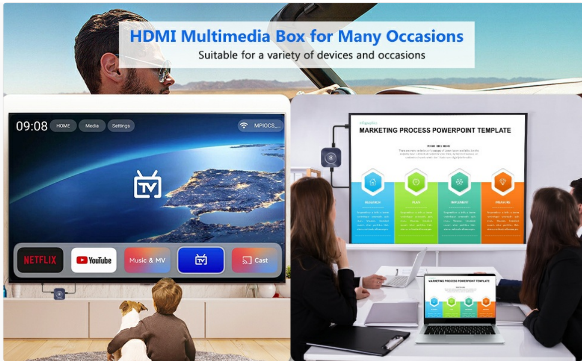
Image: The KAMING adapter connected to a television, demonstrating its use for home entertainment or presentations.