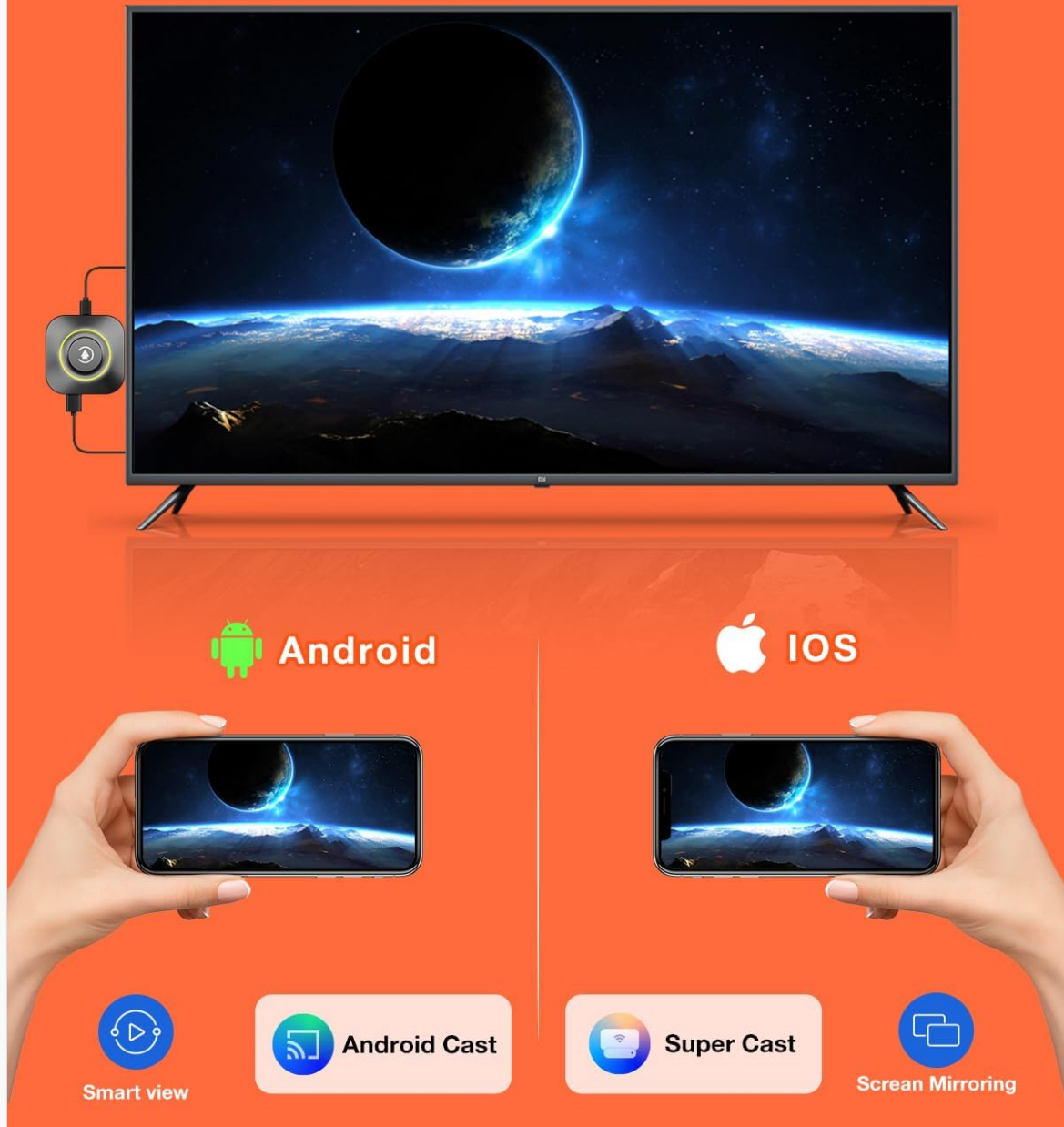
Image: Illustration demonstrating wireless mirroring from both Android and iOS phones to the car's display using the adapter.

Make sure the device and the phone are connected to the same WiFi