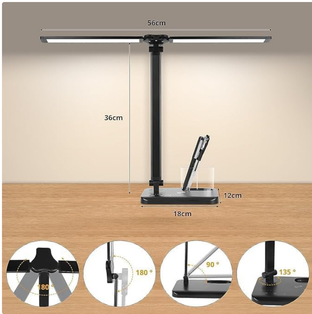
Figure 5: Adjustable arm and base for flexible positioning.