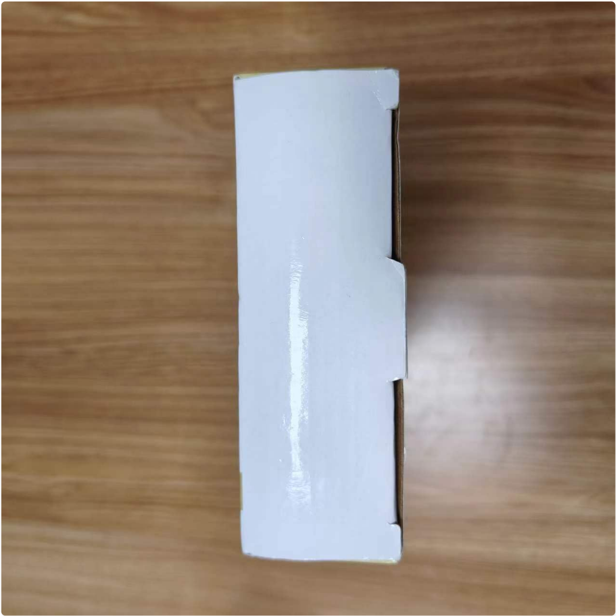
Figure 7: Product Dimensions.