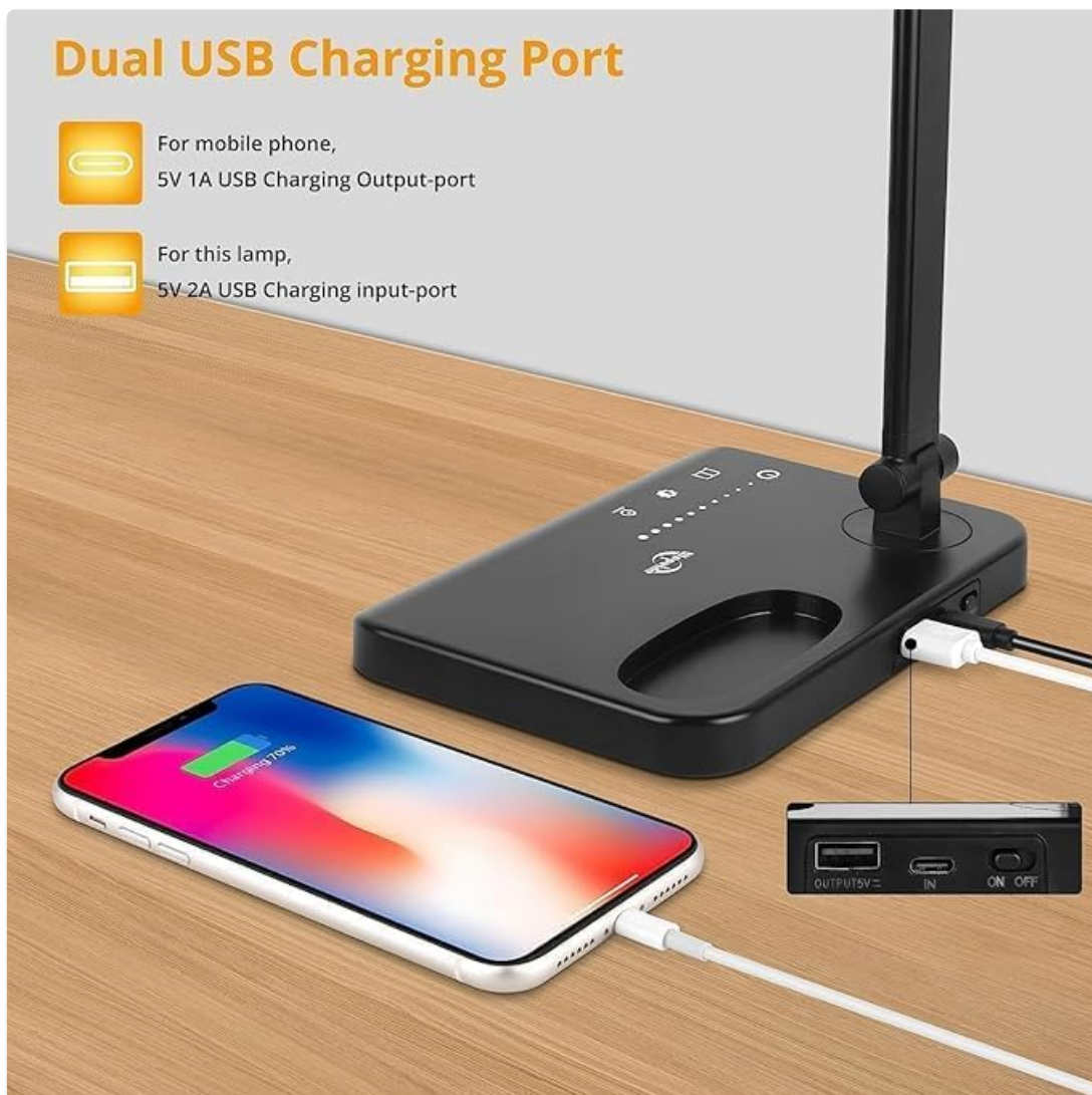
Figure 2: Detail of the lamp base, highlighting the USB input port and the manual ON/OFF switch.