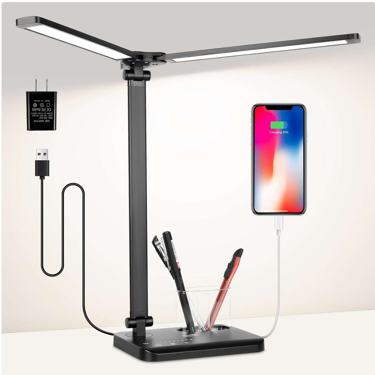
Figure 1: Woputne LED Desk Lamp with Dual Heads in use, demonstrating phone charging capability.