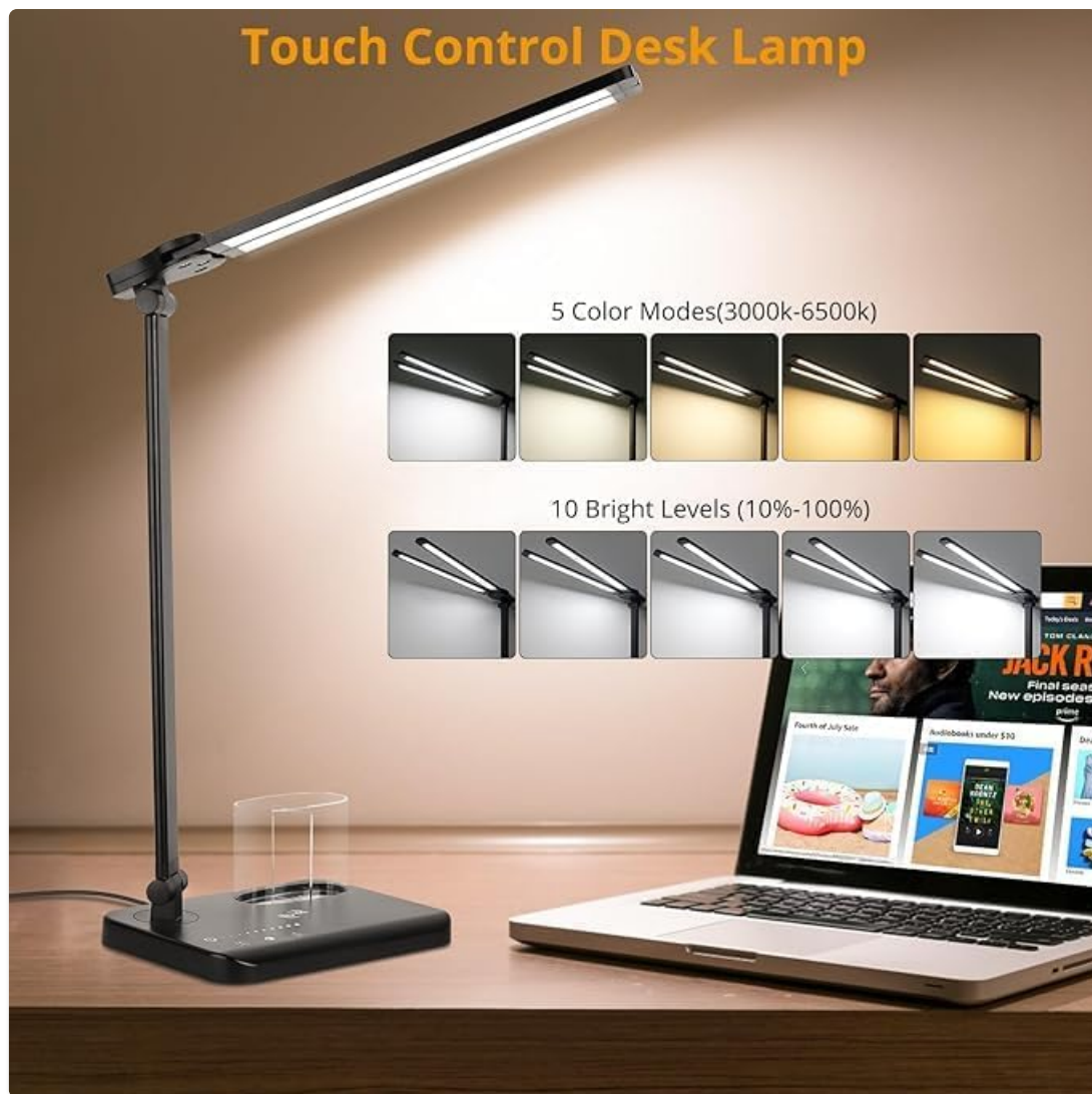
Figure 3: Touch control panel and visual representation of light modes and brightness levels.