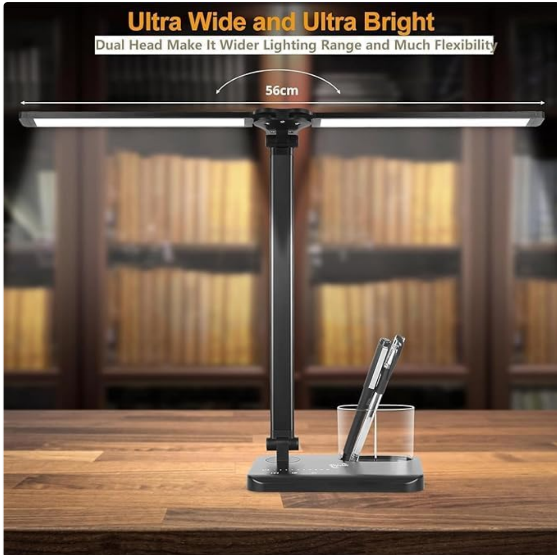
Figure 4: Dual head design for wide and flexible lighting.

The lamp features a unique dual-head design, allowing for flexible lighting. The two light bars can be adjusted independently or together to concentrate light for specific tasks or disperse it for broader illumination. The total length of the lamp head is 56cm, with each single head measuring 25cm.