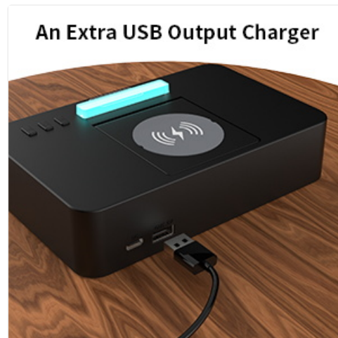
Image: The alarm clock with an extra USB output charger in use.

An additional USB-A port is located on the side or back of the alarm clock. Use this port to charge other devices that are not Qi-compatible or require a wired connection.