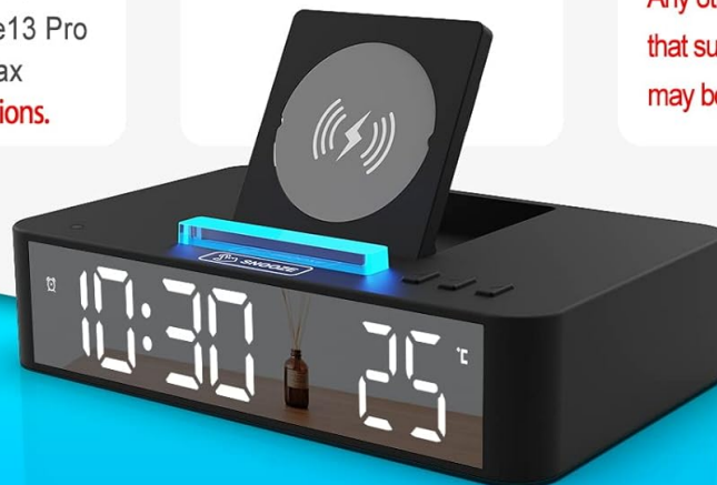
Image: Wireless charging panel with one-button lifting function, showing a phone charging at an optimized viewing angle.

Any other phones and devices that supports wireless charging may be compatible with.