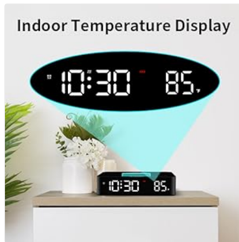
Image: Clock display showing time and temperature, highlighting brightness adjustment.