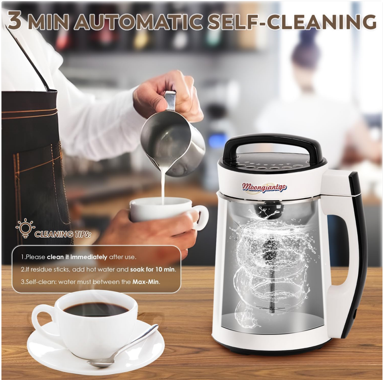
Figure 5.1: The automatic self-cleaning function in progress.