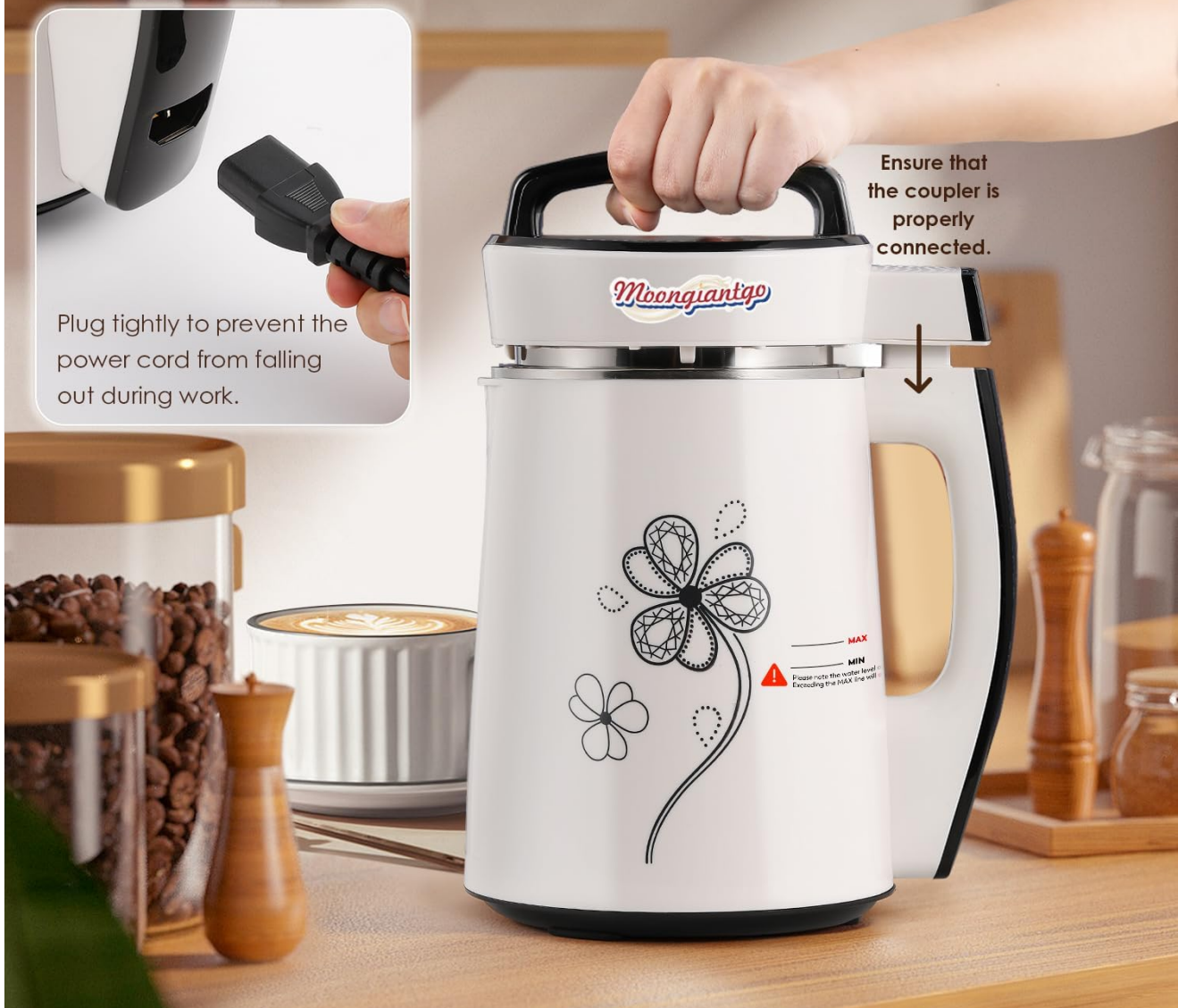
Figure 3.1: Proper connection of the power cord to the appliance.

Press any button during working and the machine will pause