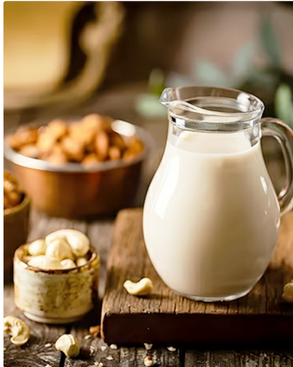
Figure 4.1: Adding ingredients to the pitcher.