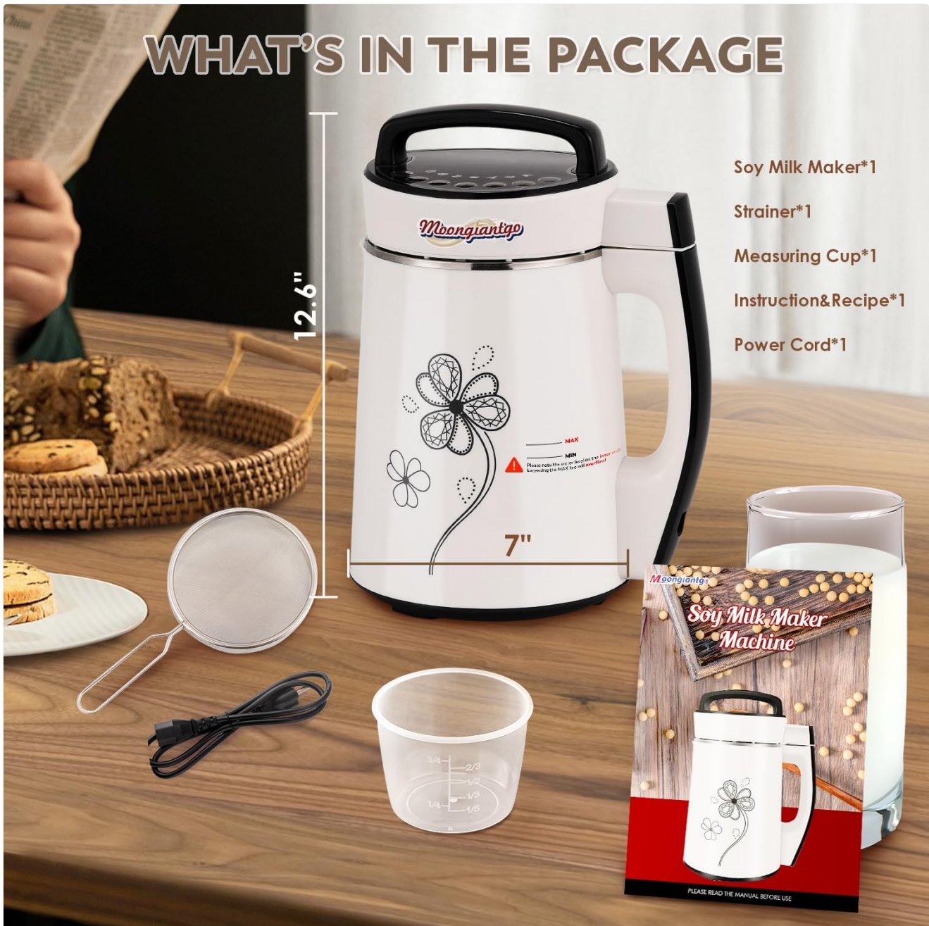
Figure 2.1: Contents of the product package, showing the main unit, strainer, measuring cup, power cord, and instruction manual.