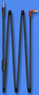
3.5mm Audio Cable