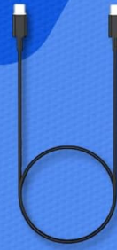
Daisy Chain Sharing Cable