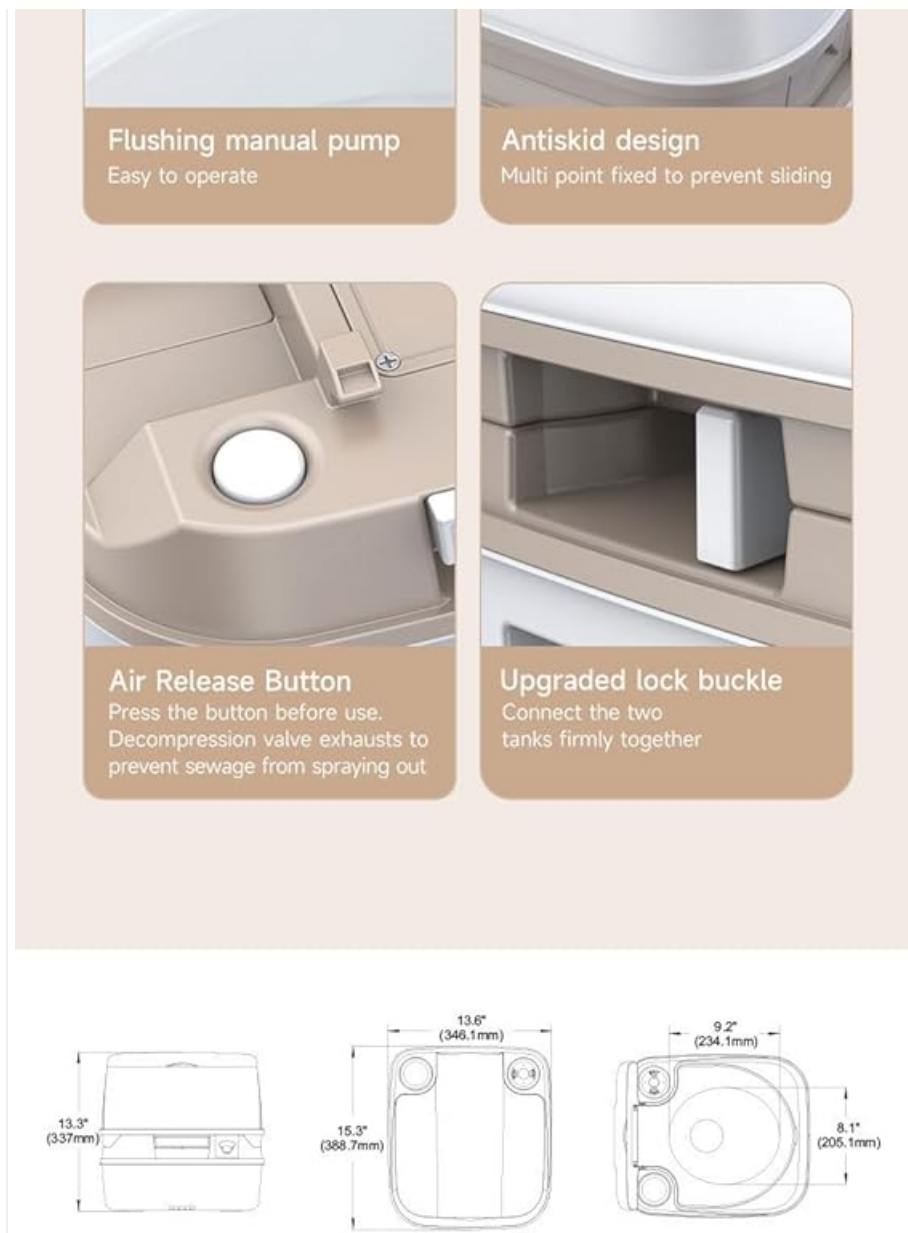
Image: A composite image detailing various components including the shock-proof buckle, built-in storage bin, flushing manual pump, antiskid design, air release button, and upgraded lock buckle for secure tank connection.