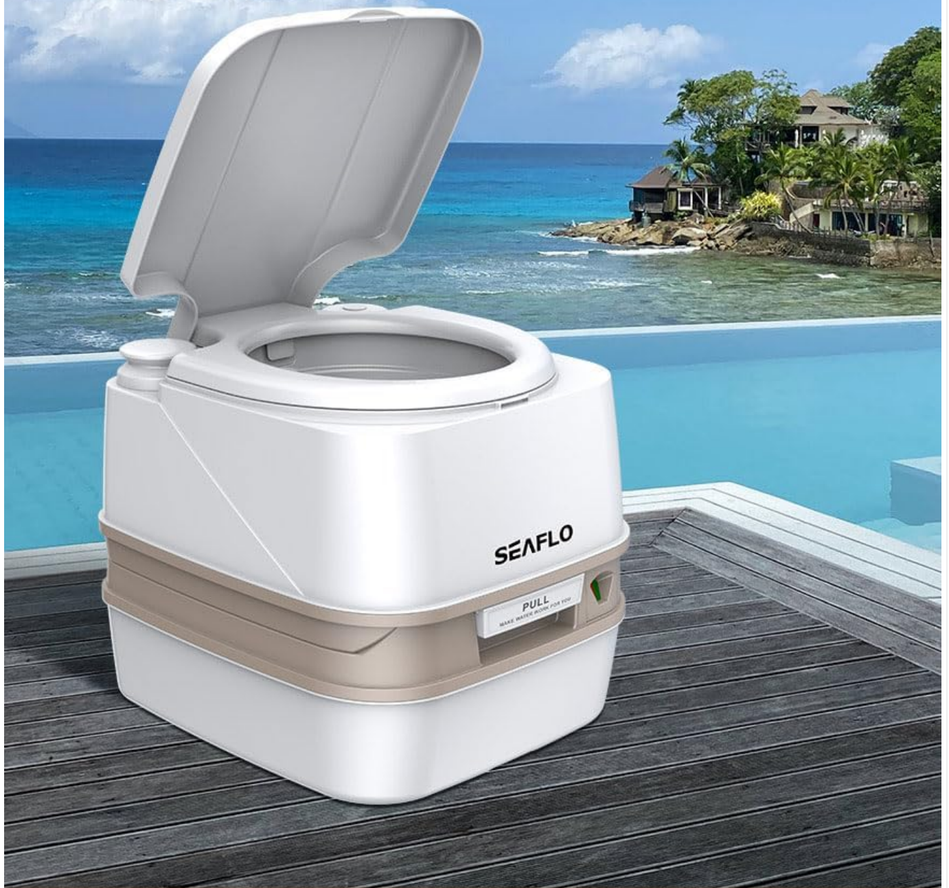
Image: The SEAFLO portable toilet positioned on a deck overlooking a scenic ocean view, illustrating its suitability for outdoor and travel