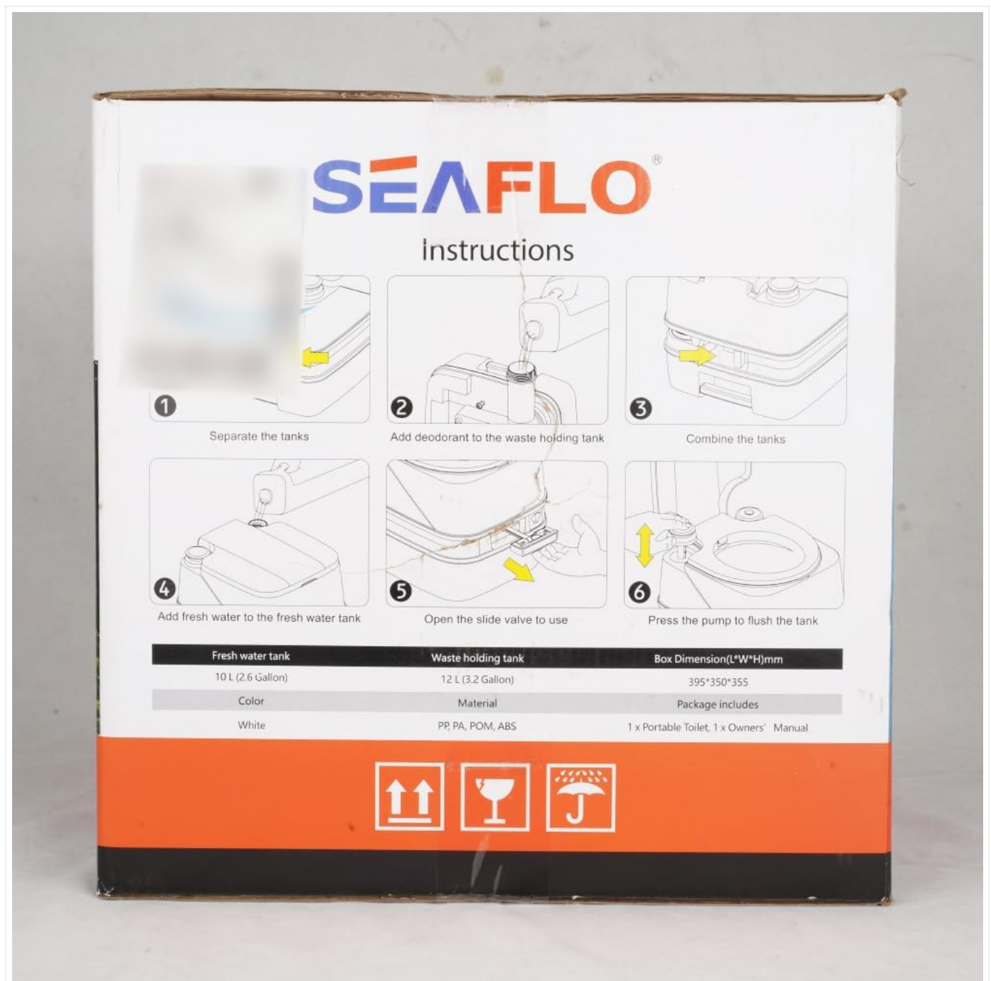
Image: A visual guide illustrating the six steps for setting up the SEAFLO portable toilet, including separating tanks, adding deodorant, filling