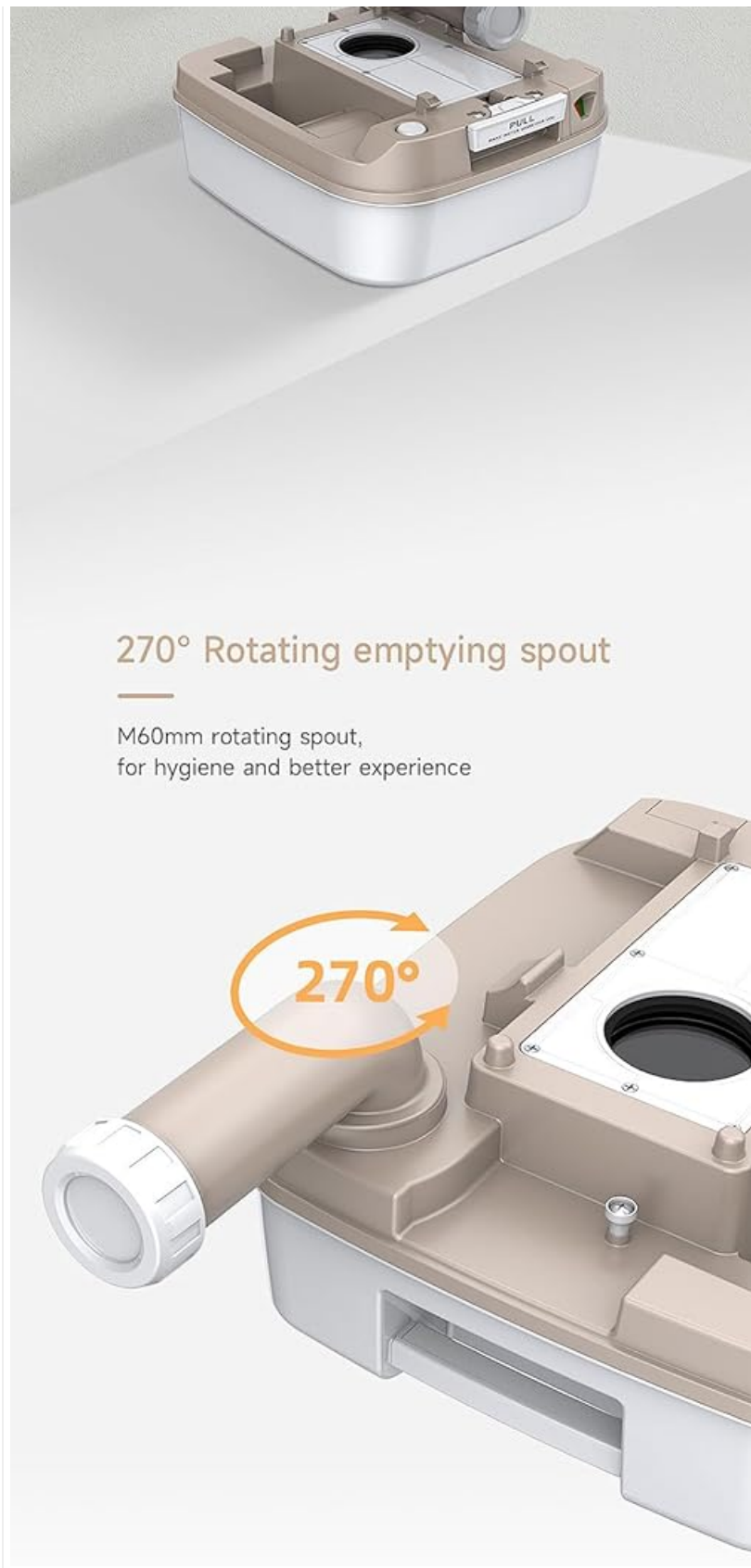
Image: A visual representation of the 270-degree rotating emptying spout, designed for hygienic and convenient waste disposal.