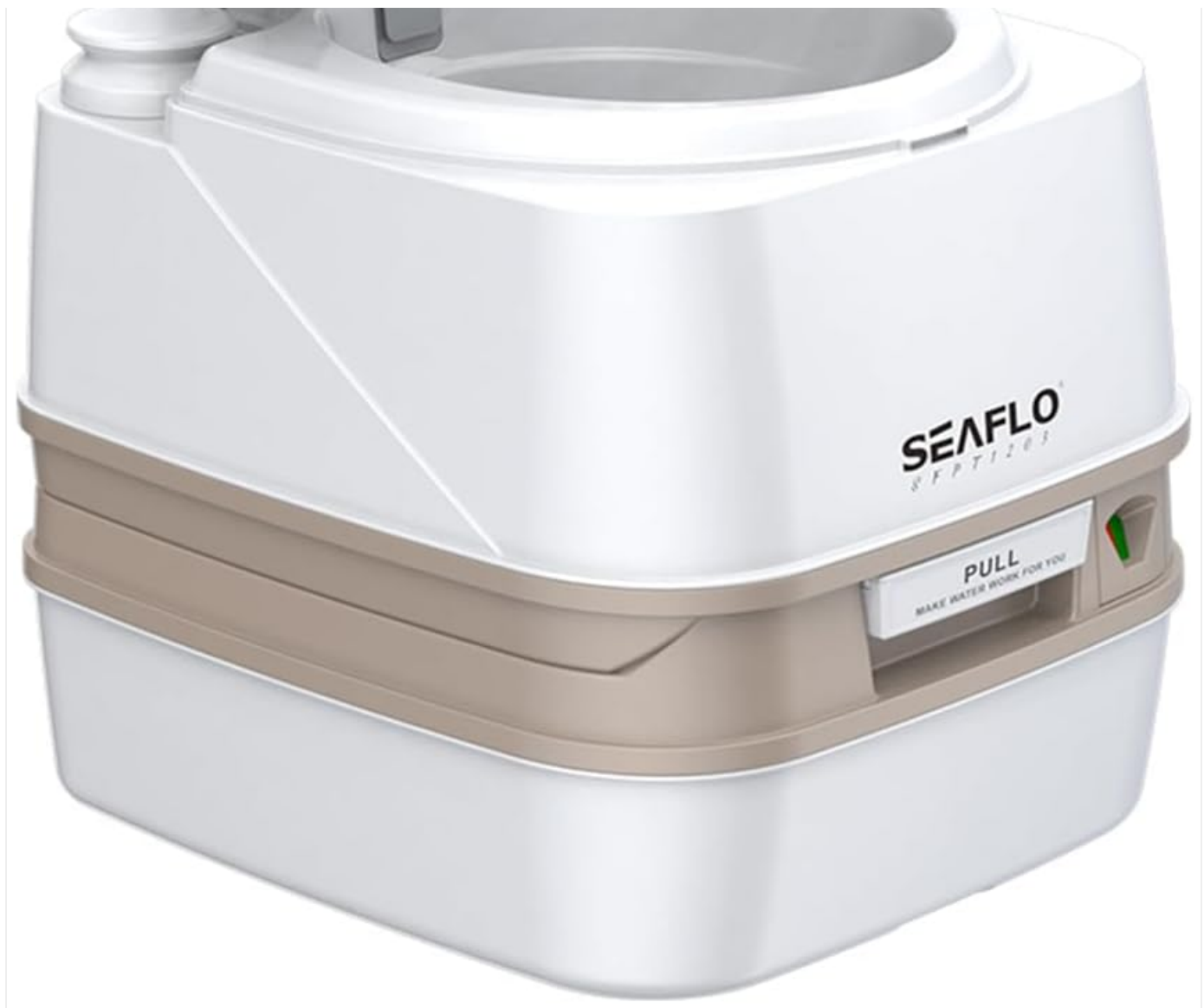
Image: The SEAFLO 3.2 Gallon (12L) Premium Portable Travel Toilet, Model SFPT-12-03, shown with the lid open, highlighting its compact and modern design.