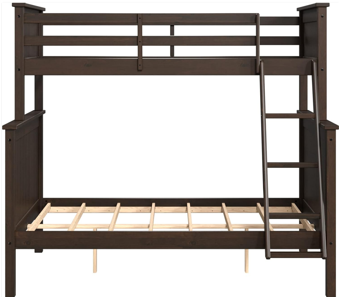
Image: Components for bed frame assembly.