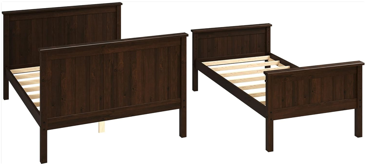
Image: The Linon Coco bed configured as two separate beds, one twin and one full.