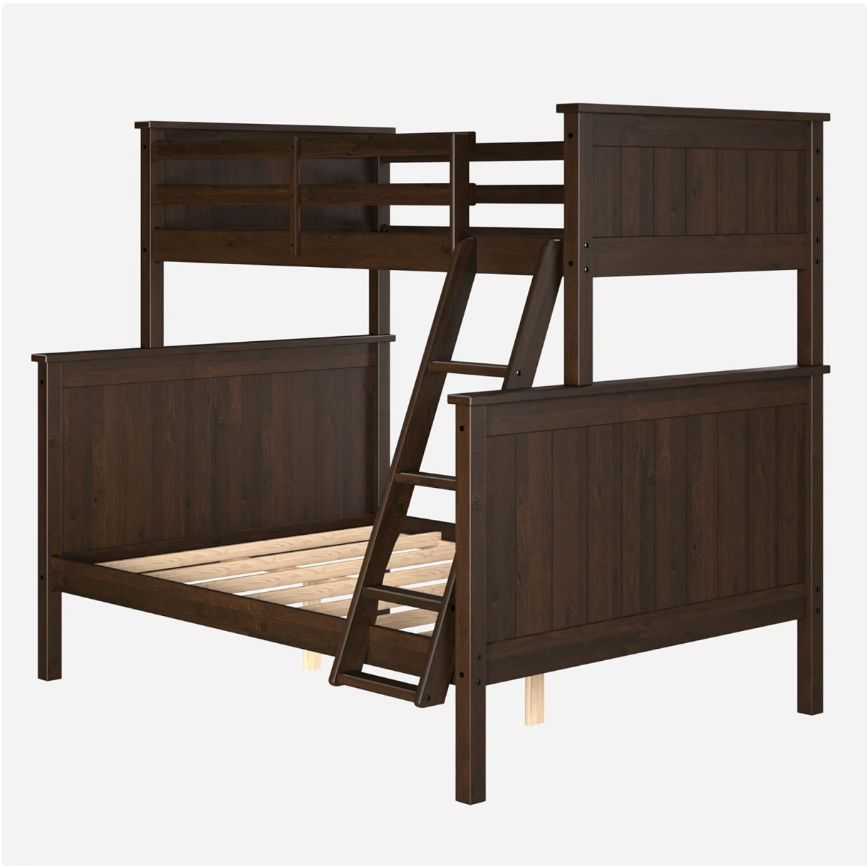
Image: Fully assembled Linon Coco Walnut Twin Over Full Bunk Bed.