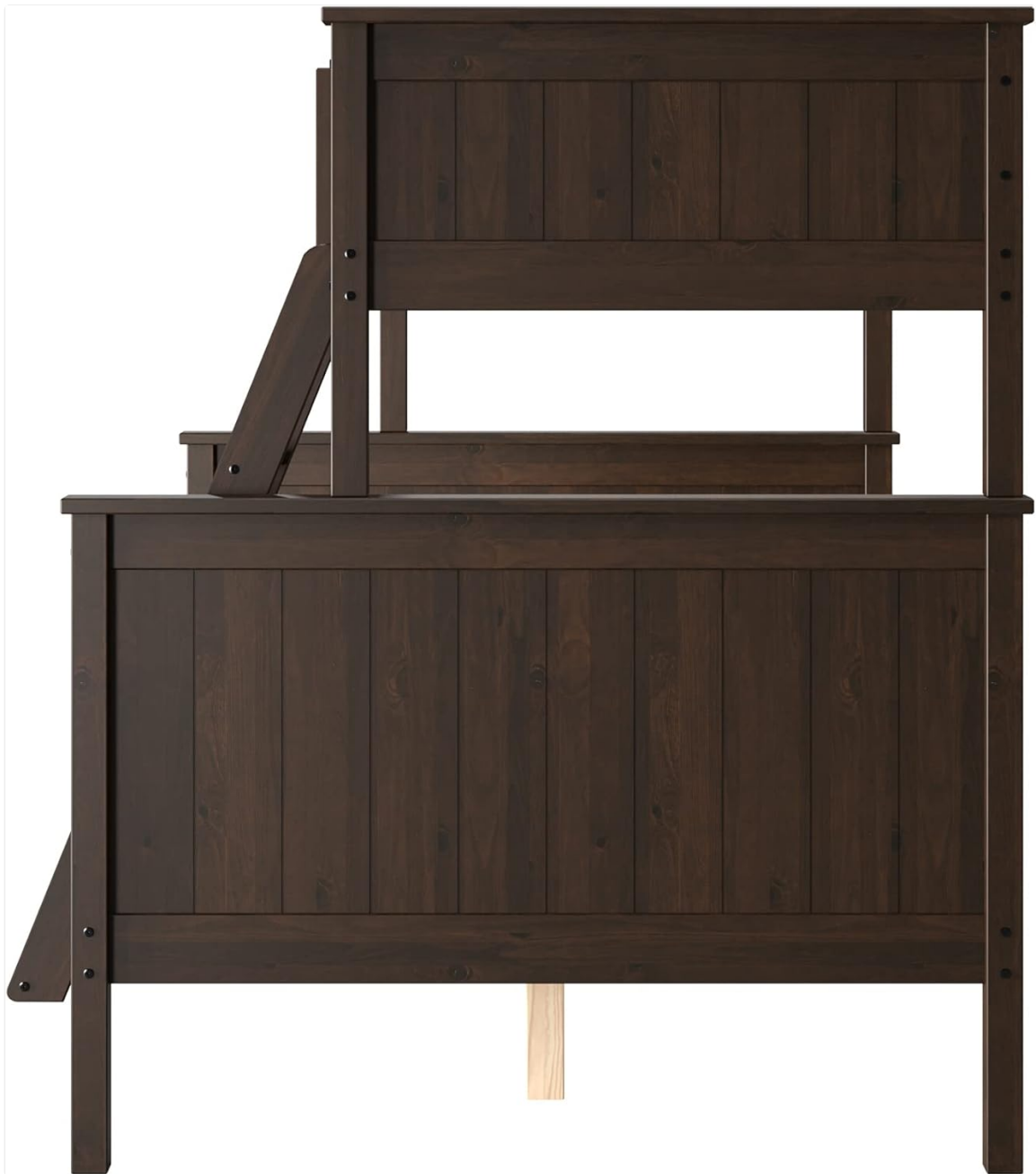
Image: Components for the upper twin bed frame.