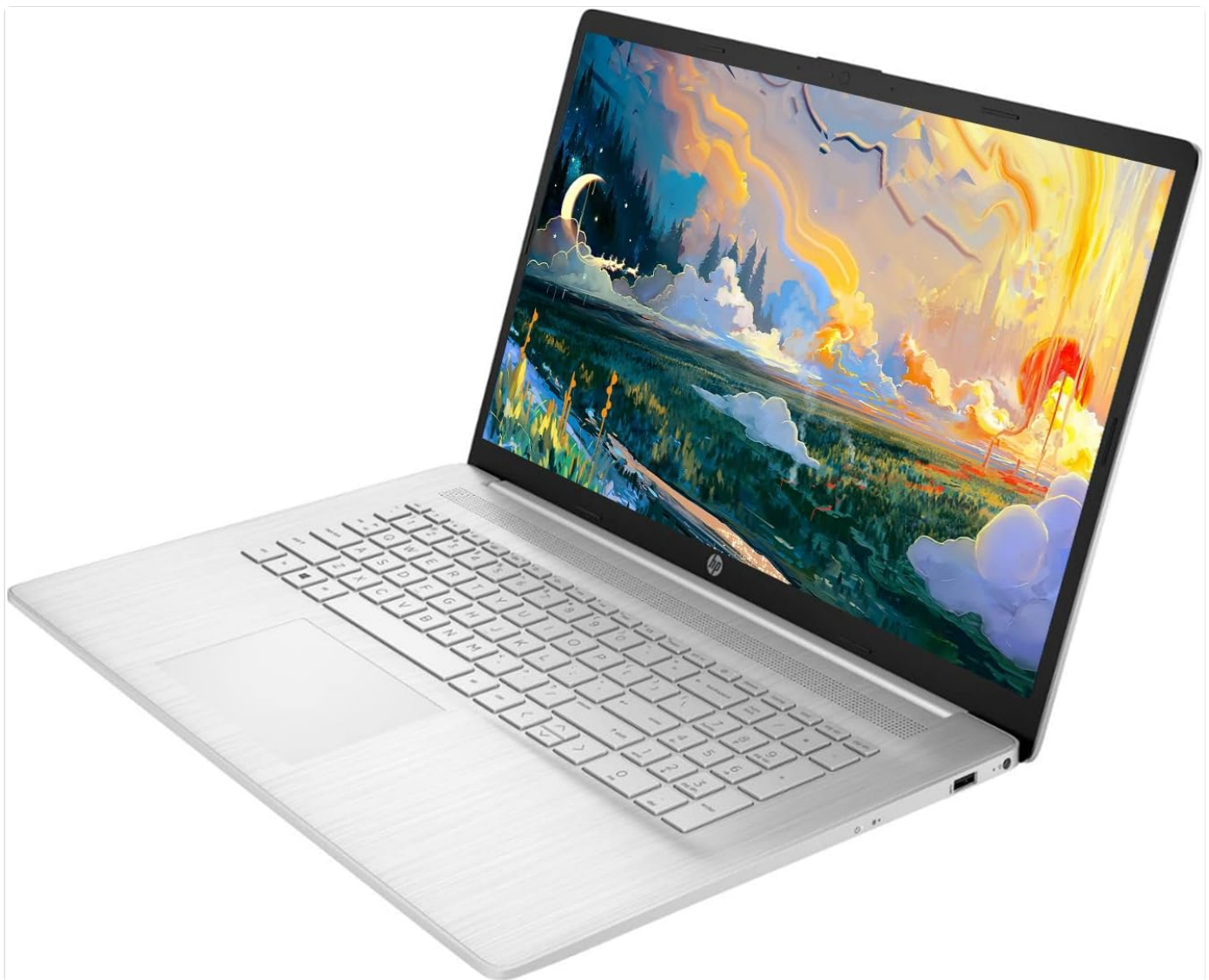
Image: The HP 17 Laptop with its screen open, highlighting the expansive display and keyboard layout.