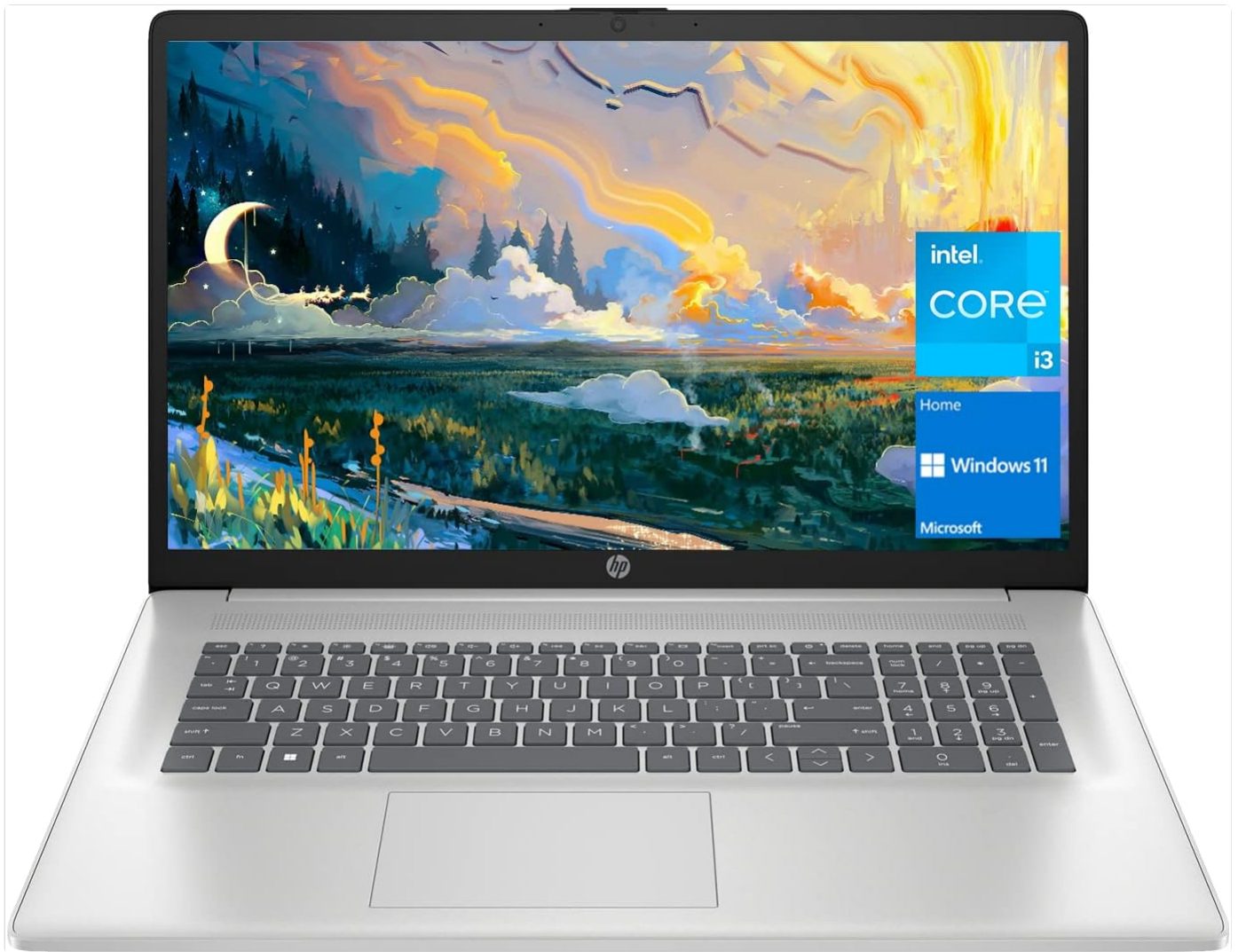
Image: The HP 17 Laptop, showcasing its sleek silver design and the HP logo on the lid.