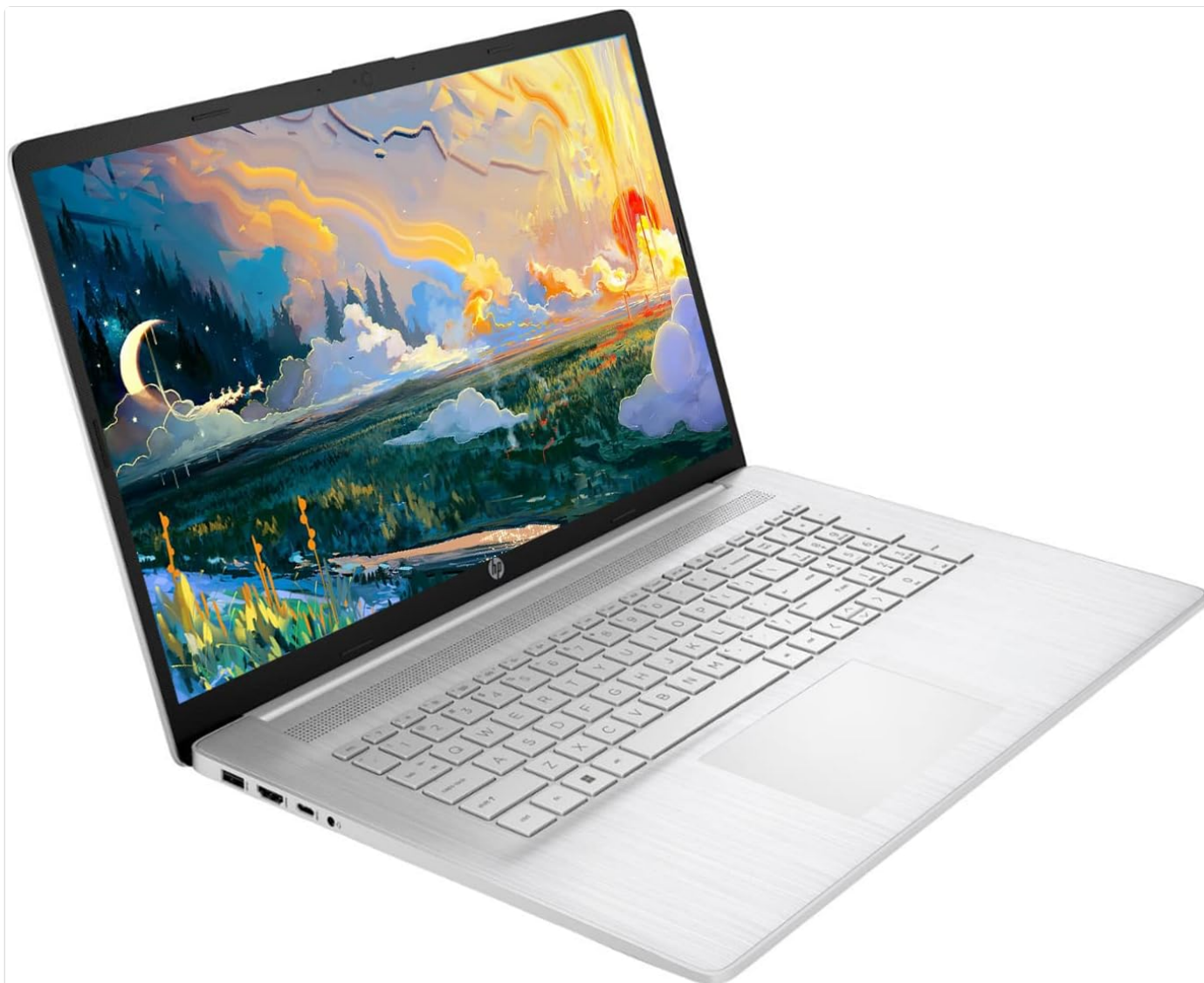
Image: A different angle of the laptop's side, illustrating the HDMI and USB Type-A ports.