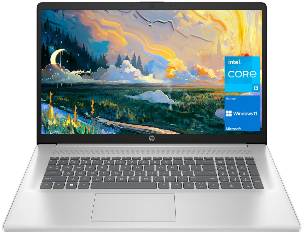
Image: The HP 17 Laptop in silver, shown open with its 17.3-inch display.