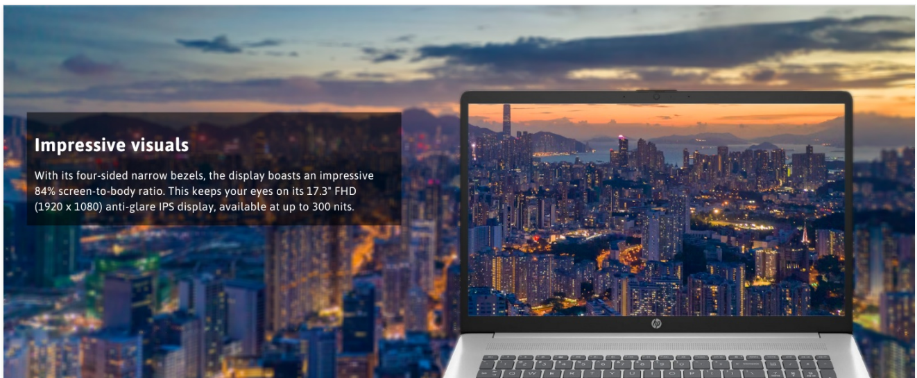
Image: The laptop display showcasing a high-definition image, demonstrating visual clarity.

The 17.3-inch HD+ (1600 x 900) anti-glare display provides clear visuals. Adjust brightness using the function keys (F2/F3) or through Windows display settings.