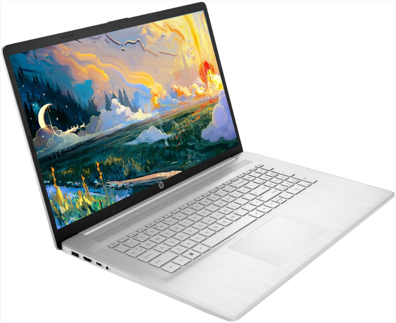
Image: Left side view of the laptop highlighting the USB Type-A, HDMI, USB Type-C, and Headphone/Microphone Combo ports.